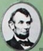
Abraham Lincoln 1809-1865