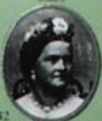
Mary Todd 1818-1882