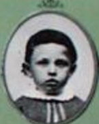
Thomas "Tad" 1853-1871