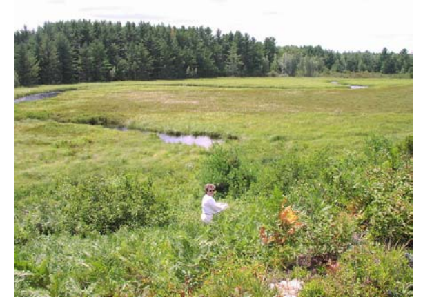
Weed problems in riparian buffer planting.

Problems common to both types of buffer restoration methods include plant to plant