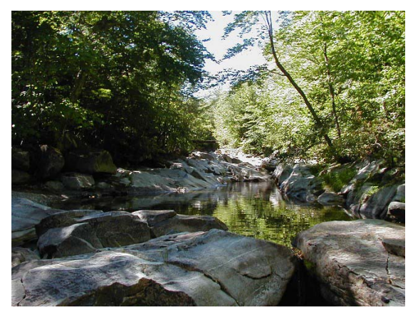
Naturally regenerated riparian buffer.

Natural regeneration is defined as species reproduction obtained by natural seeding or from sprouts. The literature available concerning natural regeneration is limited, especially for restoration of riparian areas. What is known is that naturally vegetated riparian areas are among the most productive and diverse plant communities (Klapproth 2001). This vegetation is adapted to wide fluctuations in water levels and regular disturbances. One of the most recent studies to be completed was in Maryland by the Department of Natural Resources - Forest Service in April of 2001. They found that a large percentage of their planted survey sites contained natural