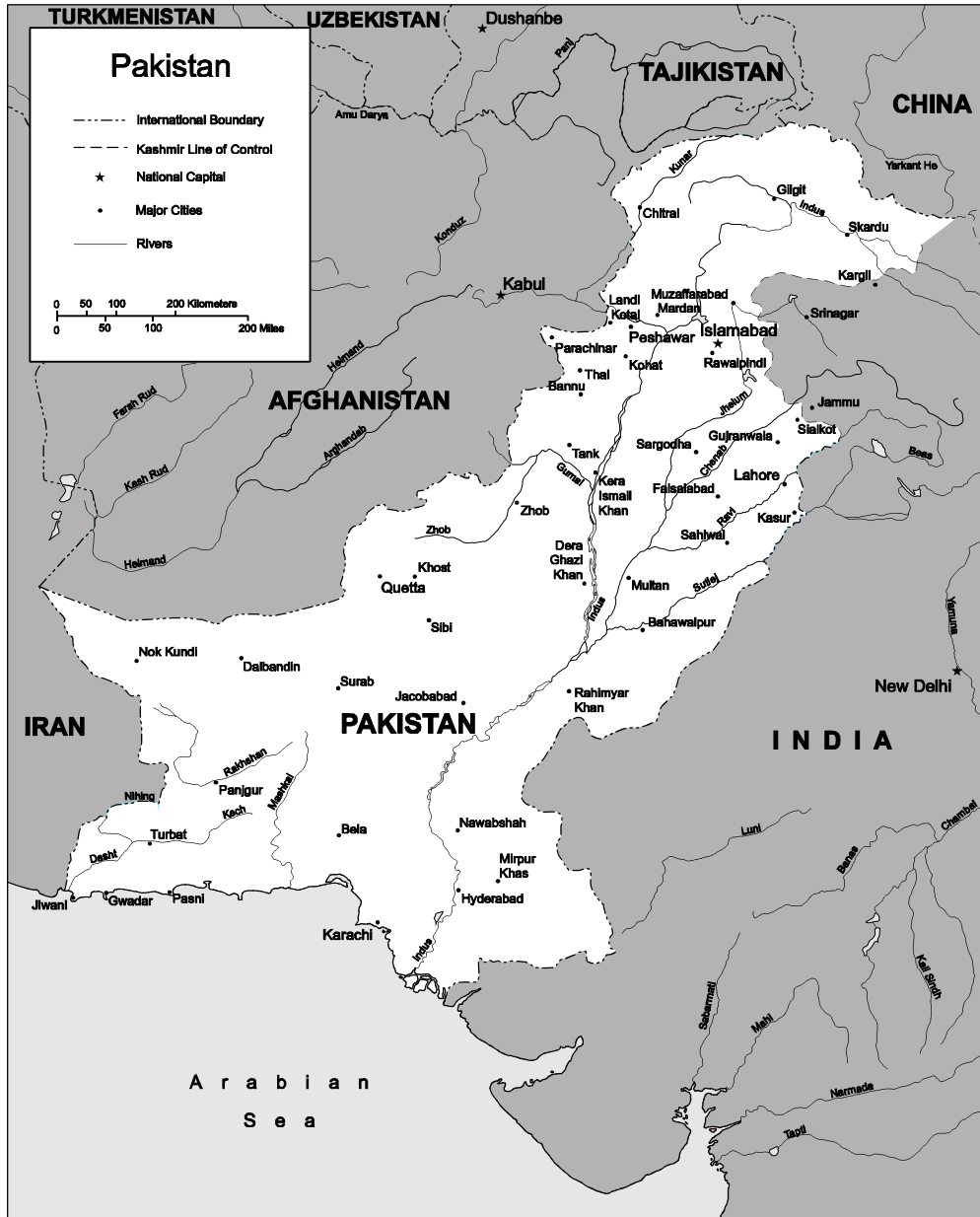
Figure 2. Map of Pakistan