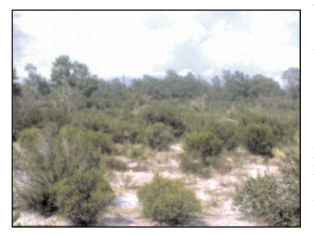
Florida scrub. Original photograph courtesy of The Nature Conservancy.

F lorida scrub is a plant community easily recognized by the dominance of evergreen shrubs and frequent patches of bare, white sand. With more than two dozen threatened and endangered species dependent upon scrub, the entire community is itself endangered. Recovery of the community and its associated plants and animals will depend upon land acquisition and effective land management.