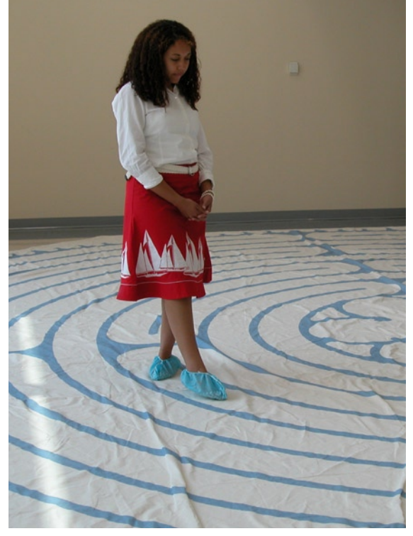
Mindful walking can be restful to labyrinth users.

smaller than the ones made for walking and in size, if not conceptually, they are somewhat like the "finger labyrinths" offered as tabletop versions for individuals who are not ambulatory.