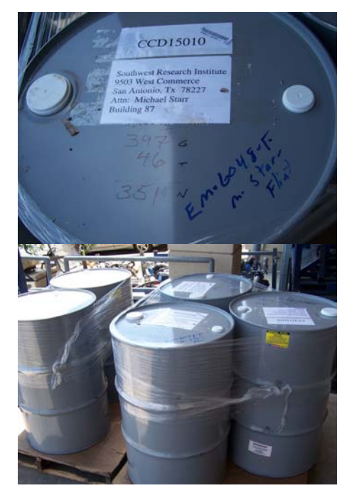
Figure 1. Sealed drums of Flint Hills Resources diesel fuels