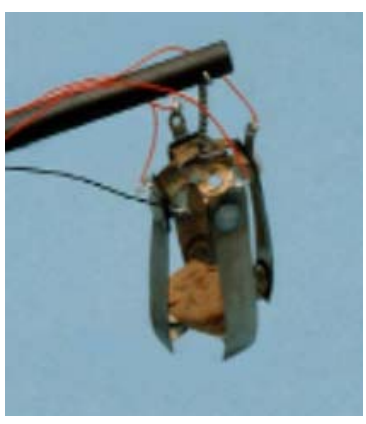
FIGURE 2 : 4-finger EAP gripper lifting a rock.

of polymers that can be activated by non-electrical means include: chemically activated, shape memory polymers,