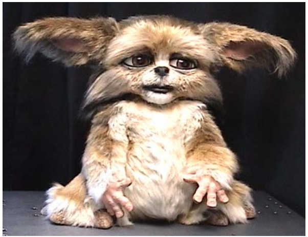
FIGURE 6 : Sociable robots under development at MIT. To the left is Kismet, an expressive face robot. To the right is Leonardo, the successor of Kismet, designed in collaboration with Stan Winston Studio.