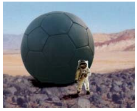
FIGURE 1: The tumbleweed (left) offered an inspiration for a futuristic design of a Mars lander.