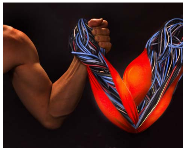
FIGURE 3 : Grand challenge for the development of EAP actuated robotics.

of polymers that can be activated by non-electrical means include: chemically activated, shape memory polymers,