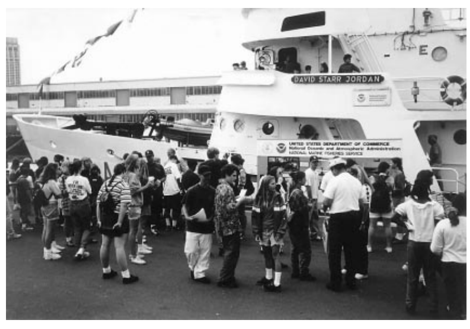
Hundreds gathered on the NOAA Ship David Starr Jordan for an open house in San Diego celebrating the 125th anniversary of NMFS and the 30th anniversary of the ship itself.

Shipboard exhibits staffed by Center scientists focused on research conducted on marine mammals, coastal fisheries, tuna and billfish, and the Antarctic ecosystem. They included a live fish tank filled with anchovies, sardines and mackerel; penguin eggs and feathers; a section of whale rib bone; swordfish and marlin bills; powerful binoculars