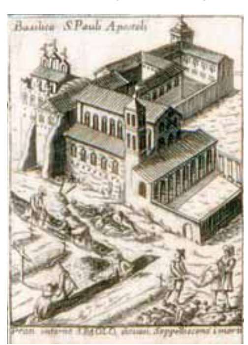
Black Death Plagued Medieval Europe

In a fascinating find in the late 20th century, researchers uncovered evidence that prehistoric humans were troubled by microbial parasites and used natural remedies against them. Along with the frozen mummy of the "Ice Man," who was found in the mountains of northern Italy and lived between 3300 and 3100 B.C., scientists found a type of tree fungus containing oils that are toxic to intestinal