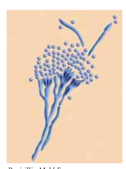
Penicillin Mold Fungus

A fungus is actually a primitive plant. Fungi can be found in air, in soil, on plants, and in water. Thousands, perhaps millions, of different types of fungi exist on Earth. The most familiar ones to us are mushrooms, yeast, mold, and mildew. Some live in the human body, usually without causing illness. Fungal diseases are called mycoses.