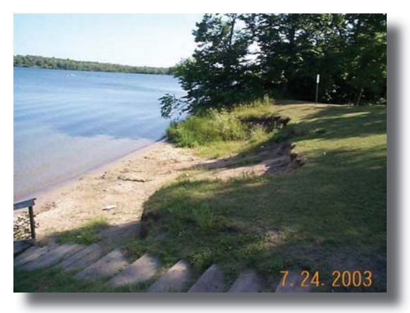
Shoreline erosion photo before project in 2003

In 2006, Phase 2 has been completed. Funds were raised through raffles and donations, partnerships were developed with DNR who donated new concrete planks, and the boat ramp was repaired and planks re-laid so there is now a good ramp in place for fishermen and boaters to use.