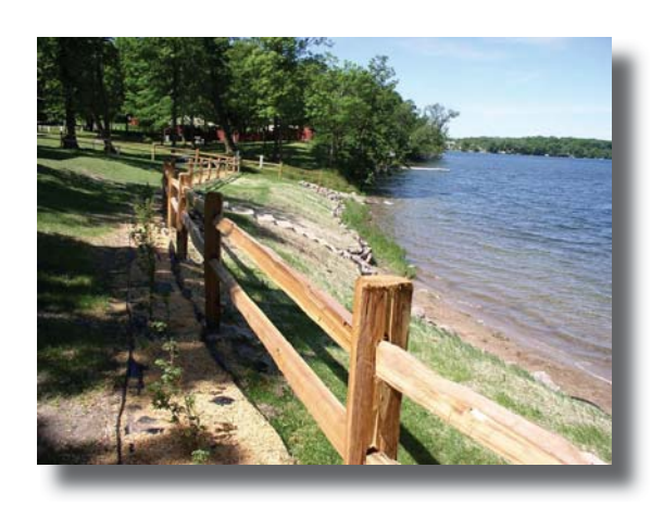
Shoreline erosion treatment completed, bioengineering used, native grasses and shrubs planted, erosion blanket, rock at toe of slope, fence to keep public off steep bank, and new steps to keep visitors off the bank and allow beach access.