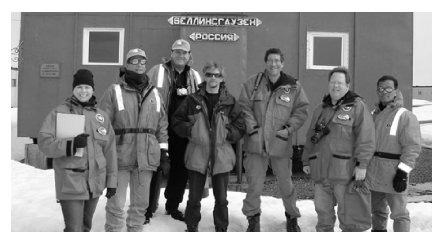
U.S. Team with Bellingshausen base commander