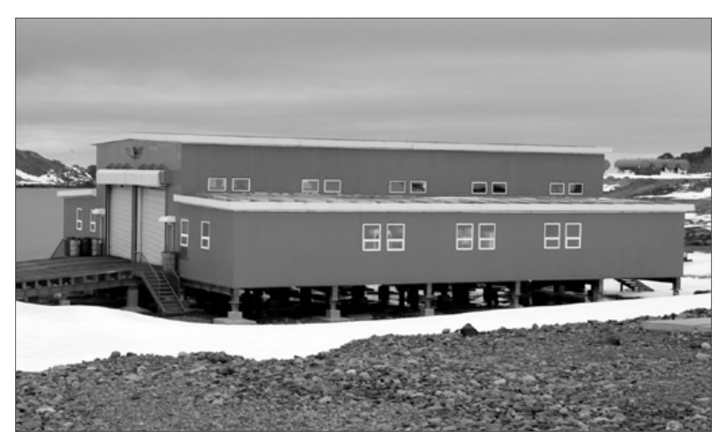
Great Wall Station, building and fuel tanks