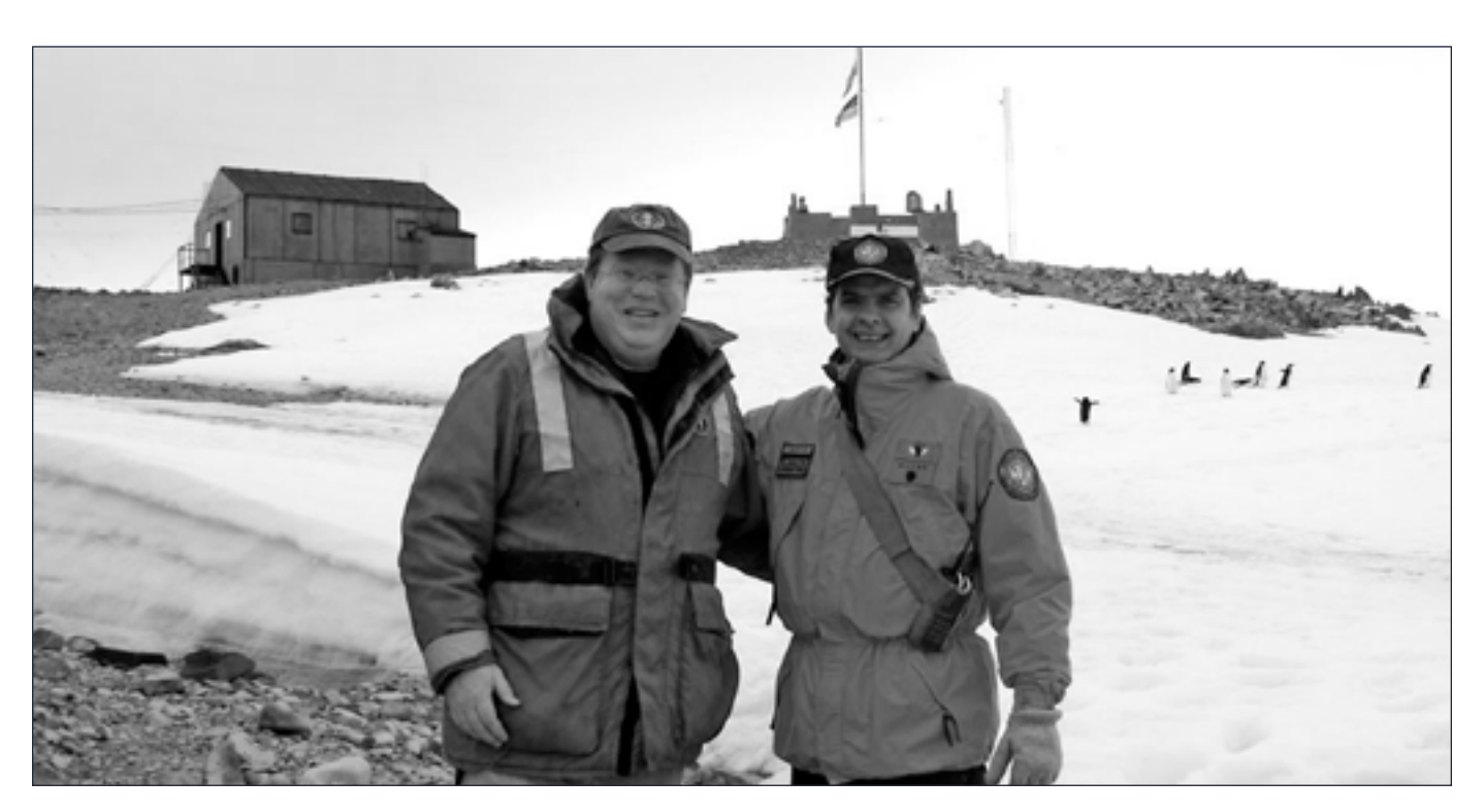
Esperanza Station, base commander and U.S. team leader

Environmental Impact Assessment. The base provided an environmental manual and a "practical guide" on environmental protection, which contain sections on EIA's, including discussion of the procedure for preparing CEE's and IEE's. Base personnel stated that DNA required authorization prior to any new construction, and that DNA was diligent about environmental review. However, it did not appear that base personnel were familiar with the EIA requirements. For example, base personnel were not aware whether a CEE or IEE had been prepared prior to the construction of the sewage treatment plant in 2000. In addition, base personnel did not know whether an IEE had been prepared