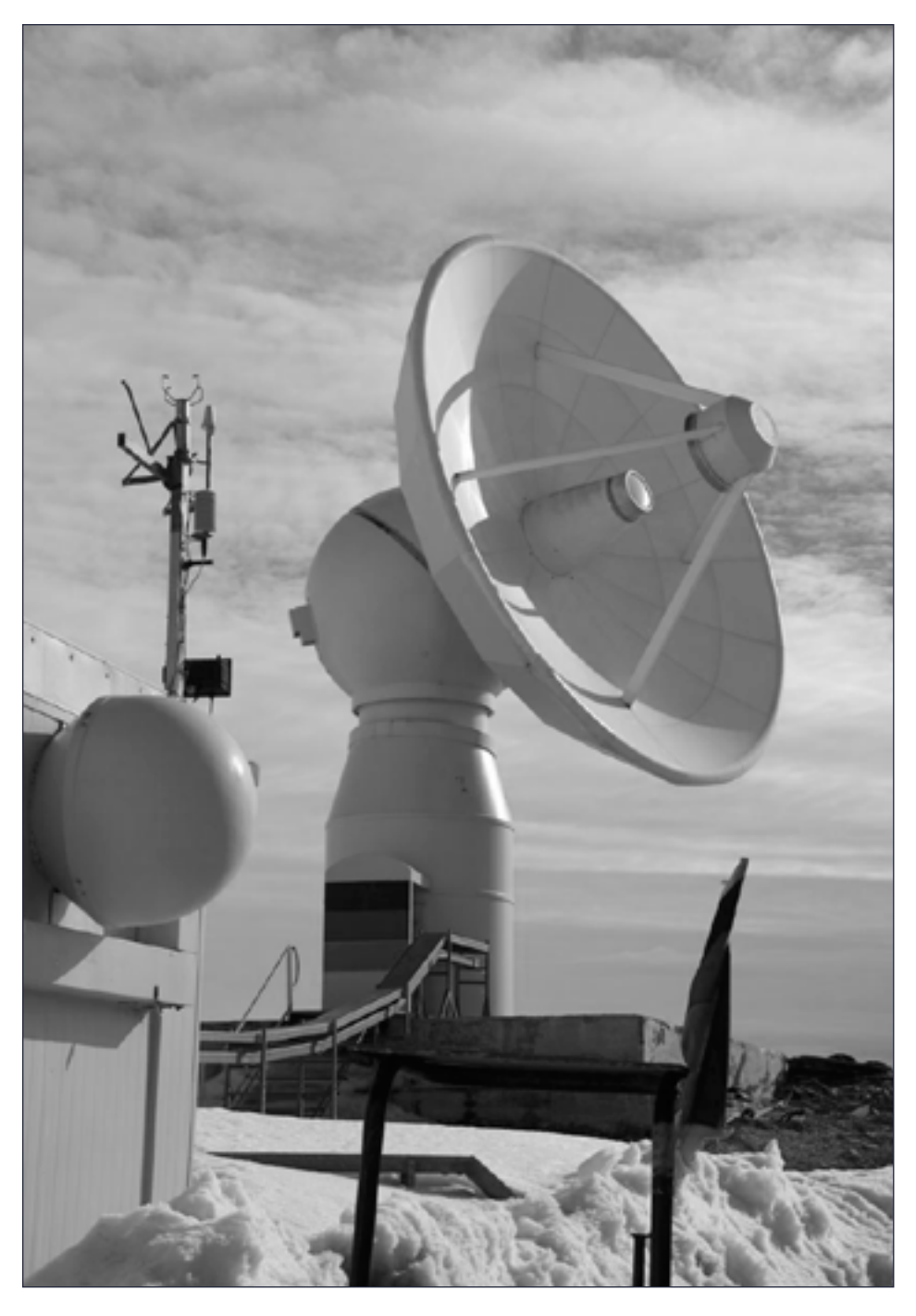
German Antarctic Receiving Station satellite dish