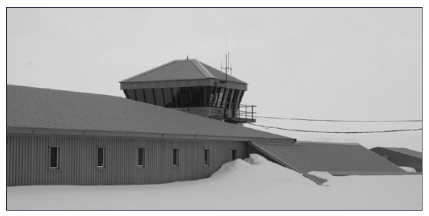
Rothera Station, Bransfield House

Rothera has a 900 m long and 45 m wide crushed rock gravel runway. Additionally, Rothera also has available to it a secondary runway on a nearby glacier. The snow runway is used for ski-equipped aircraft operations if the primary runway is out of service. Rothera operates one Dash 7 (DHC-7) and 4 Twin Otters (DHC-6). The aircraft are used to transport personnel and supplies to and from Rothera, and to conduct airborne science. The aircraft are also used to supply and support work at various sites in Antarctica. Rothera has no rotary wing aircraft. Air operations occur only in