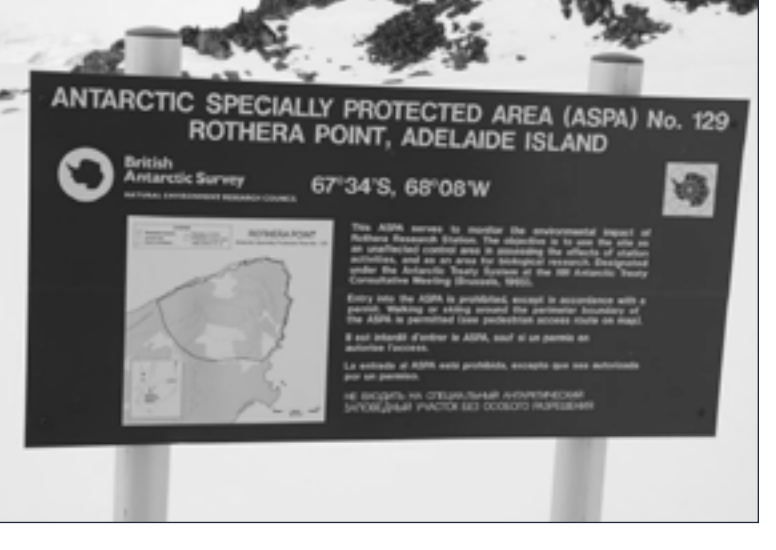
Rothera Point ASPA sign

bility for implementing the procedures in the Handbook. The Handbook is maintained by BAS and is reviewed and updated annually. Station personnel receive training in waste management before deployment to the Antarctic Treaty Area. The training is provided by BAS through a conference held in the UK. Once at Rothera, personnel receive additional training on the station's requirements