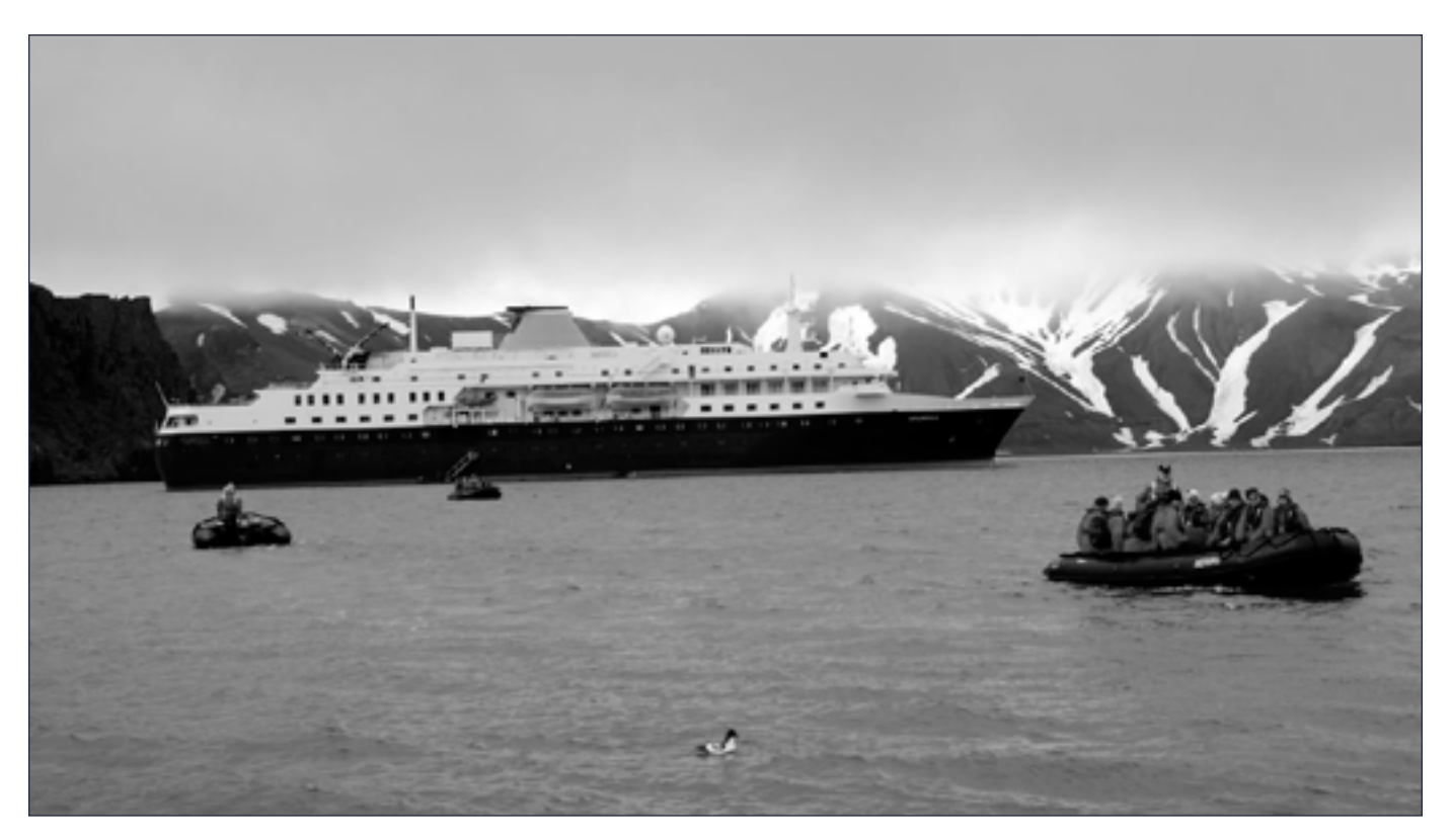
Explorer II, Deception Island