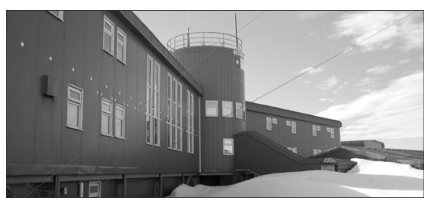
O'Higgins Chilean Station, new main building

The base's fuel is delivered once per year and off-loaded to the tanks through hoses and surface pipe. Fuel (benzene (gasoline)) for the snow machines (Skidoos) is contained in a collapsible 5,000 l bladder. The base commander did not have any information or history of