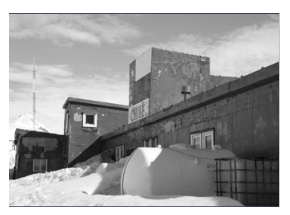
O'Higgins Chilean Station, old main building

Diesel fuel is stored in twelve outdoor storage tanks. There were three newer tanks containing 16,800 l each, eight older tanks containing 20,000 l each, and one older tank containing 21,000 l, for a total of 231,400 l. The newer tanks were well coated with paint but had no secondary containment. The paint on the older tanks was in need of re-coating. The older tanks did have secondary containment. It was reported that the