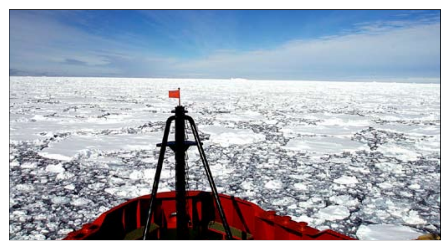
Bow of the Laurence M. Gould off Adelaide Island