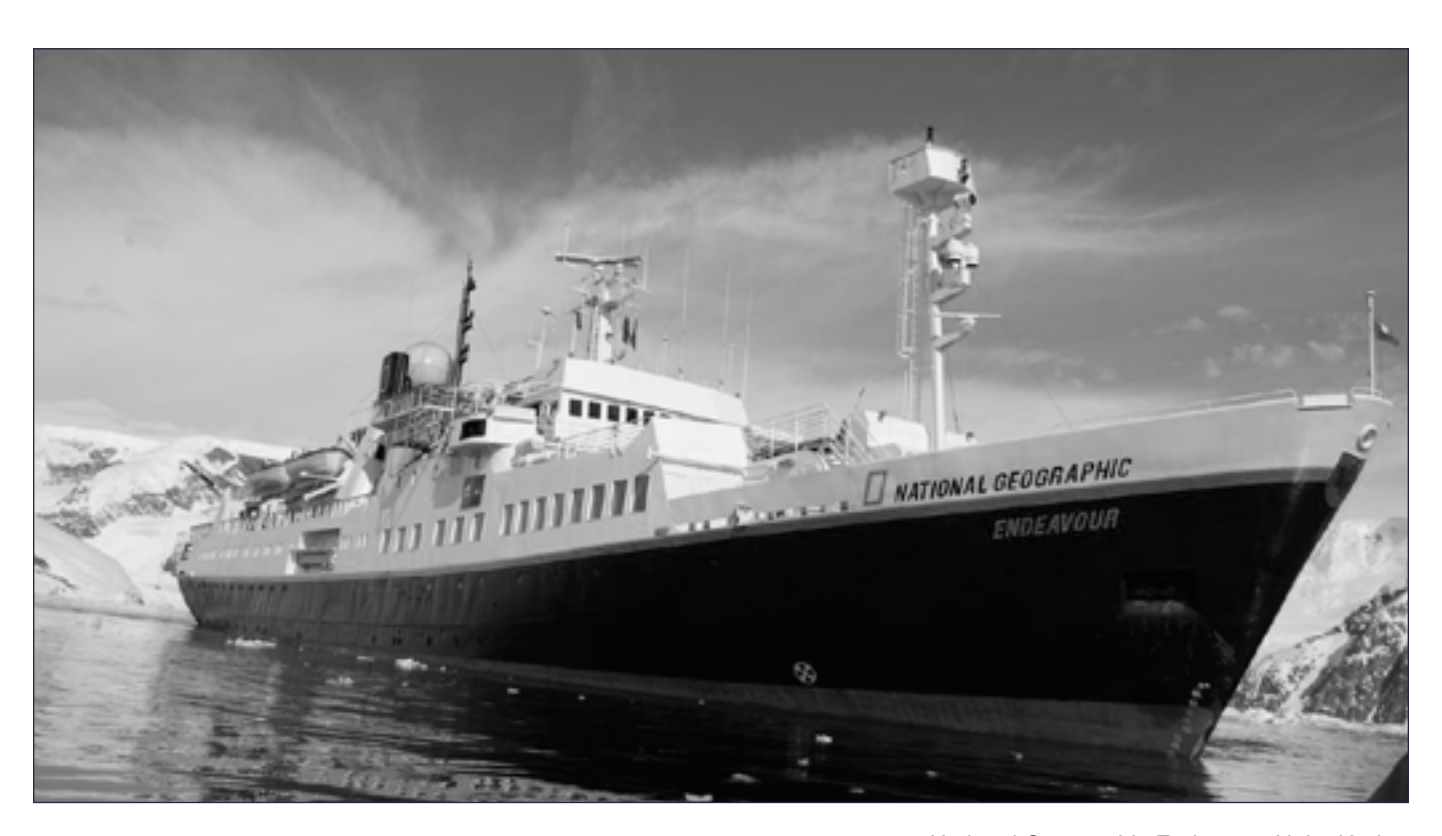
National Geographic Endeavor, Neko Harbor

The ship does not have or allow any polyvinyl chloride or polyurethane foam on board. The Inspection Team was informed that many of the supplies for the ship may be packed in polyurethane foam but that the products are unpacked and the foam packing material is returned to the supplier of the products before being loaded onto the ship.