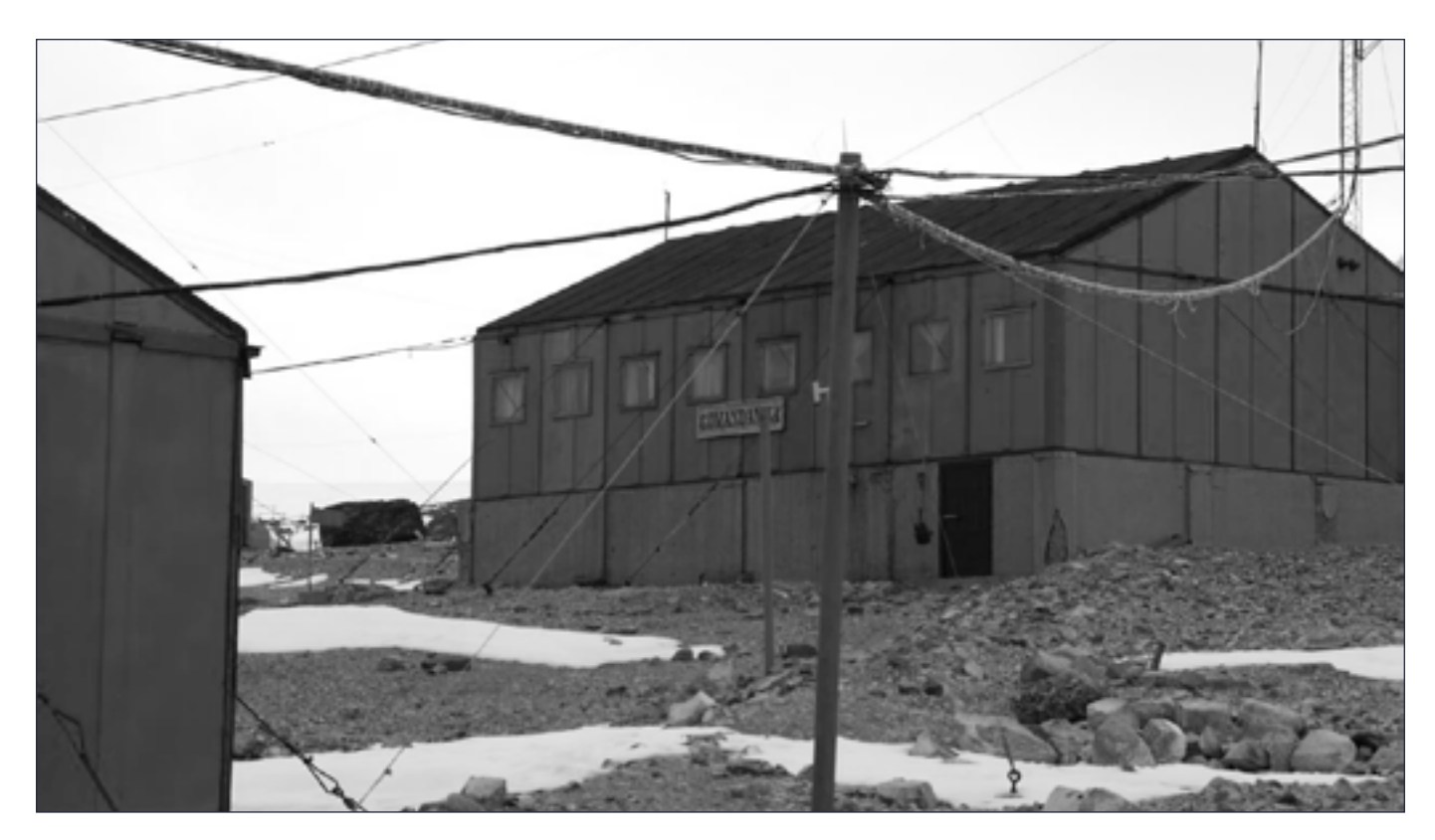
Esperanza Station, base commander's office

Additionally, supplies are also brought to Esperanza via Twin Otters (DHC-6) operating at the glacier airfield nearby.