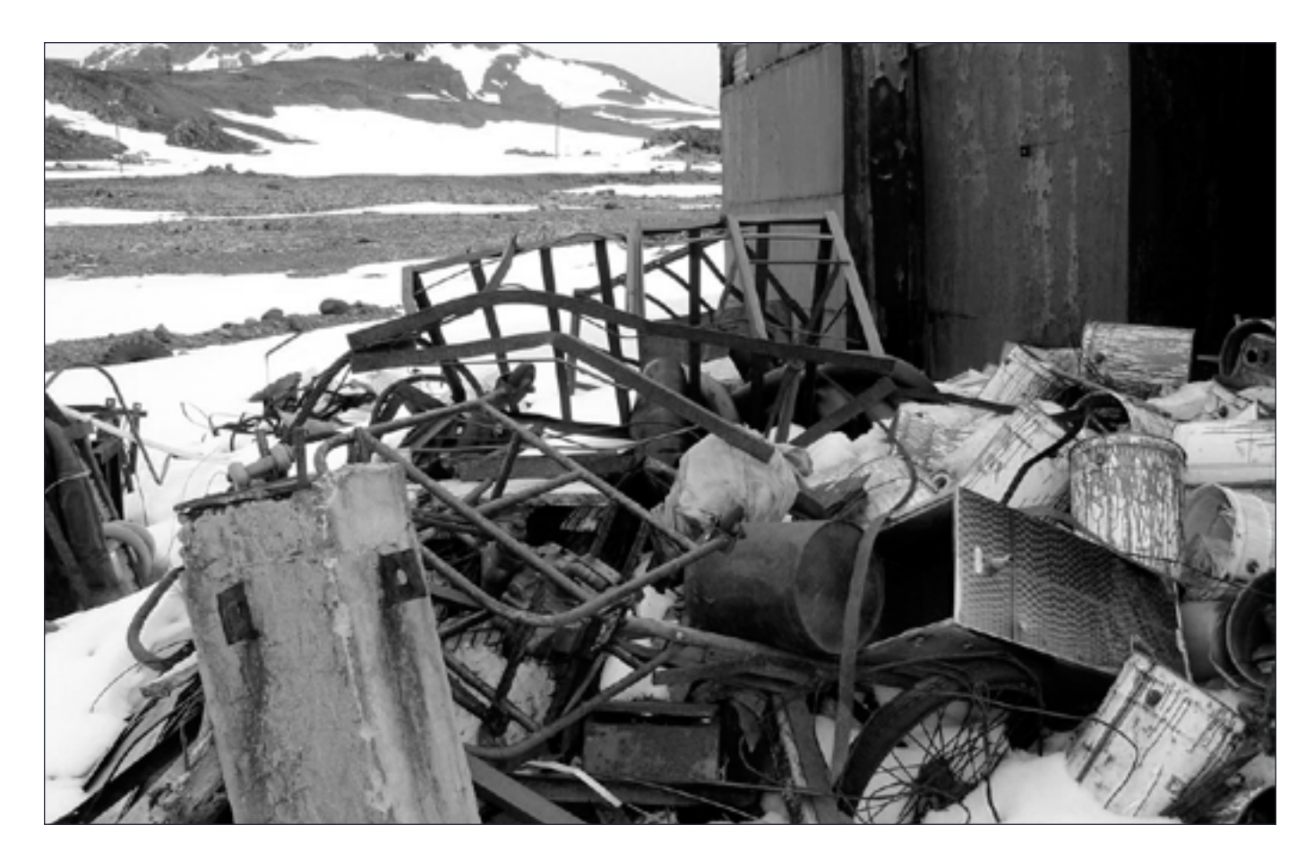
Great Wall Station, waste near building

tion should ensure that the waste is removed promptly in accordance with Annex III of the Environmental Protocol.