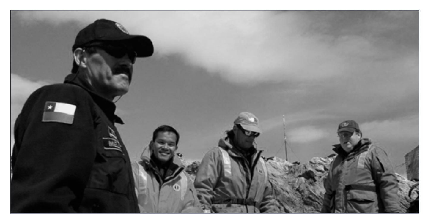
U.S. Team with O'Higgins officer

ATOM – particularly for the commonly available communications systems: e-mail, Inmarsat and Iridium. COMNAP could verify this information by annually attempting to call or e-mail each of the listed numbers. If no confirming reply is received, the respective COMNAP member should be notified with a request for an ATOM update. The COMNAP website, where the ATOM is posted, has now moved to a system of individually-named, password-protected entry. While the Team appreciates that information technology security is important, the result of this change is likely to be that myriad telecommunications operators at the various stations may not now be able to access the manual that was designed for them. The Team suggests that COMNAP consider a means of annually sending the ATOM, via e-mail, to each station that lists its e-mail address. Where a station does not list any e-mail, then COMNAP should send the ATOM to the respective member with a request to forward to the appropriate station. Finally, all stations should consider having Iridium, which is simple to operate.