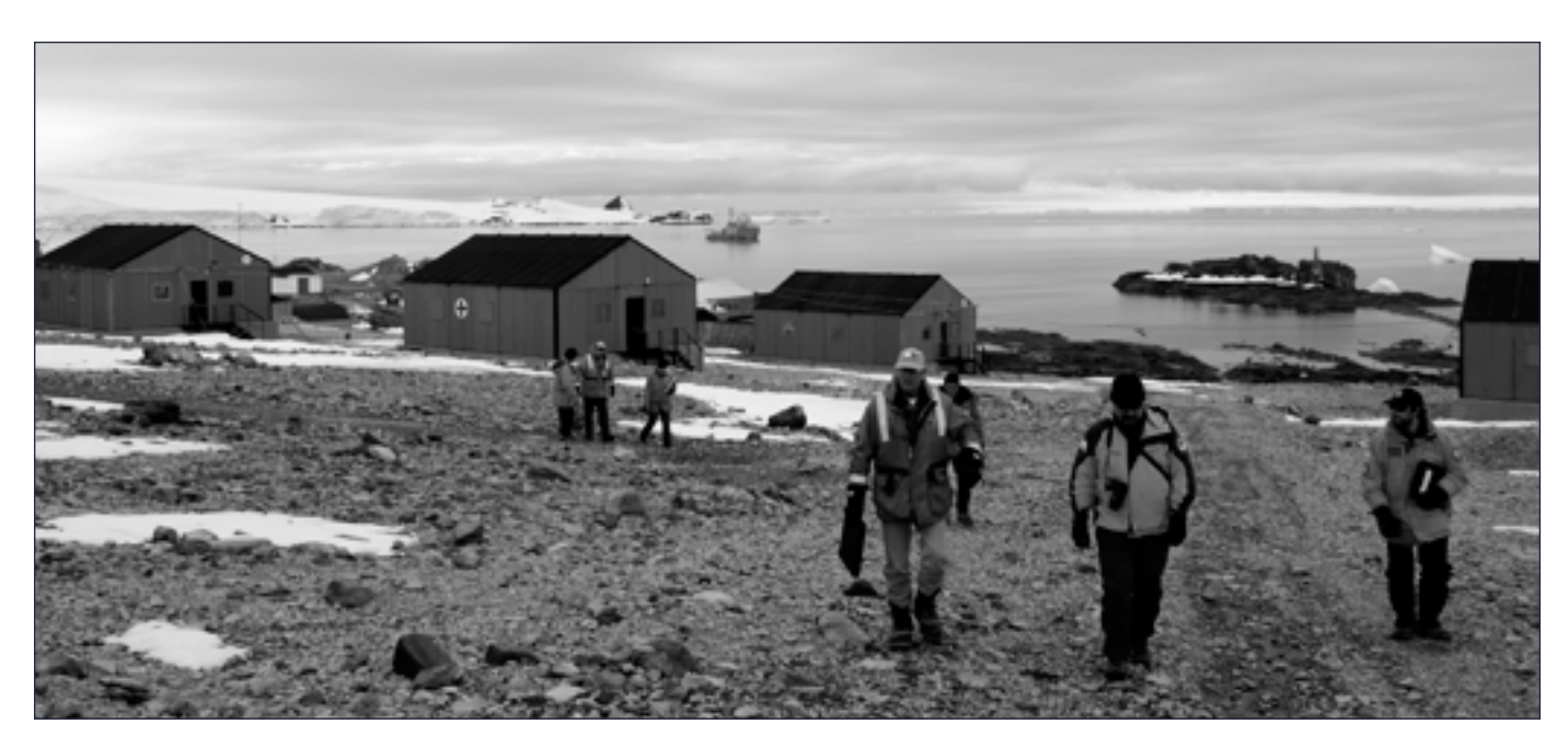
Team walking at Esperanza Base