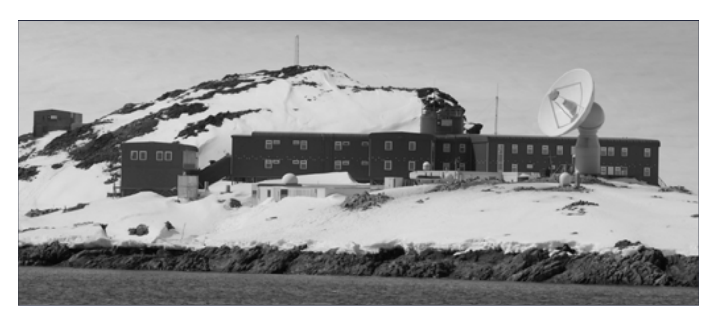
Chile's O'Higgins Base and German Antarctic Research Station from the sea