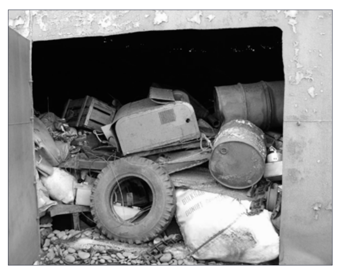
Bellingshausen Station, fuel tank used for waste storage

Although the Team was informed that no landfill disposal techniques are currently employed at the station, the Inspection Team observed the use of abandoned bulk oil storage tanks as a deposit for a very significant amount of many different types of waste all mixed together. The tanks are located approximately 2 km from the main facility. In the same area, barrels containing oily substances were leaking into the snow. There were also discarded vehicles in the area. The station manager had indicated that some waste materials were being housed in this area that would be taken out of the Treaty Area this year. However, the material observed had not been packaged for shipment, and instead was in a disorganized state.