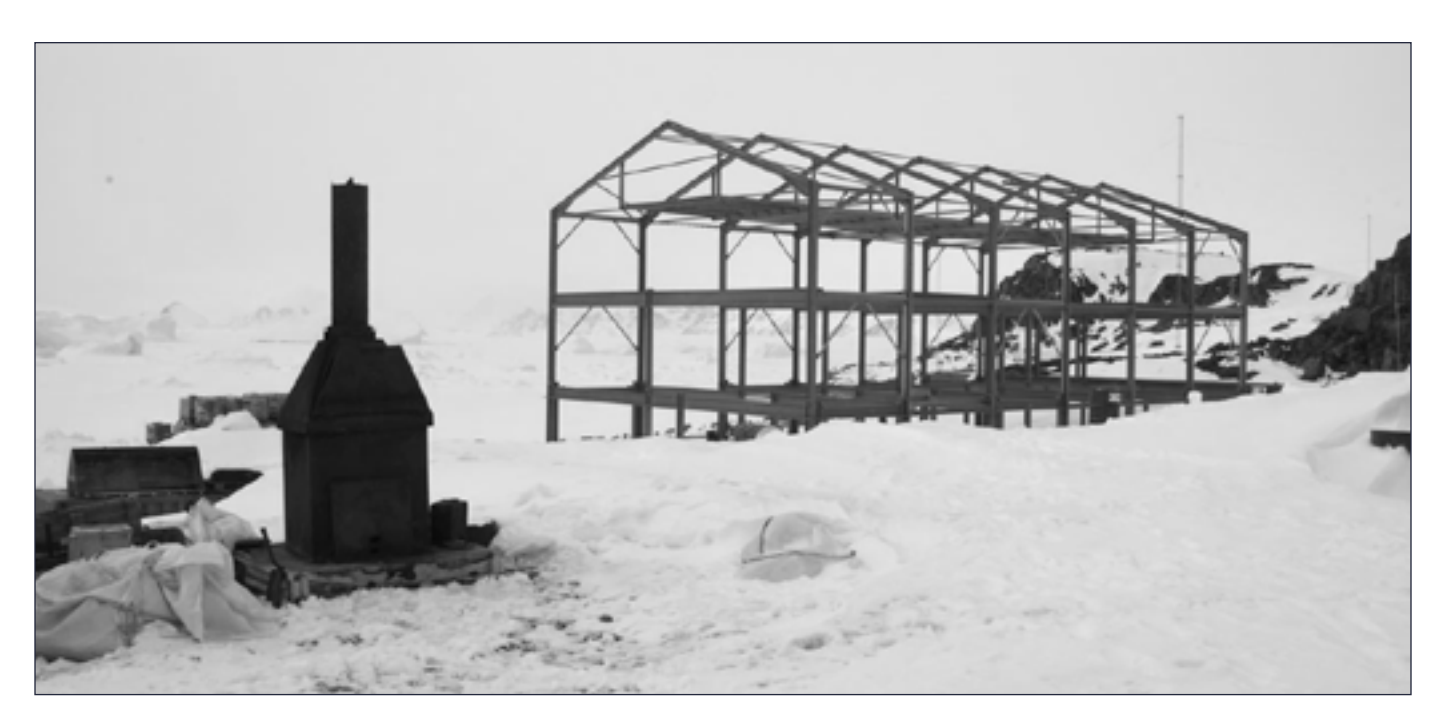
Rothera Station, construction of New Bransfield House and incinerator

Rothera reported one accidental incursion into the ASPA during the summer of 2005-06, which was duly reported through BAS channels. Another marker was added after this accidental incursion.