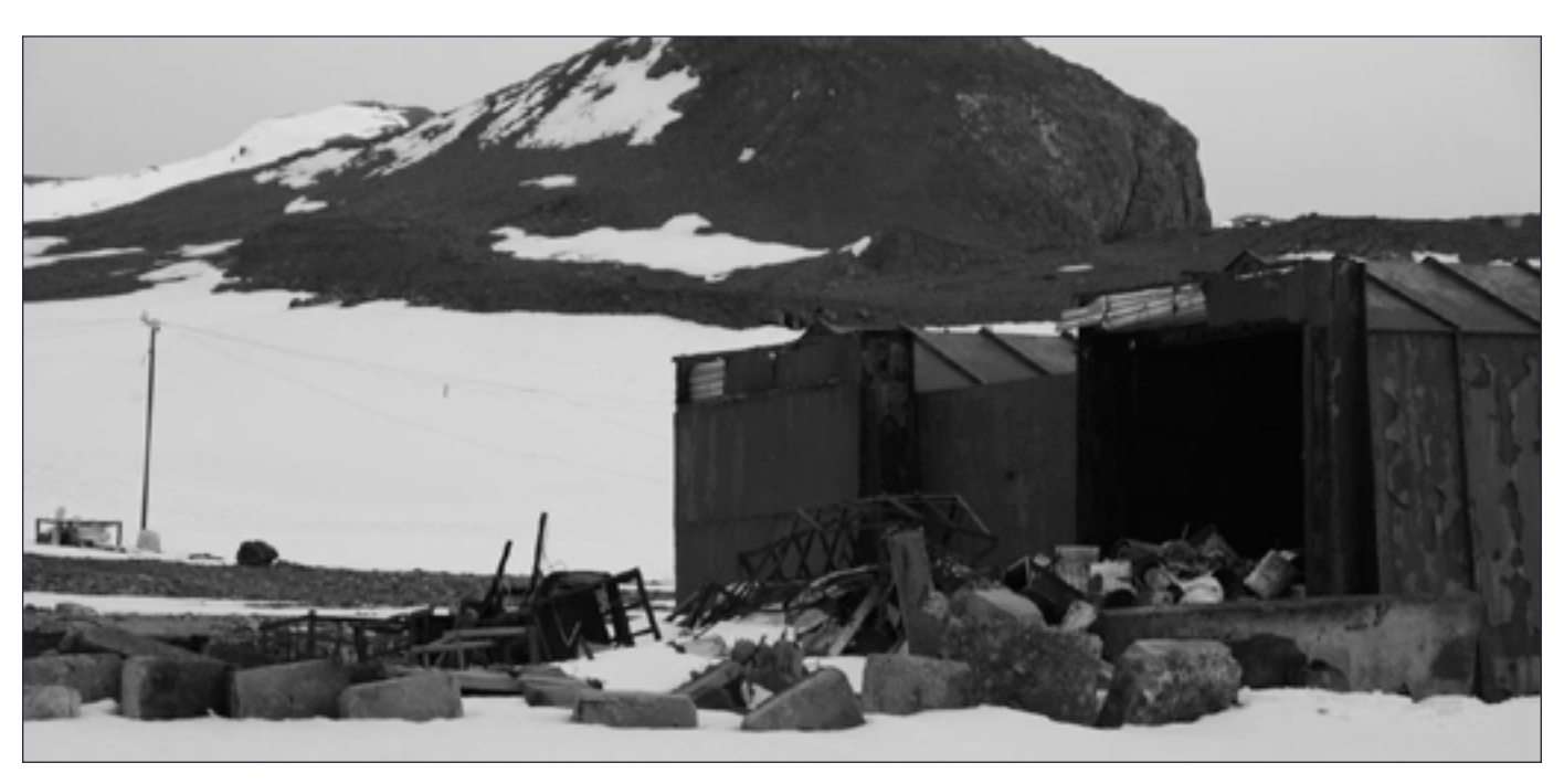
Great Wall Station, building

As mentioned above, the Inspection Team observed an older building described as the old vehicle garage, in a state of disrepair. This building is used to store haphazardly many large containers (approximately 4 to 5 gallons in size) of paints, degreasers, and oil. At the back of building, there is a pile of waste material, including broken pieces of PVC pipe, scrap metal and old concrete building supports. Many of the liquid containers are in poor condition and there was evidence of leaks and spills. The Team was informed by the station manager that these wastes would be removed out of the Treaty Area by December 2007. The Inspection Team recommends that waste material of this sort be better organized, separated by category and processed for shipment out of the Treaty Area, and that the Sta-