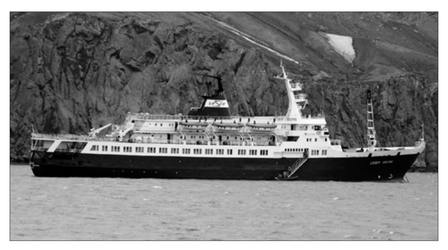
Lyubov Orlova, Deception Island