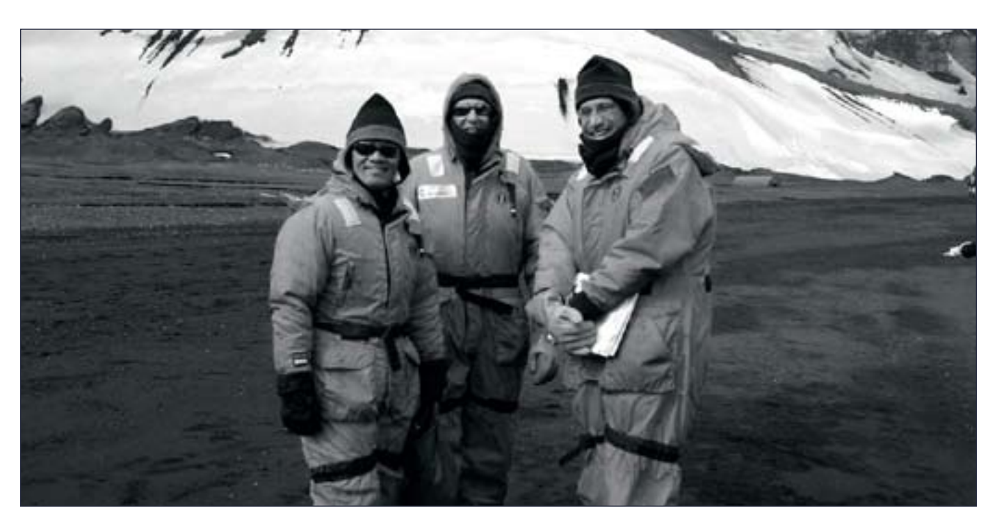
U.S. Team members observing passenger landing by Lyubov Orlova, Deception Island

All staff members appeared knowledgeable about the site and aware of the Management Plan for the Deception Island ASMA and the ASPAs in the vicinity of Whalers Bay. After each Zodiac reached the landing site, passengers were again briefed on the landing site before walking ashore. Passengers were divided into English-speakers, German-speakers, and Spanish-speakers to ensure everyone understood the code of conduct for the site, distance to maintain from wildlife, historic artifacts on the beach, and the extent of area open to them. •