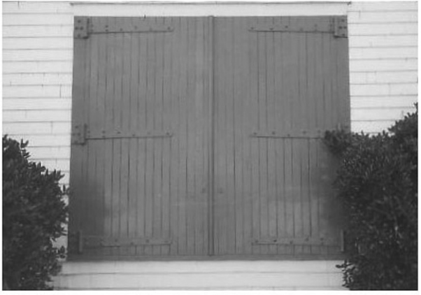
History figure 11. Photograph of beach apparatus door with detail, taken in 1978 shortly before its removal. [49]