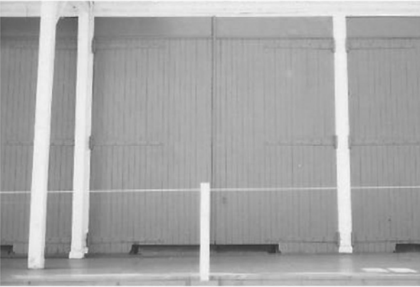
History figure 10. Photograph of main boat doors with detail, taken in 1978 shortly before their removal. [48]