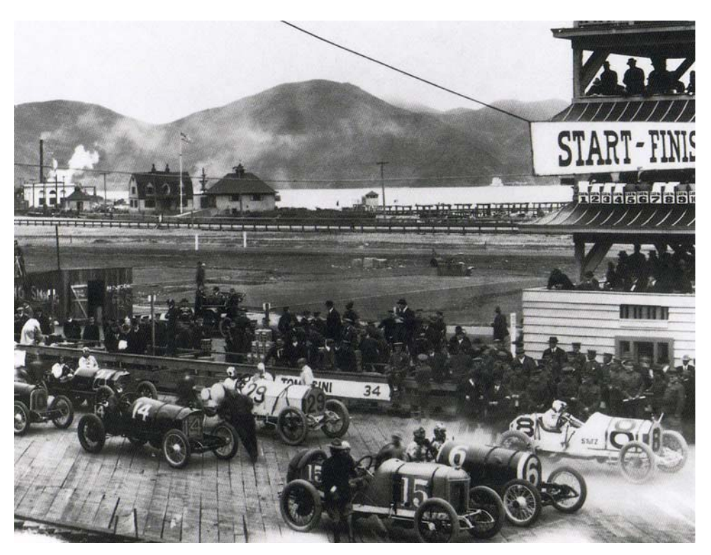
History figure 5. Photograph of start of Grand Prix on February 27, 1915. Fort Point Coast Guard Station in its new location is visible in background. The new boathouse has not yet been built. The exposition incinerator is just visible in the upper left corner. [29]