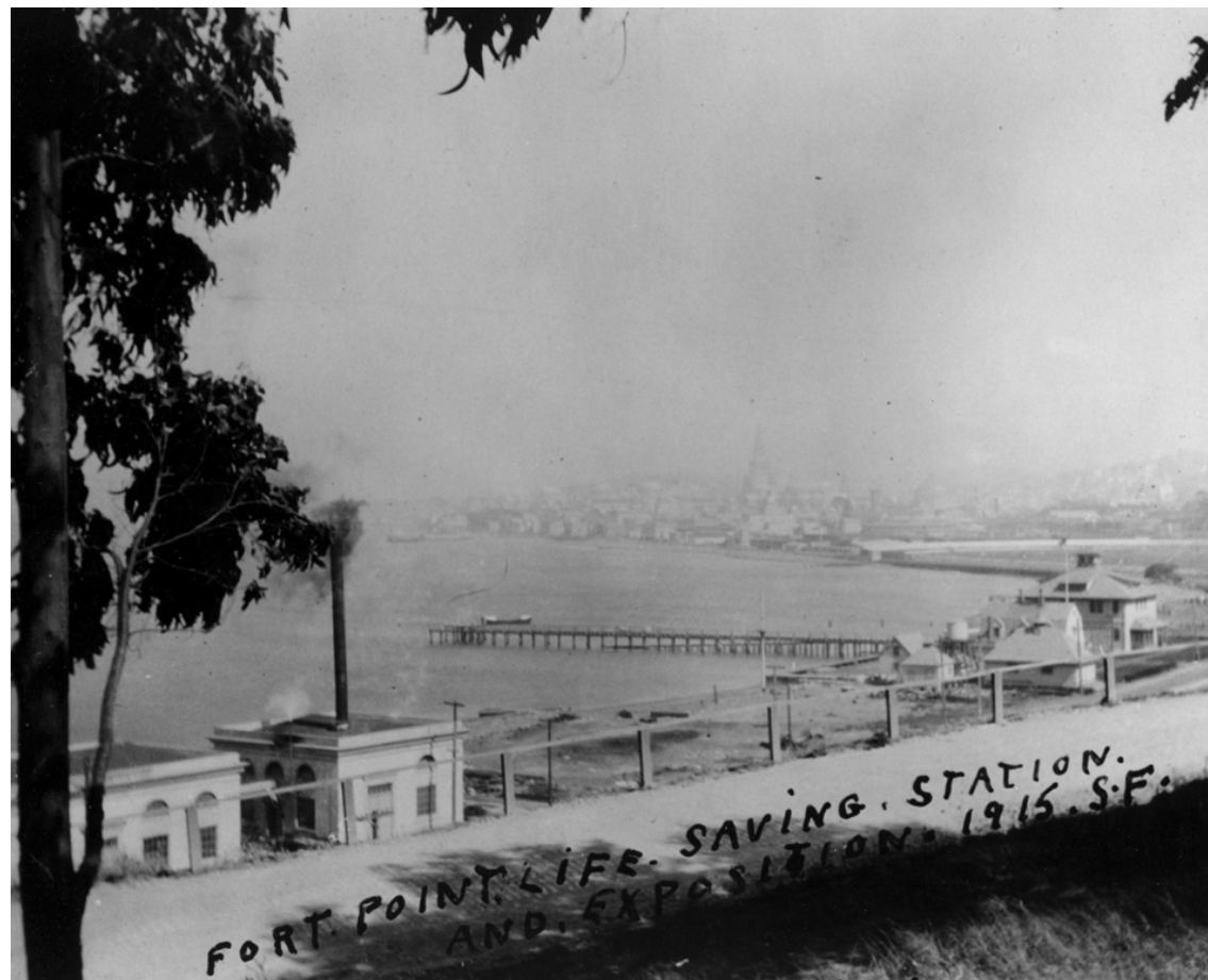
History figure 6. Photograph of Fort Point Coast Guard Station from late 1915. The new boathouse (bldg. PE 1903) is visible in background. This is the earliest known image of the new boathouse. Old boathouse (bldg. PE 1902) has been moved to present location and converted to a garage. Exposition garbage incinerator visible in left foreground. [30]