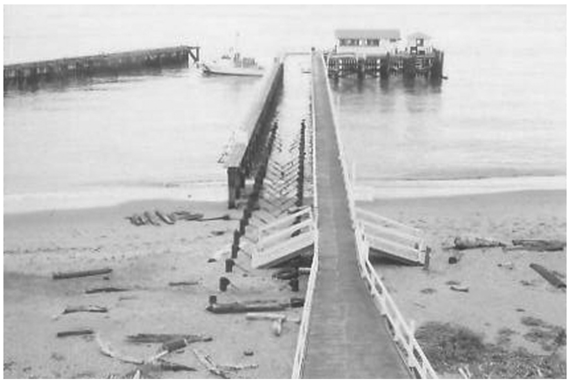
History figure 9. Photograph of deteriorated marine railway in 1978 shortly before its complete demolition. [45]

The marine railway has not been used for over 15 years. It is in an advanced state of deterioration. All that is left of the railway itself are the pile bents. Only the easterly catwalk, which is in fair condition, is still required as access to the search and rescue boat dock. [44]