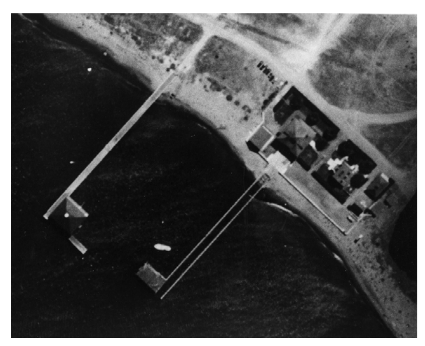
History figure 7. Aerial photograph from about 1938. This view corresponds closely with the site plan drawn up that year. Note that old boathouse (PE 1902) has not yet been aligned with buildings PE 1901 and PE 1903. Maintenance shop (PE 1907) at head of marine railway shows original north-south orientation of roof. [34]

The interbellum was a relatively stable period for the Fort Point Coast Guard Station. Following its reconstruction in 1915 at the present location, only minor changes were made to the facility until after World War II. Sometime between 1924 and 1926 the hen house and water tower were removed. By 1926 a basic landscaping scheme was also introduced, the rudiments of which still survive. This included a grass lawn surrounding the Boathouse and the O-in-C Quarters, a cypress hedge along Marina Drive, and a row of palm trees just inside this hedge (the palm trees can be seen in photographs from as early as 1922). The most significant structural changes occurred sometime between 1932 and 1935, when the front porch of the Boathouse was enclosed. The O-in-C Quarters were probably modified at this time as well. A detailed site plan made in 1938 indicates that the old kitchen has finally been removed and the building remodeled according to the plan proposed by Andre Fourchy in 1914. [35] The center rear dormer was also extended so that it is flush with the outer wall of the shed below it. The 1938 plan shows a number of other modifications which occurred sometime between 1926 and 1938. During this period the wooden seawall was replaced with the present concrete wall. The flagpole was moved to the middle of the driveway in front of the O-in-C Quarters again (this is where it stood in 1915). And two small garages were added just west of the old boathouse.