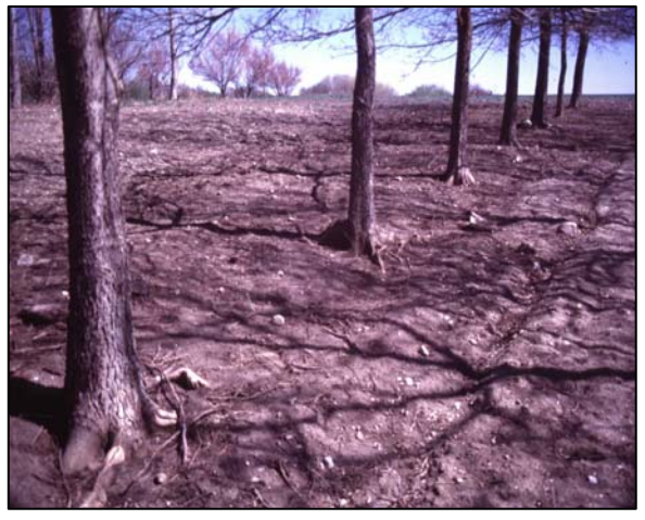
Tree roots can be damaged by tillage and erosion.