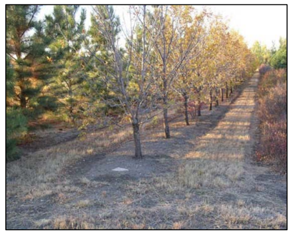
When fabric is not used, weed control can be handled by tillage (hand hoeing or rotary tree cultivation), mulch, or herbicides. Glyphosate works well when trees are larger and not as sensitive to herbicide drift.