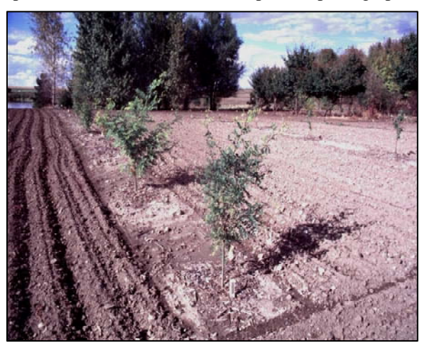
Frequent tillage may cause soil erosion.

Fabric Mulch Plantings: Seeding warm-season grass between the fabric strips soon after tree planting is desirable to prevent weed competition, especially from invasive species such as Canada thistle and wormwood. Tillage is also an option, but care must be taken to prevent pulling up the edges of the fabric.