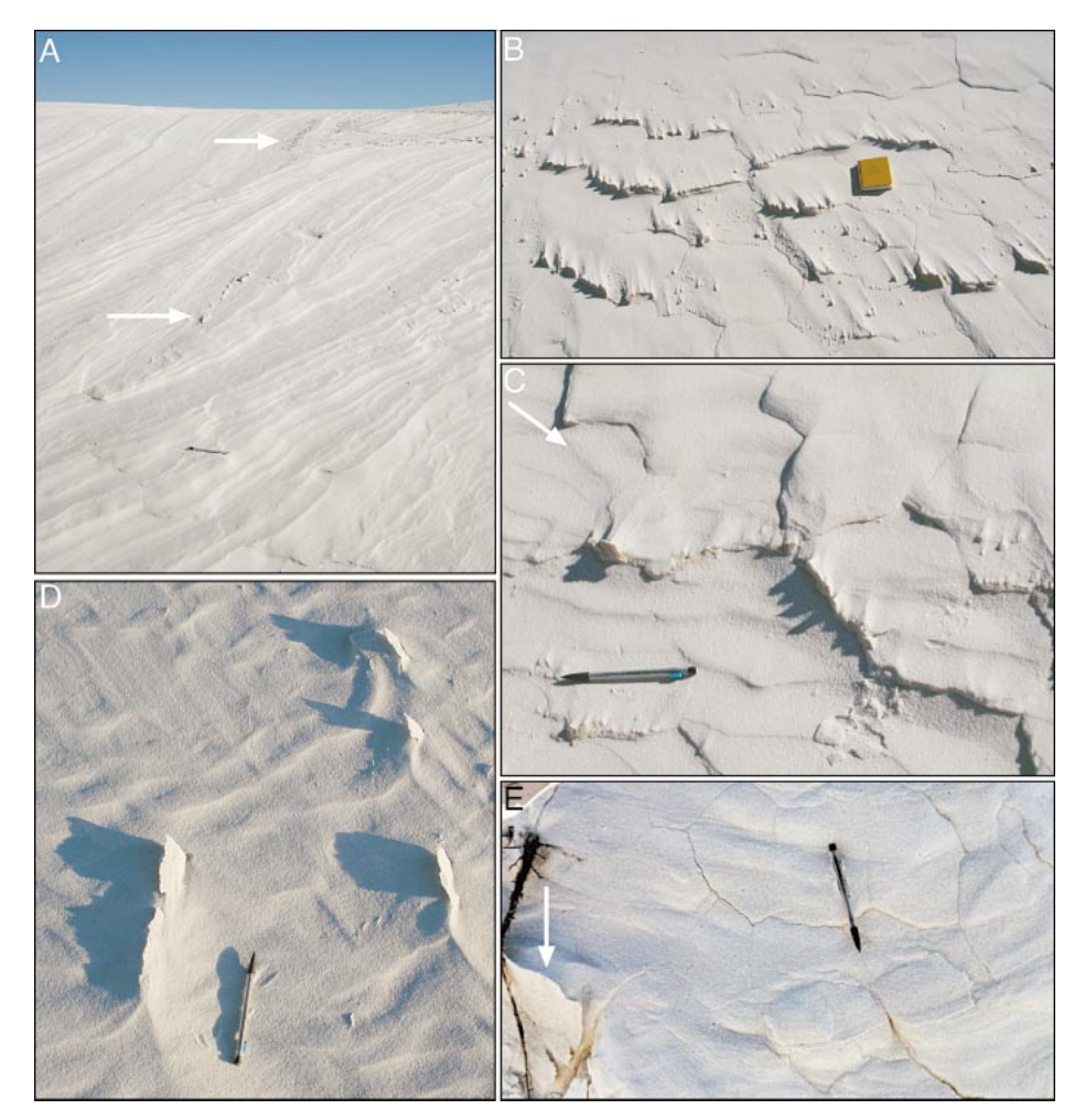
Figure 2. Images from White Sands National Monument. A: Cross-stratification on stoss side of dune. Fins grew on high-relief laminae (arrows). Pen for scale. B: Cracks and tan fins in dune sand. Wind shadows demonstrate that fins face upwind. C: Cracks and tan fins that stand millimeters above sand and are very thin. Arrow indicates depositional laminae. D: White fins along cracks buried in loose sand. E: Cracks on all exposed surfaces of erosional pedestal. Cracks crosscut laminae. Cemented surfaces similar to white fins project out from sand (arrow).

tional Monument, New Mexico, which provides a prime analog site to Meridiani Planum outcrops. White Sands contains sulfate dunes deposited in evaporitic and eolian environments similar to those interpreted for Meridiani Planum outcrops. Constraints on processes forming cracks and fins at White Sands provide insights into processes that may produce similar features on Mars.