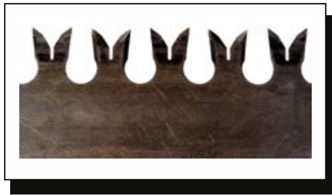
Figure 3—The M tooth pattern on a modern Tuatahi Homesteader crosscut saw.

Vintage peg-and-raker saws were field tested alongside the Homesteader M tooth saw across the country. Experienced, certified crosscut saw sawyers used both saws to cut a variety of trees.