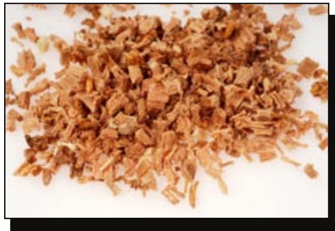
Figure 4—Wood shavings from the Tuatahi crosscut saw are short.

The Homesteader is thicker and heavier than vintage peg-and-raker saws of the same length. While the weight of the