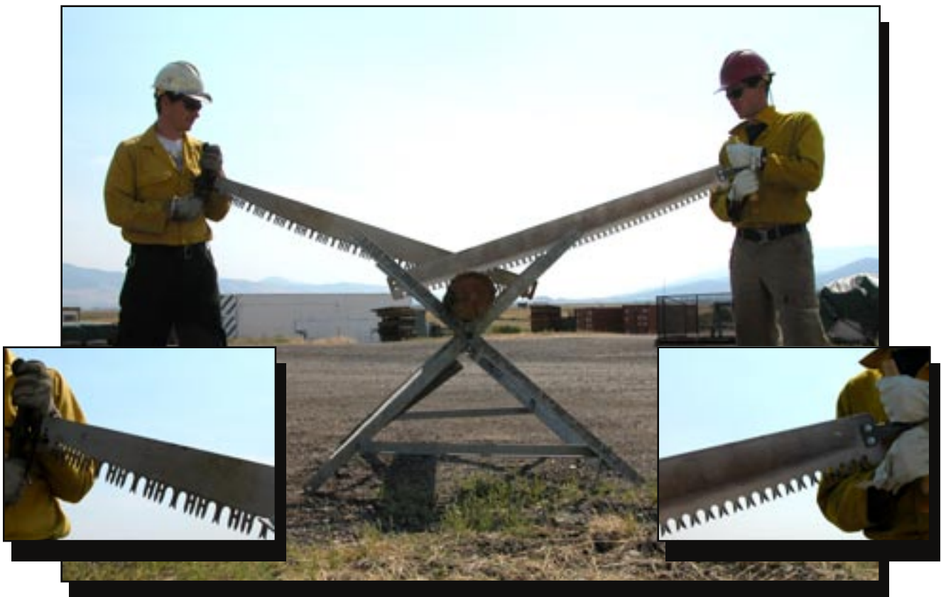
Figure 1—A vintage perforated-lance tooth, peg-and-raker crosscut saw (left) and the M tooth Tuatahi Homesteader saw (right) were field tested on forests across the country.

The blade of flat-ground saws (such as the Homesteader) is just as thick at the back of the saw as at the teeth. This feature makes flat-ground saws more susceptible to binding than tapered saws, which have a blade that is thinner at the back than