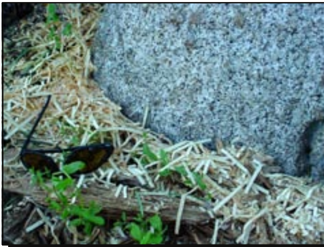
Figure 5—The shavings from a peg-and-raker crosscut saw are much longer.

Homesteader saw is a drawback for crews who carry their saws to the jobsite, the added weight and the thickness of its blade enables the Homesteader to make nice, straight cuts. The M tooth design allowed sawyers to start their cuts easily. The stiffness made the Homesteader a good one-person bucking saw. The saw's stiffness and the ease of starting a cut with the Homesteader make it an excellent training saw for new sawyers.