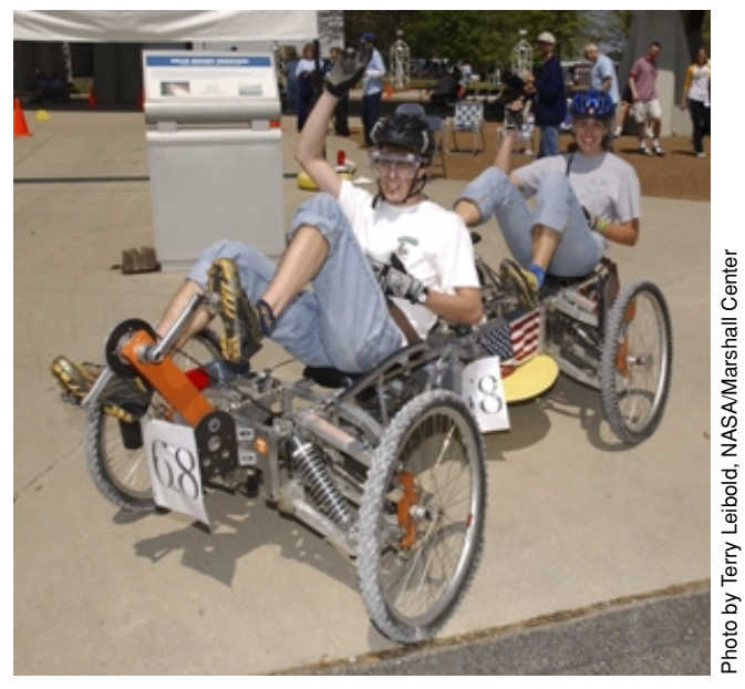
Second place University of Tennessee Team No. 1 from Knoxville comes in second place in the college division.

North Dakota State University Team No. 1, from Fargo, pedals to win first place in the college division of the 10th annual Great Moonbuggy Race.