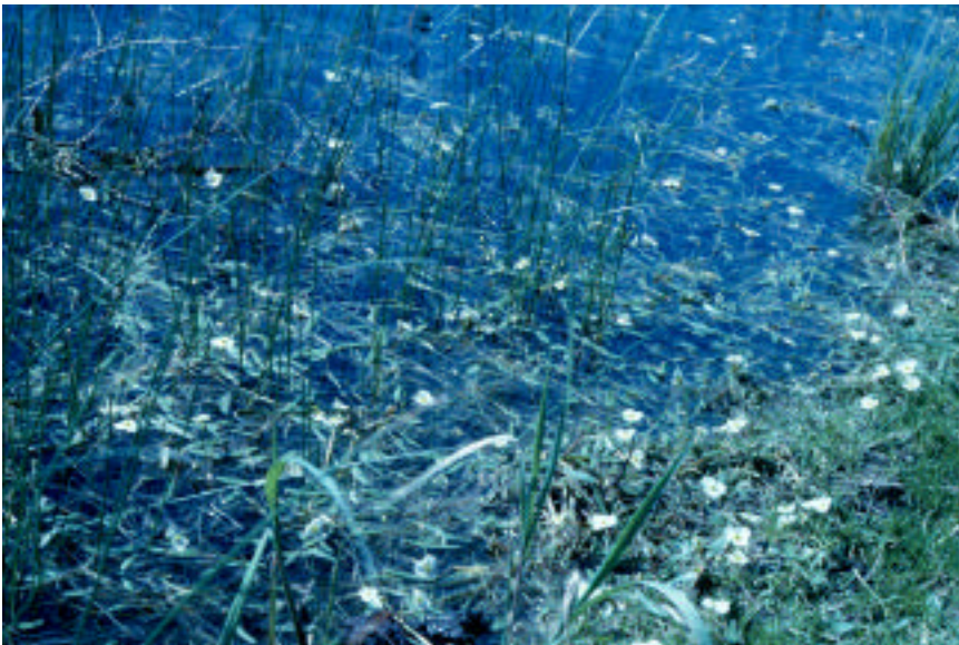
Habitat of Machaerocarpus californicus