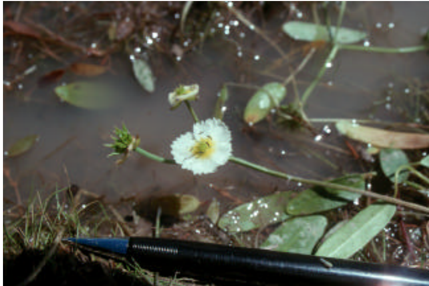
Closeup of Machaerocarpus californicus