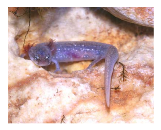
Figure D.1. Barton Springs Salamander