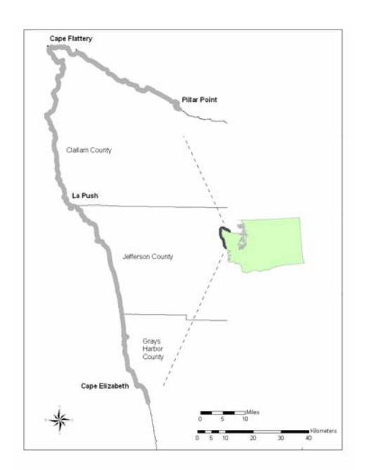
Figure 1. Approximate distribution of Washington sea otter stock.

The northern sea otter, Enhydra lutris kenyoni, historically ranged throughout the North Pacific, from Asia along the Aleutian Islands, originally as far north as the Pribilof Islands and in the eastern Pacific Ocean from the Alaska Peninsula south along the coast to Oregon (Wilson et al. 1991). In Washington, areas of sea otter concentration were reported from the Columbia River to along the Olympic Peninsula coast (Scheffer 1940). Sea otters were extirpated from most of their range during the 1700s and 1800s as the species was exploited for its fur. Washington's sea otter population was extirpated by the early 1900s. In 1969 and 1970, a total of 59 sea otters were captured at Amchitka Island, Alaska, and released near Point Grenville and LaPush off Washington's Olympic Peninsula coast (Jameson et al. 1982; Jameson et al. Washington's current sea otter population originated from the Amchitka Island genotype (Enhydra lutris kenyoni).