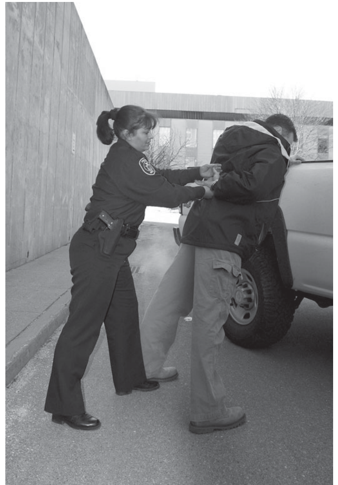
Police officers take every precaution during the apprehension of suspected criminals.

State police officers (sometimes called State troopers or highway patrol officers ) arrest criminals Statewide and patrol highways to enforce motor vehicle laws and regulations. Uniformed officers are best known for issuing traffic citations to motorists who violate the law. At the scene of accidents, they may direct traffic, give first aid, and call for emergency equipment. They