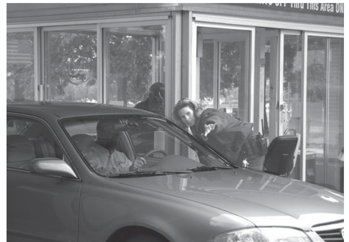
Security guards are often responsible for checking visitors at a main gate and directing them to their destination.

Gaming surveillance officers and gaming investigators act as security agents for casino managers and patrons. They observe casino operations for irregular activities, such as cheating or theft, by either employees or patrons. To do this, surveillance officers and investigators often monitor activities from a catwalk over one-way mirrors located above the casino floor. Many casinos use audio and video equipment, allowing surveillance officers and investigators to observe these same areas via monitors. Recordings are kept as a record and are sometimes used as evidence against alleged criminals in police investigations.