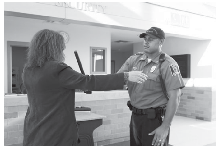
A correctional officer uses a metal-detecting wand to inspect a visitor before allowing the person into the facility.

Working in a correctional institution can be stressful and hazardous. Every year, a number of correctional officers are injured in confrontations with inmates. Correctional officers may work indoors or outdoors. Some correctional institutions are well lighted, temperature controlled, and ventilated, while others are old, overcrowded, hot, and noisy. Correctional officers usually work an 8-hour day, 5 days a week, on rotating shifts. Prison and jail security must be provided around the clock, which often means that officers work all hours of the day and night, week-