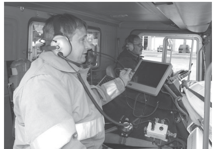
Firefighters use a variety of technologies to ensure prompt and effective responses to emergency situations.

Firefighters spend much of their time at fire stations, which usually have features common to a residential facility like a dormitory. When an alarm sounds, firefighters respond rapidly, regardless of the weather or hour. Firefighting involves risk of death or injury from sudden cave-ins of floors, toppling walls, traffic accidents when responding to calls, and exposure to flames and smoke. Firefighters may also come in contact with poisonous, flammable, or explosive gases and chemicals, as well as radioactive or other hazardous materials that may have im-