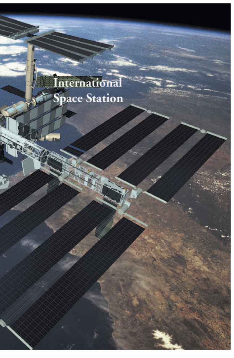
The International Space Station uses Qualtech's TEAMS multisignal modeling technology to analyze and manage its complex integrated system from one central computer.

"site profiles" listing the support equipment, personnel skill levels, and capabilities available at various maintenance sites. TEAMATE then generates optimized maintenance procedures for a particular maintenance site with the available resources and capabilities. After maintenance is complete, TEAMATE logs every action/result/time interval back to TEAMS-KB for record keeping, tracking, trending, and data mining applications. It is also applied in model management, scheduled and unscheduled maintenance, and technical data management.