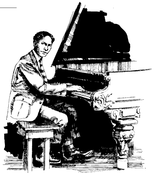
Jelly Roll Morton