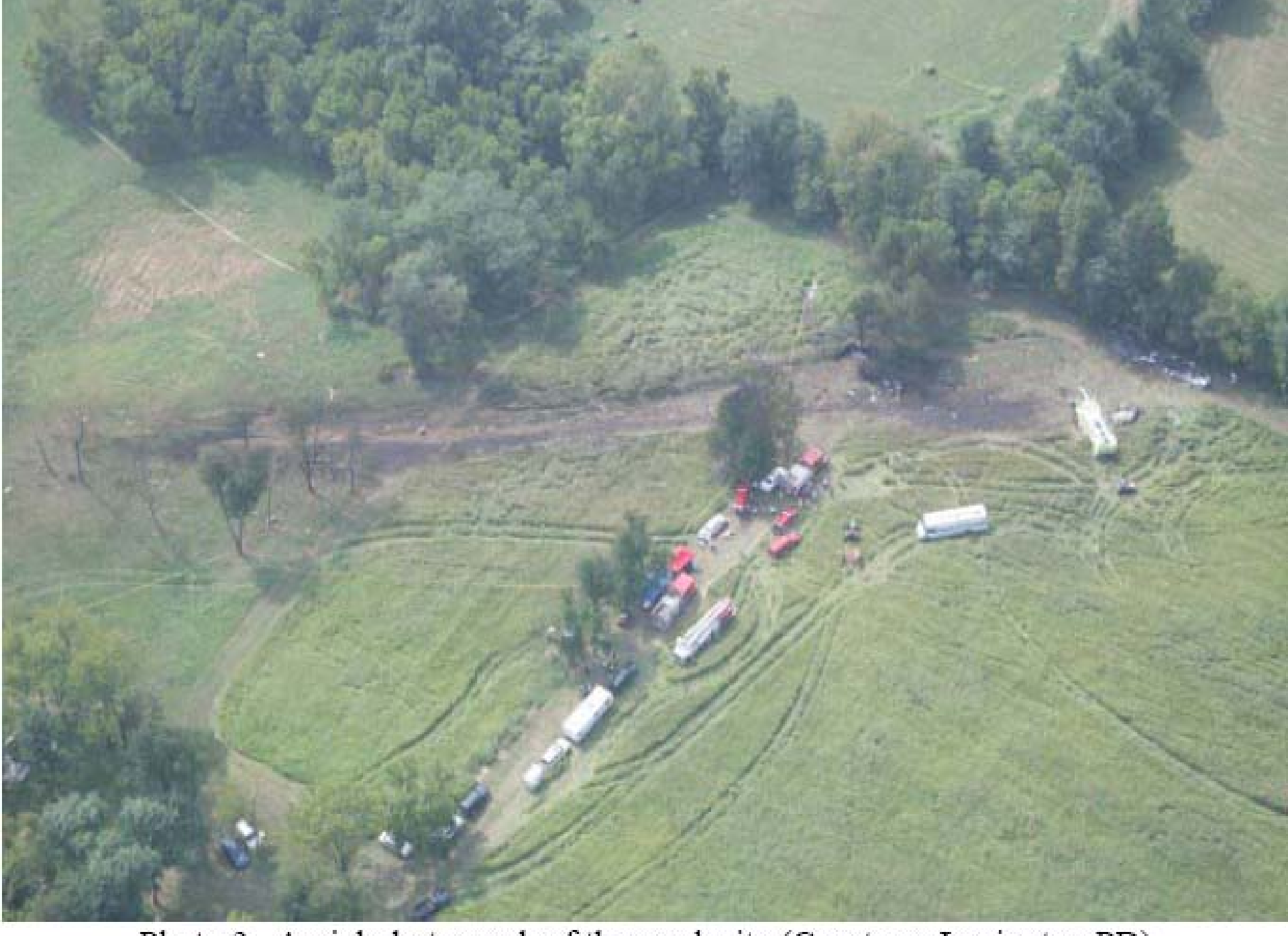
Photo 3. Aerial photograph of the crash site