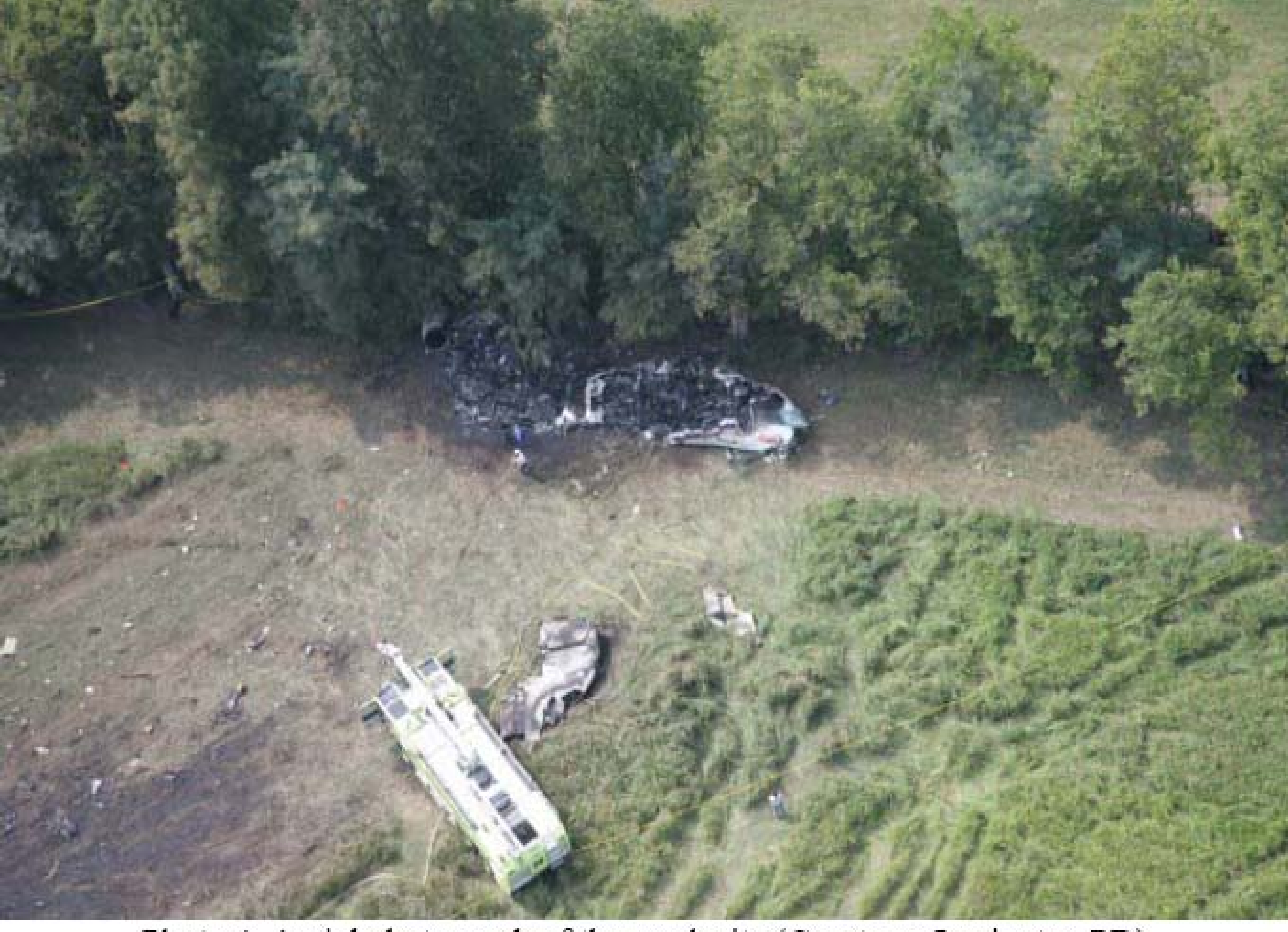
Photo 4. Aerial photograph of the crash site