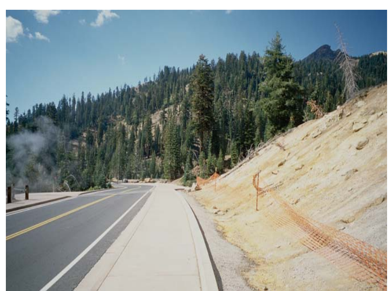
IMPROVED PEDESTRIAN ACCESS WITH NEW INTEGRAL COLORED SIDEWALK, VIEWING AREA AND CURB/GUTTER