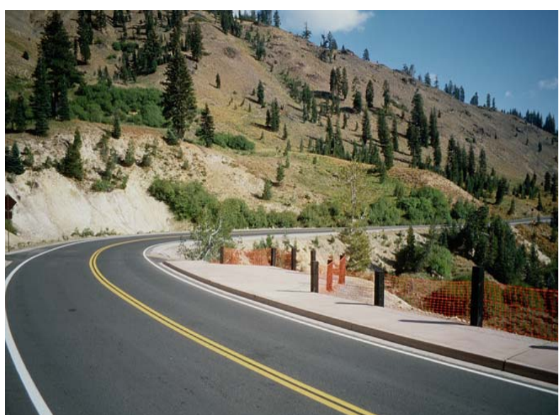
IMPROVED PEDESTRIAN ACCESS WITH NEW INTEGRAL COLORED SIDEWALK, VIEWING AREA AND CURB/GUTTER