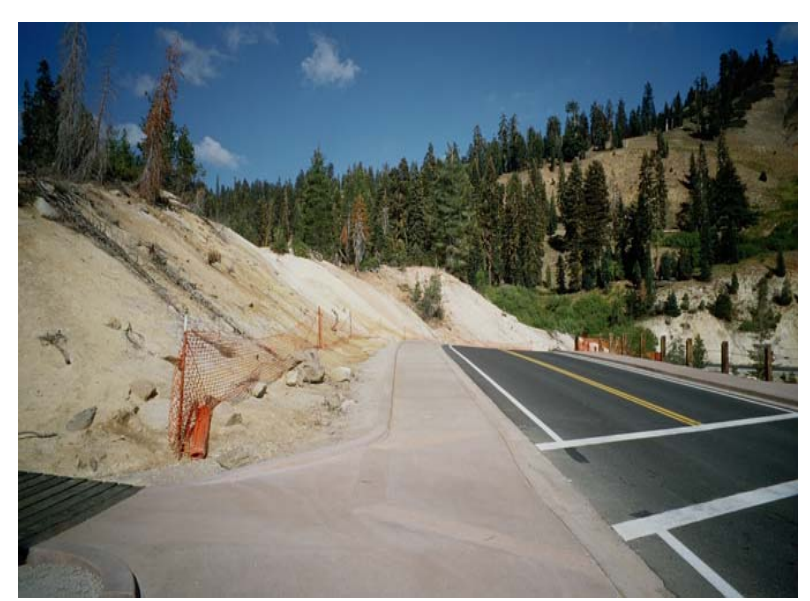
IMPROVED PEDESTRIAN ACCESS WITH NEW INTEGRAL COLORED SIDEWALK AND CURB/GUTTER