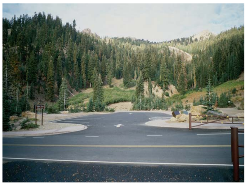
PARKING AREA ENTRANCE WITH NEW CONCRETE CURB/GUTTER AND SIDEWALK