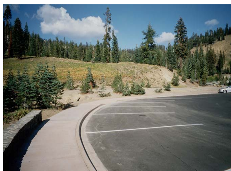
SULPHUR WORKS ROAD AND PARKING ISLAND OBLITERATION