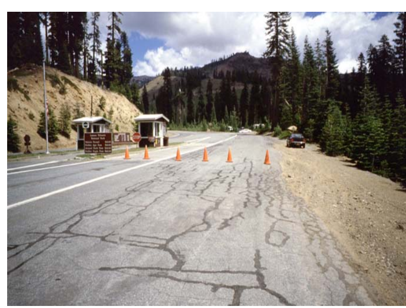
CRACKED AND DETERIORATED ASPHALT