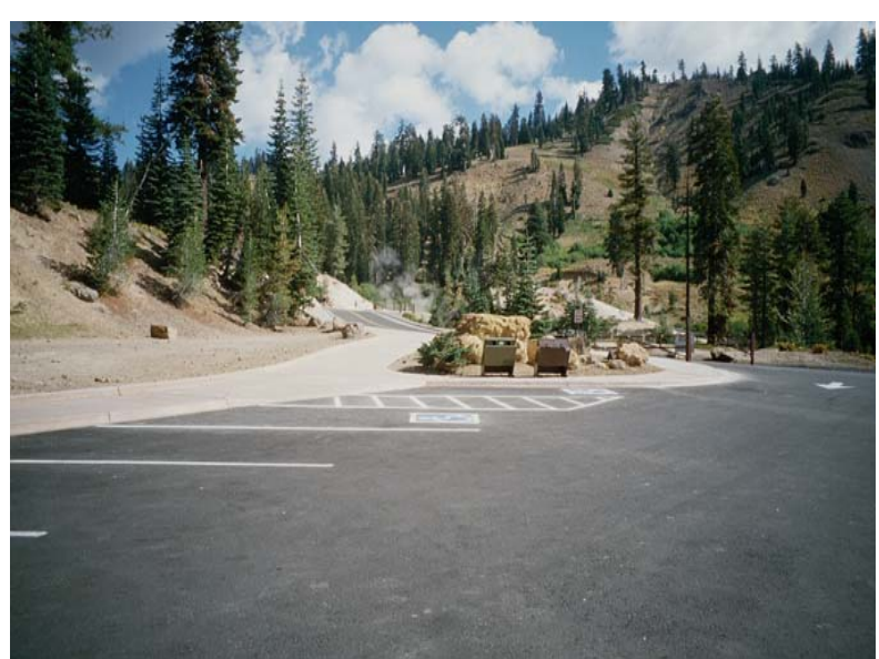
SULPHUR WORKS APPROACH WITH NEW INTEGRAL COLORED SIDEWALK AND CURB/GUTTER AND TRASH/RECYCLE CONTAINER RELOCATION