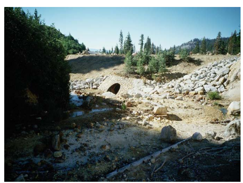
DRAINAGE CLEANED OUT, HEADWALL REPAIRED AND ADDITIONAL RIPRAP INSTALLED AT INLET AND SIDE DRAINAGE