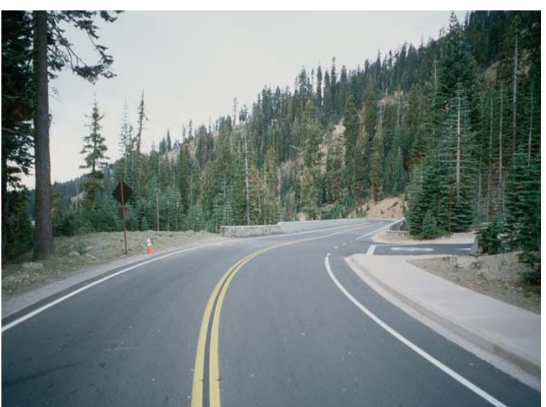
PULLOUT OBLITERATION, APPROACH GUARDWALLS ADDED, REMOVAL OF OLD CONCRETE CURB/GUTTER AND SIDEWALK