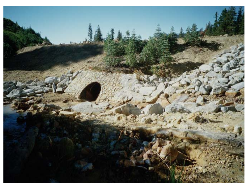
DRAINAGE CLEANED OUT, HEADWALL REPAIRED AND ADDITIONAL RIPRAP INSTALLED AT INLET AND SIDE DRAINAGE