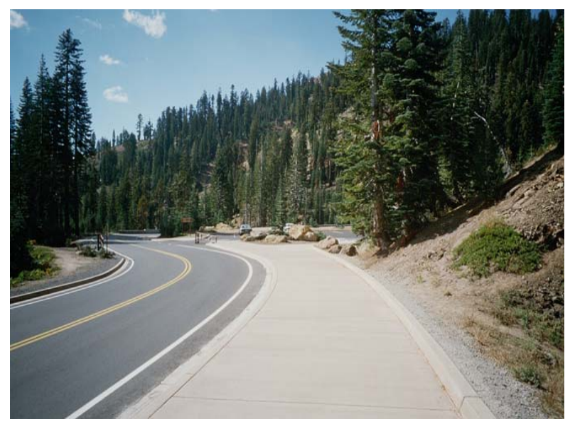
IMPROVED PEDESTRIAN ACCESS WITH NEW INTEGRAL COLORED SIDEWALK, VIEWING AREA AND CURB/GUTTER