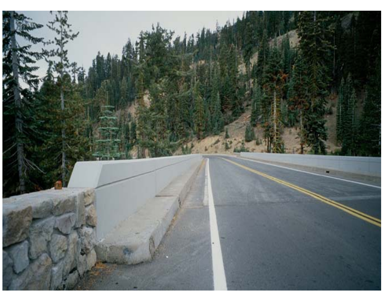
REMOVED METAL BRIDGE RAILS AND REPLACED WITH CONCRETE PARAPETS