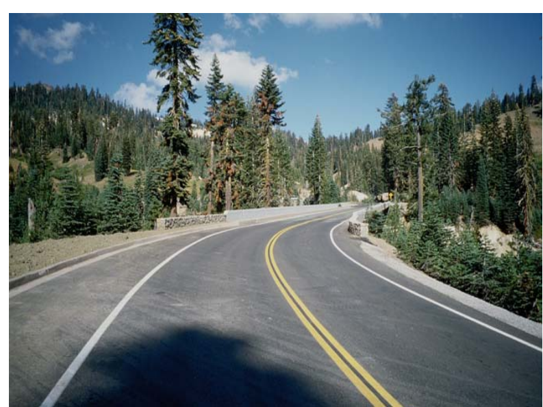
APPROACH WALLS ADDED, REMOVED METAL BRIDGE RAILS AND REPLACED WITH CONCRETE PARAPETS