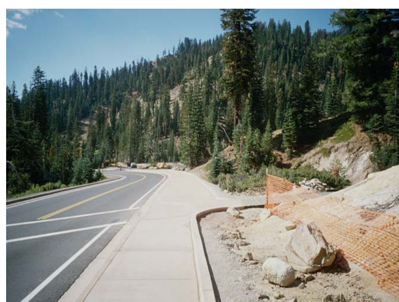
IMPROVED PEDESTRIAN ACCESS WITH NEW INTEGRAL COLORED SIDEWALK, VIEWING AREA AND CURB/GUTTER