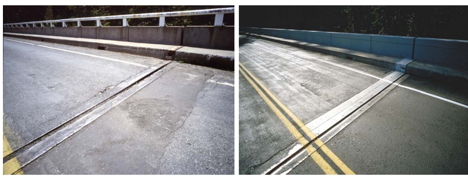
REMOVED AND REPLACED DAMAGED BRIDGE EXPANSION PLATE