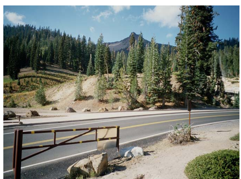
SULPHUR WORKS APPROACH WITH NEW GATES AND INTEGRAL COLORED CONCRETE SIDEWALK, AND CURB/GUTTER