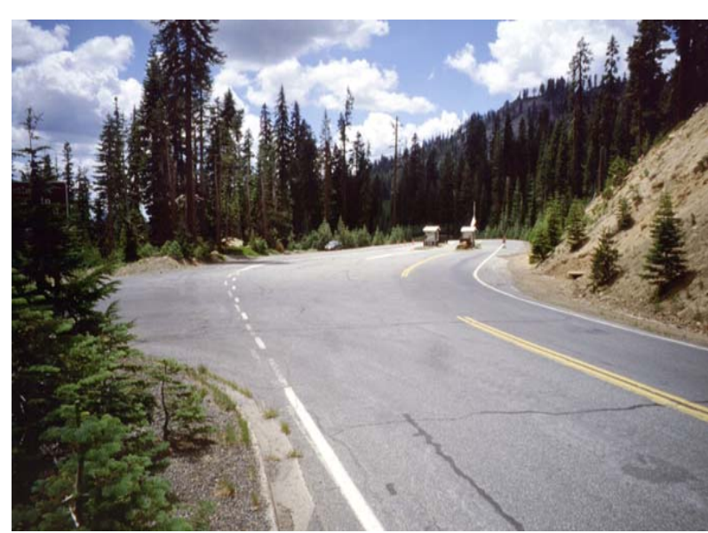
DETERIORATED CURBING, ASPHALT AND POOR DRAINAGE