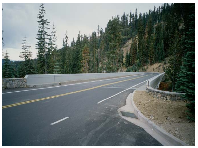
APPROACH WALLS ADDED, REMOVED METAL BRIDGE RAILS AND REPLACED WITH CONCRETE PARAPETS, OBLITERATE OLD ASPHALT WALK