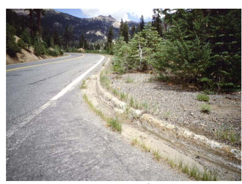
DETERIORATED CURB AND ASPHALT