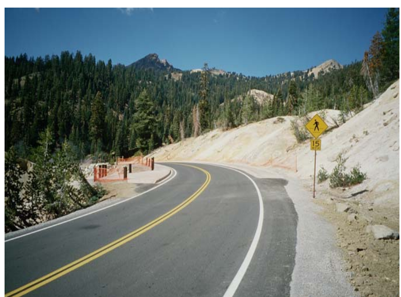
IMPROVED PEDESTRIAN ACCESS WITH NEW INTEGRAL COLORED SIDEWALK, VIEWING AREA AND CURB/GUTTER