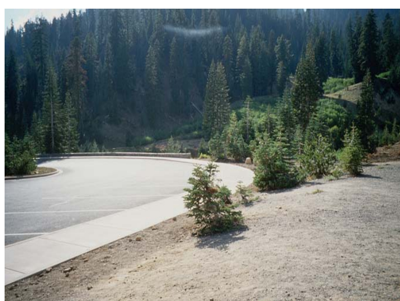
SULPHUR WORKS ROAD AND PARKING ISLAND OBLITERATION