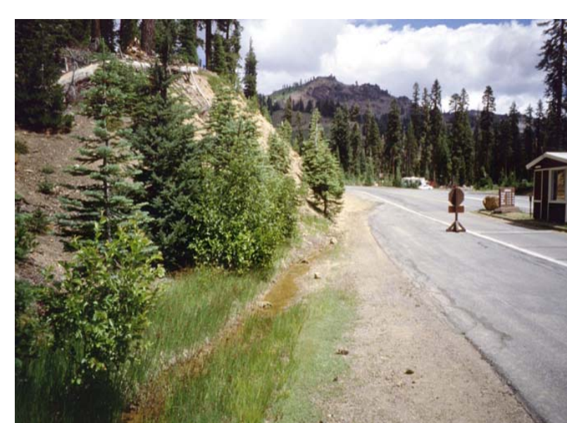
POOR DRAINAGE AND DETERIORATED ASPHALT