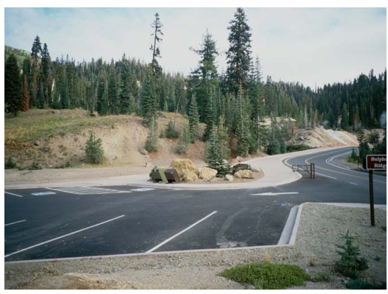
SULPHUR WORKS APPROACH WITH NEW INTEGRAL COLORED SIDEWALK AND CURB/GUTTER AND TRASH/RECYCLE CONTAINER RELOCATION