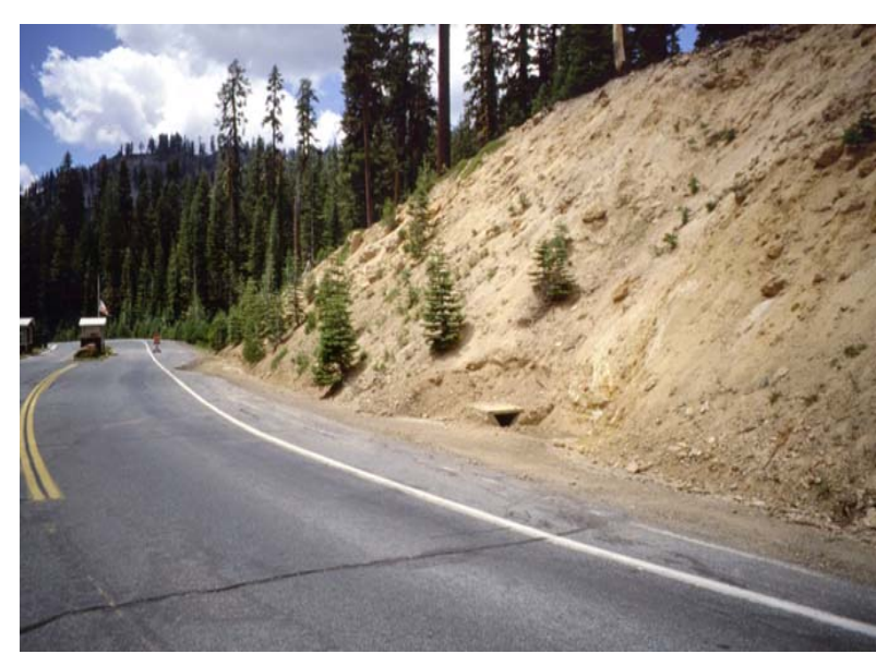
POOR DRAINAGE, SLOPE EROSION ONTO ROAD AND DETERIORATED ASPHALT