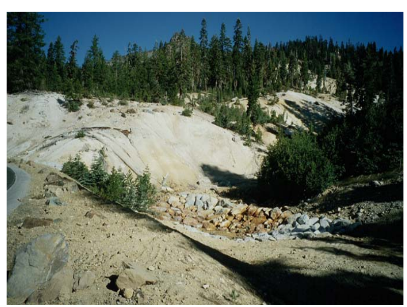
DRAINAGE CLEANED OUT, HEADWALL REPAIRED AND ADDITIONAL RIPRAP INSTALLED AT INLET AND SIDE DRAINAGE