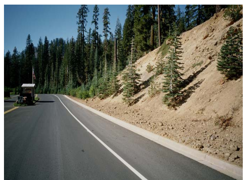
GROUND WATER PROBLEM CORRECTED WITH FRENCH DRAIN