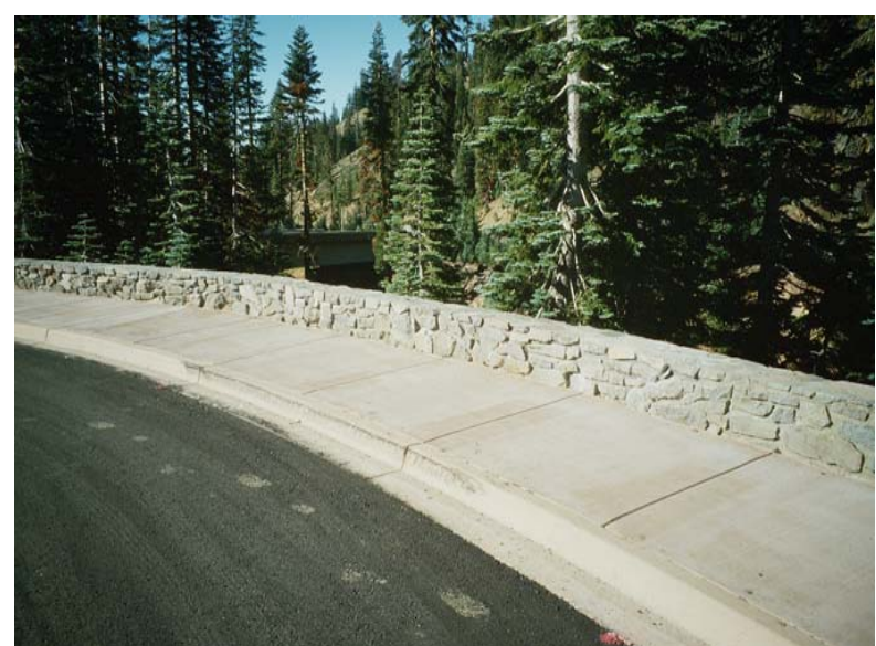
DAMAGED ROCK WALL REPAIR