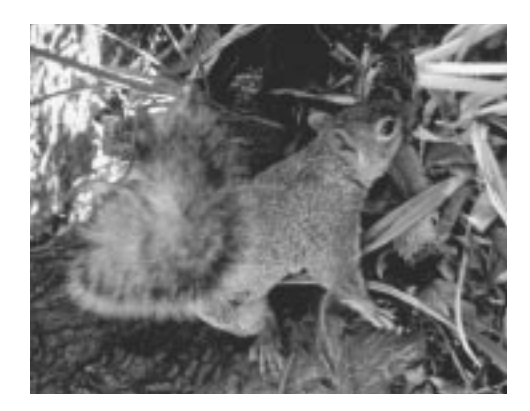
Looking for a home. Forest clearing has reduced Delmarva fox squirrel habitat.