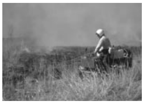
\label{lem:accomposition} A \ custom \ ATV \ provided \ mobile \ support.