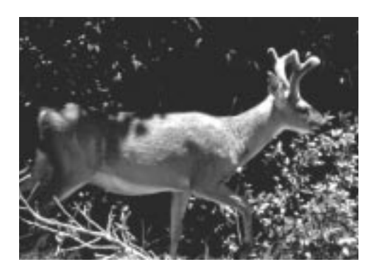
Trouble in paradise. At Key Deer Refuge in Florida, wildlife often competes with humans for space to live.

To the east of Puerto Rico, in the U.S. Virgin Islands, Buck Island NWR sits off bustling Charlotte Amaile Harbor on St. Thomas. More cruise ships enter here than any other port in the Caribbean. Each day a converted submarine takes visitors on short excursions through extremely fragile reefs that are part of the refuge.