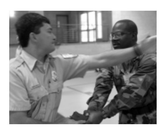
Virtual reality. Students in the Refuge Officer Basics School simulate real-life situations to prepare them for their law enforcement duties.

Squeaking shoes and "Down, down, down!" commands echoed through the National Conservation Training Center gym as participants in the Refuge Officer Basics School grabbed their classmates by the thumb and twisted their arms behind their backs, pushing them towards the mat. Once the "suspects" lay prone, the "arresting officers" snapped on the cuffs.