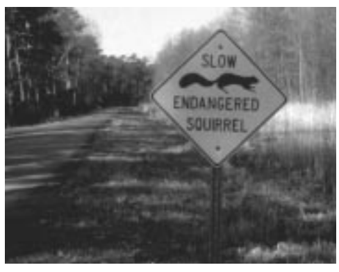
Sign of the times. Travelers to forest areas on Maryland's Eastern Shore may be greeted by one of these signs.

The forestry project is a model of publicprivate cooperation. Partners include the Service, the Geological Survey, The Conservation Fund, the Chesapeake Bay Foundation, the Maryland Department of Natural Resources, the Maryland Forest