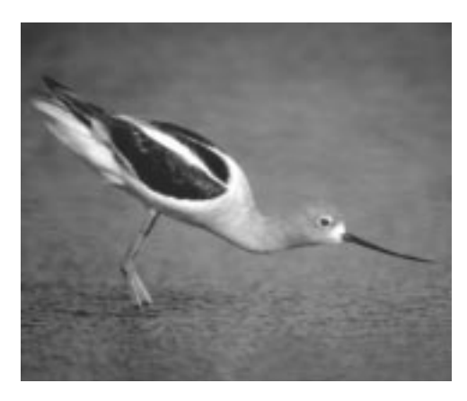
Key links. "Linking Communities, Migratory Birds and Wetlands" focuses on conserving all of the habitat used by migratory birds such as avocets.

Participants identified shorebird management issues at each site and local groups in each community developed needs assessment documents. Members of the Great Salt Lake group include such diverse organizations as Davis County Tourism, Kennecott Corp., the Service, the Utah Division of Wildlife Resources, the Bureau of Land Management, and The Nature Conservancy.