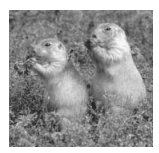
Under review. Prairie dog habitat has shrunk nearly 95 percent during the last century. The Service is reviewing the status of the species and will decide whether to propose listing under the Endangered Species Act.

Poisoning, unregulated shooting, legislatively-mandated eradication programs, and the destruction and modification of habitat also may be significant factors affecting black-tailed prairie dog populations