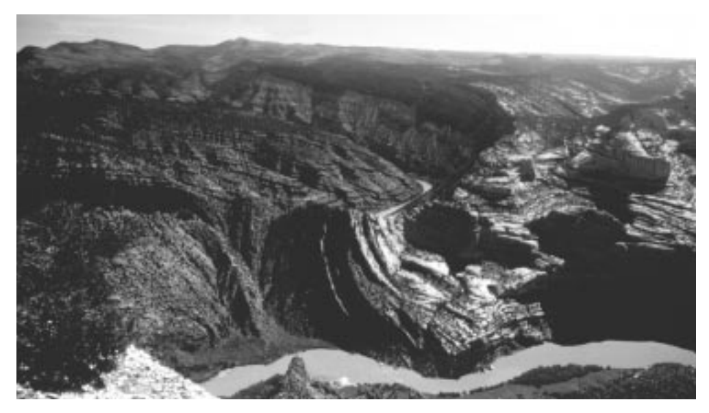
Scene of the crime. A hunting guide led several illegal trophy game hunts through the National Park Service's Dinosaur National Monument in Colorado.

A 2-year undercover investigation conducted by the Service and the Colorado Division of Wildlife infiltrated a lucrative poaching business and recently resulted in a prison sentence for an outfitter/guide charged with leading illegal hunts in northwest Colorado. Some of the crimes occurred within the boundaries of Dinosaur National Monument, a well-known winter refuge for big-game animals.