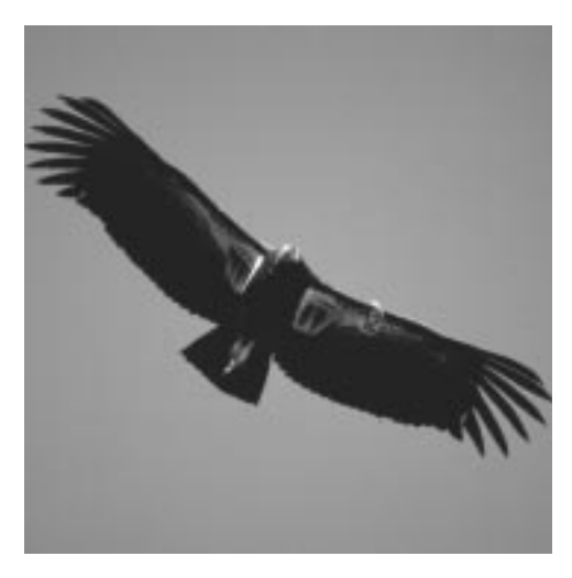
Free at last. Y92, a newly-released juvenile condor, in flight over Lion Canyon.

To give the young birds a better chance of surviving in the wild, biologists gave them power pole aversion training. Staff from the refuge complex also delivered stillborn calf carcasses to the Los Angeles Zoo to help the young birds develop carcass feeding skills.