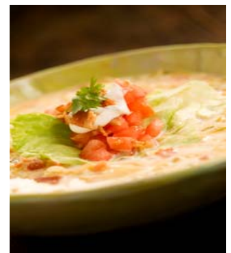
Recipe: Paula Deen