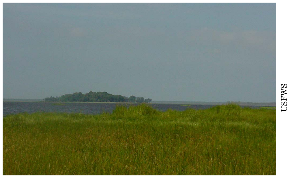
The\ Chesapeake\ Bay\ islands\ provide\ unique\ habitats\ for\ colonial\ nesting\ birds