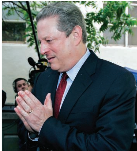
Winners all. IPCC chair Rajendra Kumar Pachauri (left), representing several thousand scientists, and Al Gore share the Nobel Peace Prize for creating and spreading knowledge of climate change.

chaired from 1997 to 2002—and to Al Gore for their “efforts to build up and disseminate greater knowledge about man-made climate change” because such change may increase “the danger of violent conflicts and wars, within and between states.”