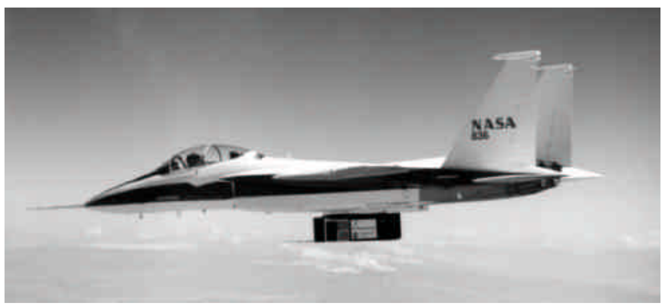
The F-15B Research Testbed is used to make in-flight experiments investigating a variety of aerospace topics including aerodynamics, instrumentation and propulsion.

When a research mission must be photographed, chase aircraft become camera platforms. Photography — still, motion picture, and video — is used extensively by engineers to monitor and verify planned events that occur during flight. Recent and future photo chase aircraft will document the Access to Space experimental vehicles. Photography becomes part of the historical record of the project, and ultimately the historical record of NASA.