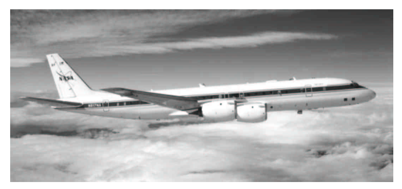
The NASA Airborne Science program operates two ER-2s and this DC-8 as flying science laboratories.