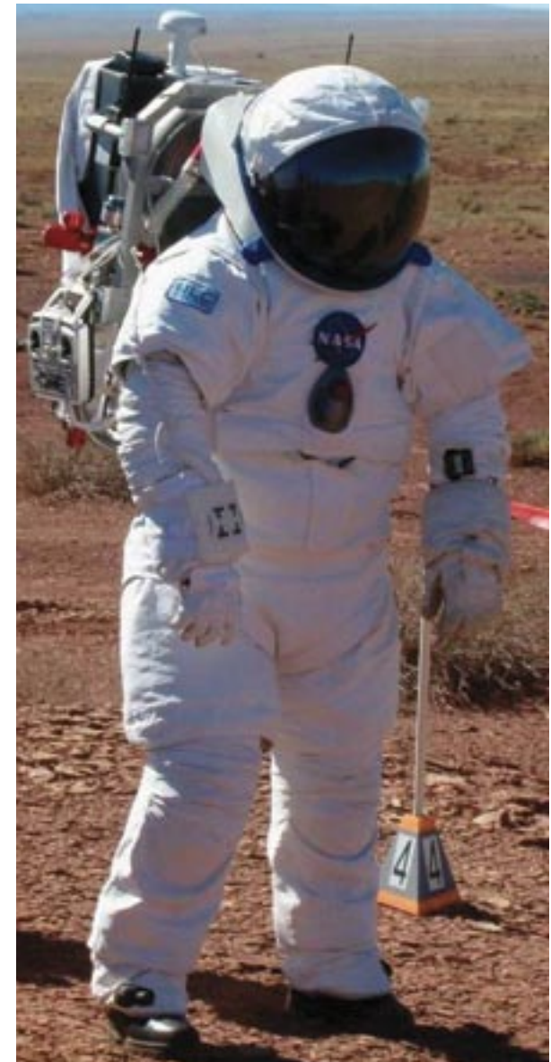
In 2004, ILC Dover, Inc.'s new I-Suit, an extra vehicular activity space suit, was tested in Meteor Crater, Arizona.

NASA also called upon ILC Dover's skills recently, providing the company's engineers the opportunity to spin some of their technical talents back into the Space