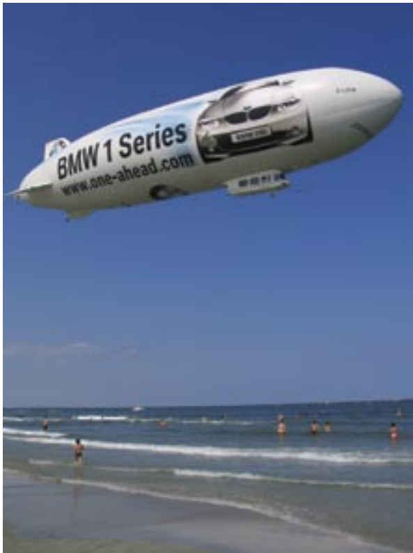
ILC Dover, Inc. manufactures 80 percent of the LTA in the world. Blimps, like the one pictured here, often fly over sporting events and vacation spots.

ILC Dover has partnered with NASA from the very beginning and continues to support its missions. NASA recently called upon ILC Dover for its expertise in