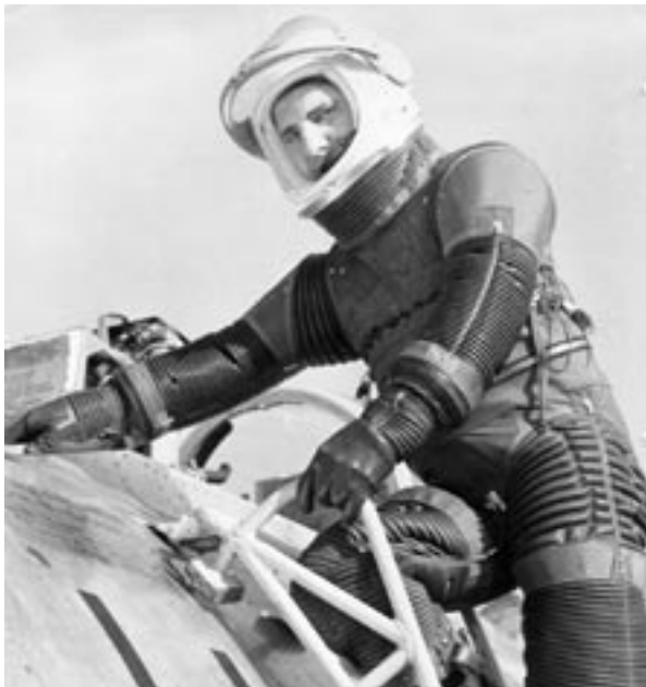
The XMC-2 ILC Full Pressure Suit (1955-1959) was built under a contract with the U.S. Air Force and incorporated bellows and convolutes that greatly increased mobility. This suit laid the groundwork for the design of the Apollo space suits.

Space is a hostile environment where astronauts combat extreme temperatures, dangerous radiation, and a near-breathless vacuum. Life support in these unforgiving circumstances is crucial and complex, and failure is not an option for the devices meant to keep astronauts safe in an environment that presents constant opposition. A space suit must meet stringent requirements for life support. The suit has to be made of durable material to withstand the impact of space debris and protect against radiation. It must provide essential oxygen, pressure, heating, and cooling while retaining mobility and dexterity. It is not a simple article