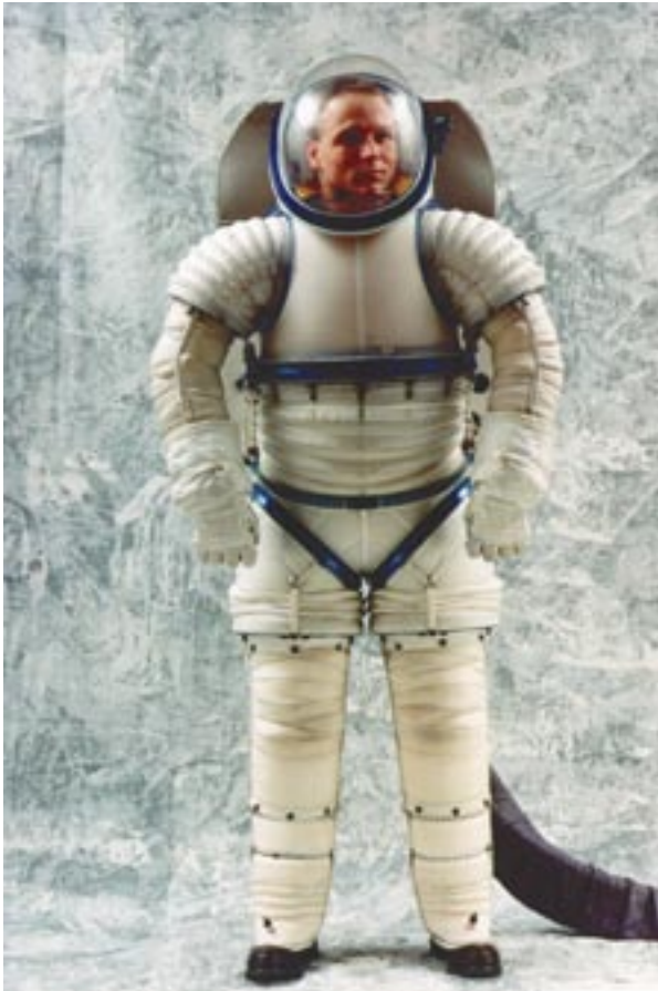
The I-Suit is a highly mobile, soft extra vehicular activity space suit that accommodates astronauts from the 5 th percentile female to the 95 th percentile male.

Program. They designed and manufactured the Mars landing space inflatables for the Pathfinder and Mars Explorer Rover (MER) Missions. These large airbags cushioned the drop onto the surface of the Red Planet. In addition, they manufactured the landing ramps and continue to provide suits to support the construction of the International Space Station.