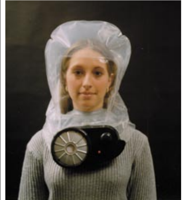
The SCape Hood can be fitted in place and functioning in 30 seconds or less.

ILC Dover's use of high-performance, rugged textiles has led it in yet another direction. The engineers have been using their space experience to manufacture blimps, aerostats, airships, and other LTA vehicles since the early