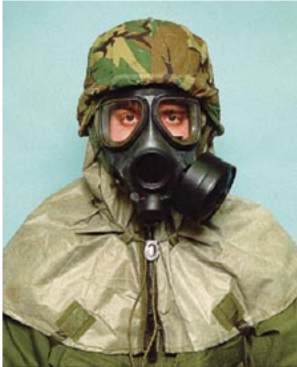
ILC Dover, Inc. has provided over 1.6 million M40 gas masks to the U.S. Army.

the pharmaceutical-manufacturing industry. First, the DoverPac is manufactured at the same factory, and undergoes the same scrutiny and rigorous testing as NASA's space suits. Furthermore, the heat-sealing technology employed by ILC Dover to seal components within the space suit is the same that is used to create the DoverPac, and the woven restraint/bladder that contains the powdered product mirrors the design approach used on the space suit. The outer restraint of the DoverPac is made of a grounded woven mesh to avoid static sparks near the fine powders. This is the same mesh found on the inflatable devices used for the Mars Pathfinder and MER.