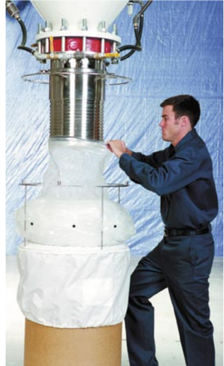
A technician works with the DoverPac system, a revolutionary, safe pharmaceutical-manufacturing system.

Cool Vest™ is a trademark of ILC Dover, Inc. SeliTherm™ is a trademark of SeliCor, Inc. DoverPac® is a registered trademark of ILC Dover, Inc. ArmorFlex® is a registered trademark of ILC Dover, Inc. SCape Hood™ is a trademark of ILC Dover, Inc.