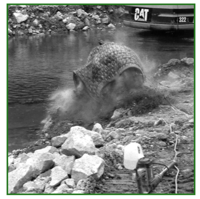
Figure 11—The lanyard is pulled to fire the primer cartridge.