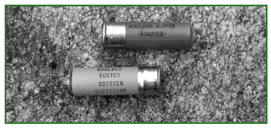
Figure 14—The Boulder Buster cartridge resembles a 12-gauge shotgun shell, but cannot be chambered in a shotgun.