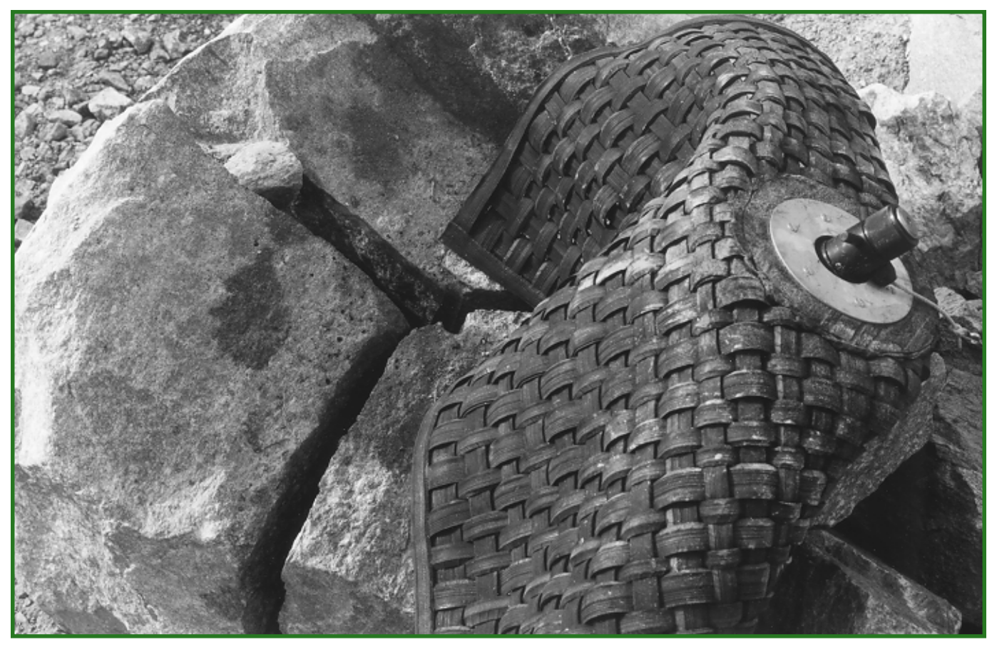
Figure 12—Results of using the Boulder Buster.

This tool can be used safely relatively close to equipment and personnel. It can be used during periods of high fire danger without the risk of starting secondary fires.