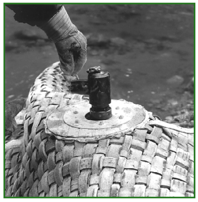
Figure 9—The firing mechanism is threaded into the breech block.