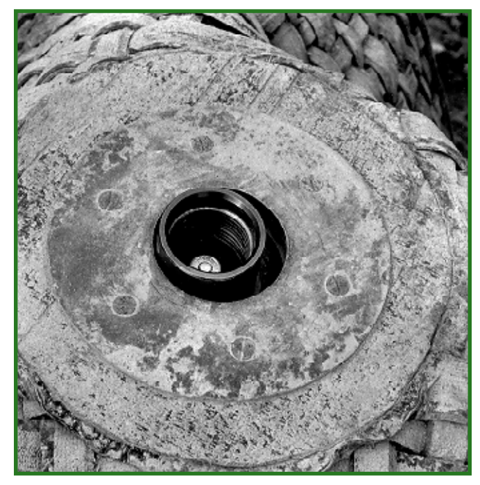
Figure 8—The primer cartridge seated in the breech block.

away and detonates the cartridge by pulling the lanyard.