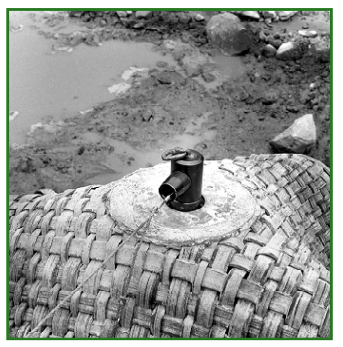
Figure 10—The lanyard is attached to the firing mechanism.