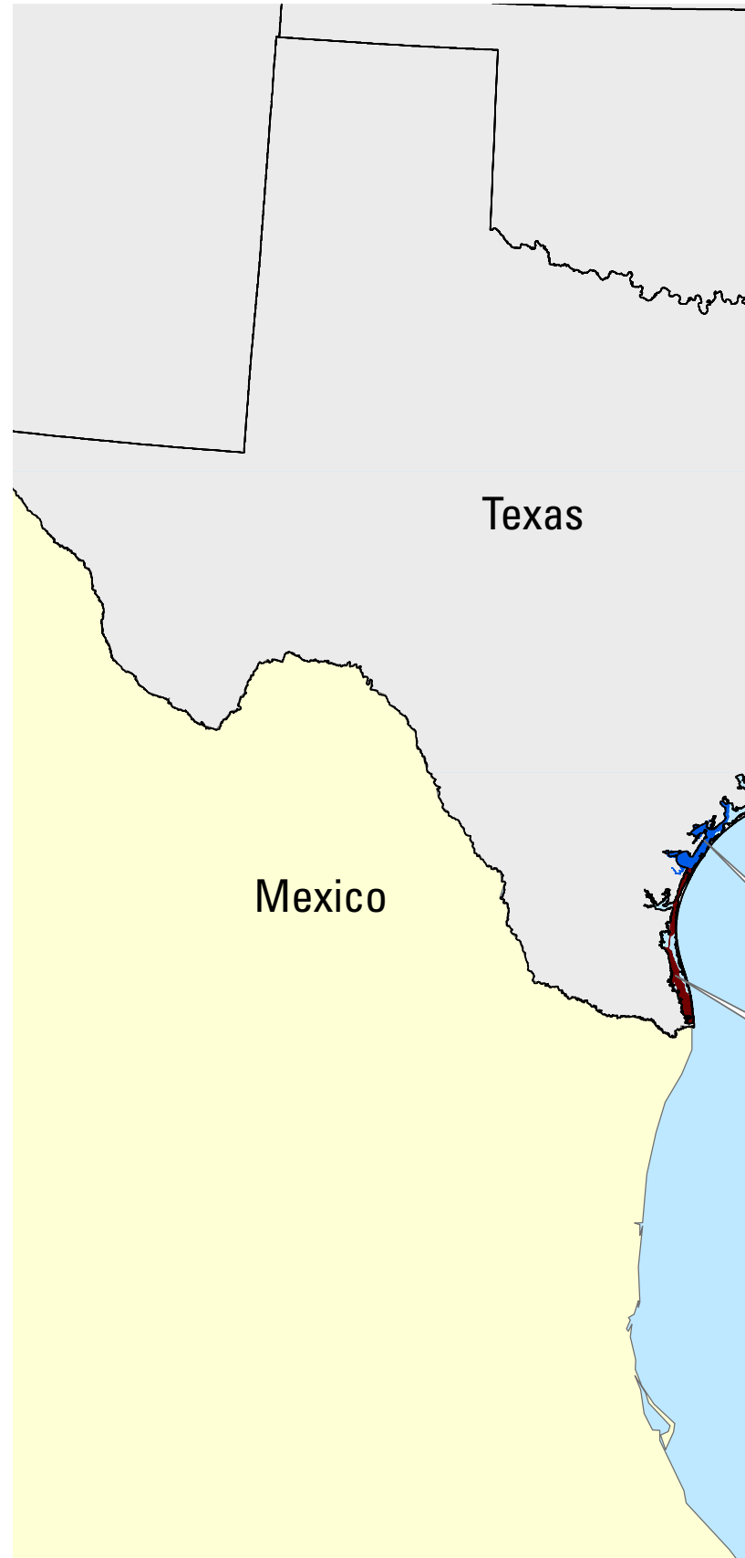
Figure 1. Local estuarine systems described in this report.

This report presents the initial efforts of the Gulf of Mexico Program and its partners to implement a comprehensive research and restoration plan for seagrasses. The purpose of the review is to provide scientists, managers, and citizens with valuable baseline information on the current status of seagrasses in the coastal waters of the northern Gulf of Mexico. In the following sections of this document, detailed backgrounds on each of the respective geographic areas are presented. Each section includes the areal extent, geology, bathymetry, and key aquatic species inhabiting the area. Additionally, seagrasses species, their abundance and distribution, and methods used to evaluate the historical and current trends are presented. For each system, information on the causes of seagrass habitat degradation is offered, as well as potential restoration opportunities and techniques for improving seagrass health in that specific estuary.