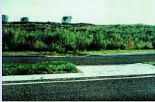
Pedestrian ramps leading nowhere