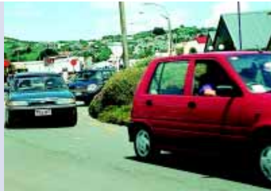
Approaching vehicles are hidden by vegetation