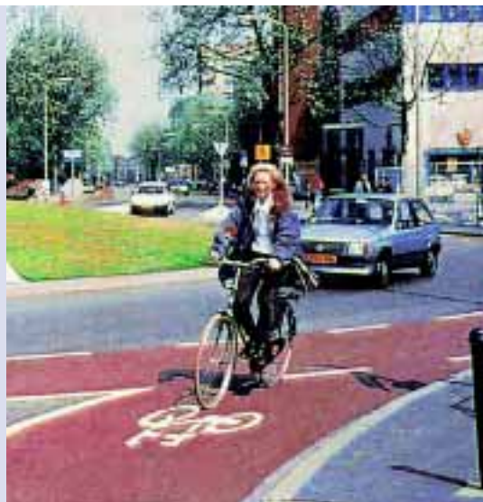
Typical cycle treatments used overseas