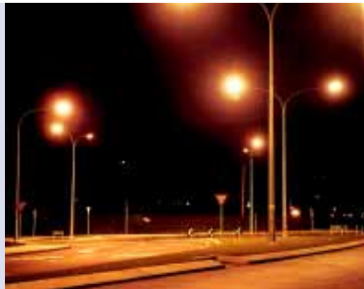
Street lighting highlighting roundabout and its approaches