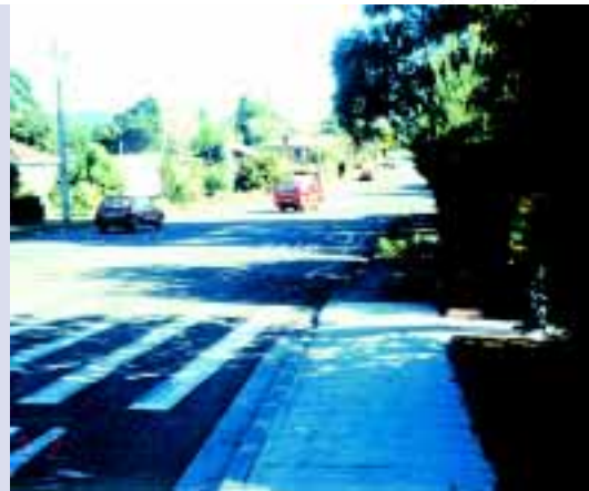
Shadow across crossing and vegetation hiding pedestrian