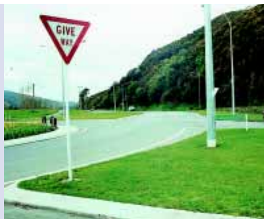
Excellent visibility provided for motorists