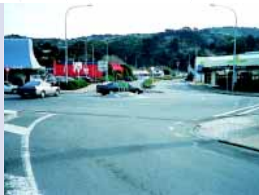
Street lighting poles located well clear of kerbs