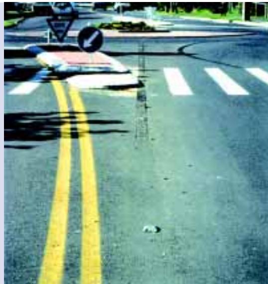
Old markings confuse pedestrians and motorists. Redundant reflective markers misguide motorists