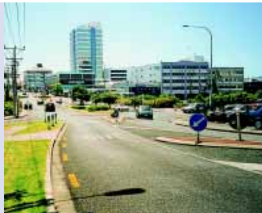
Badly aligned median with sharp transition. Roadmarking needs to be altered