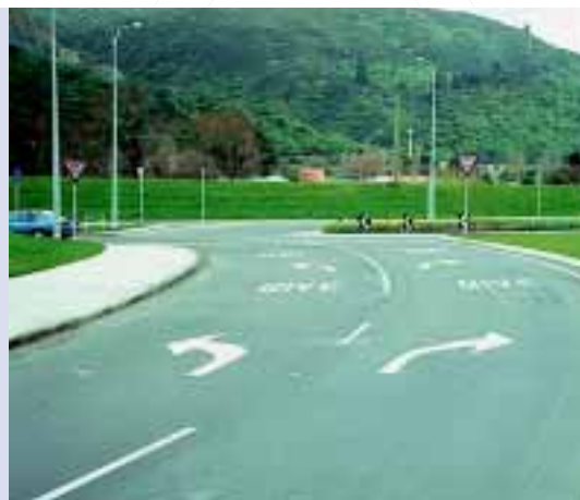
Good deflection of median further highlighted by roadmarking