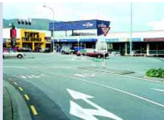
Good clear roadmarkings provide motorists with clear instructions