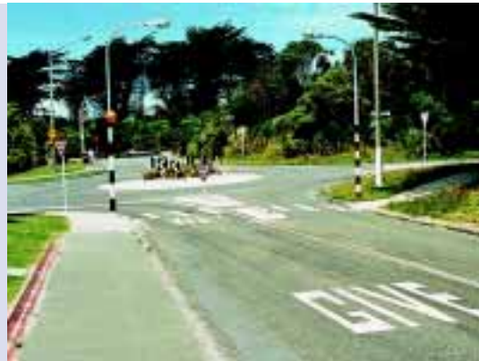
Good pedestrian design with linking paths and clear visibility