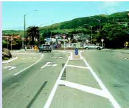
Good clear roadmarkings