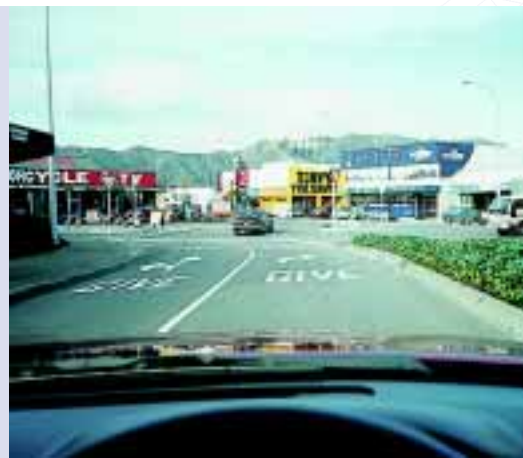
Poor central island design leading to a lack of island recognition