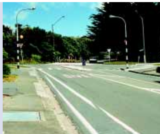
Good clear sight lines with pedestrian and motorist