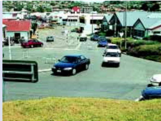
Multi-lane roundabout providing no guidance to motorists in the circulating roadway