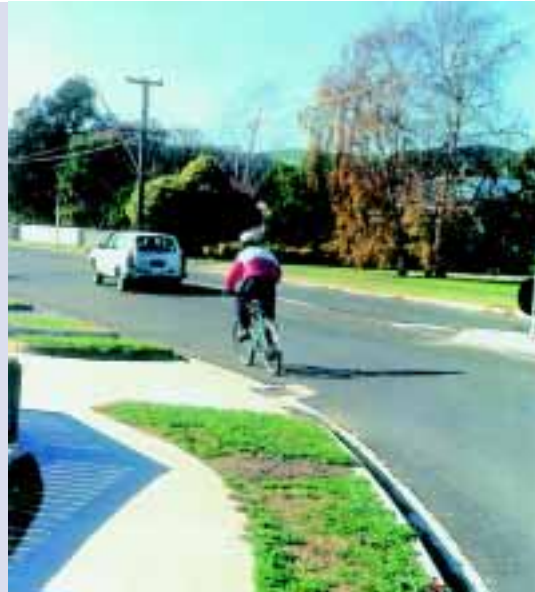
End of splitter island is beyond sump forcing rider to the left and onto stormwater grate