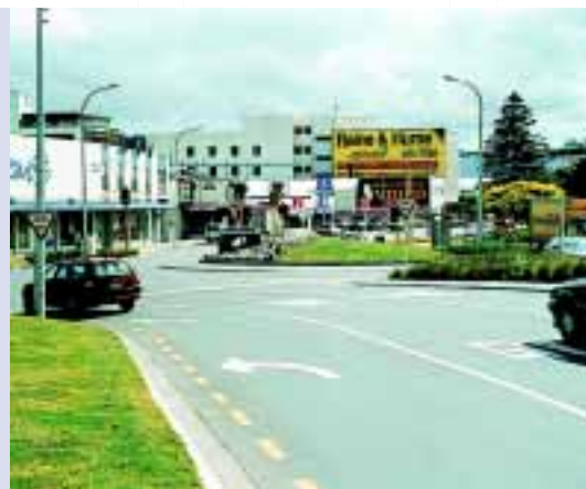
Raised central island improves the intersection control and its recognition