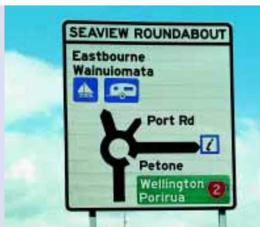
Good clear directions given to motorists in advance of the roundabout