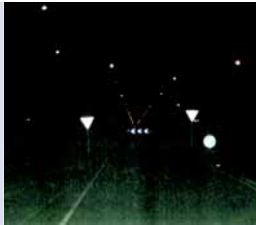
Streetlights lead motorists straight through the roundabout