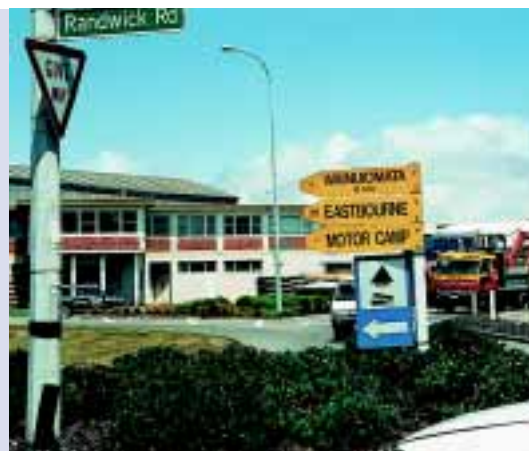
Destination signs hide approaching vehicles