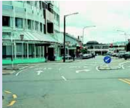
No deflection for straight through traffic