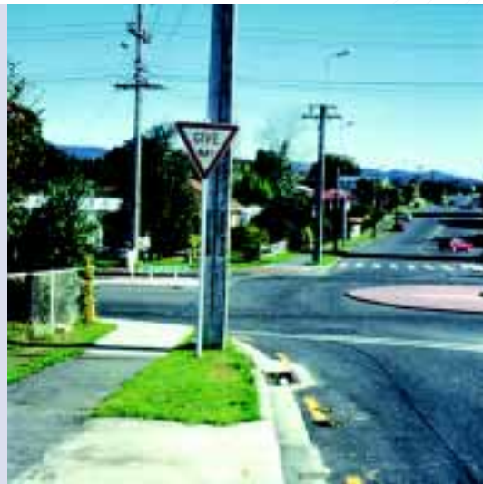
Poor location of solid concrete lamp-post on approach