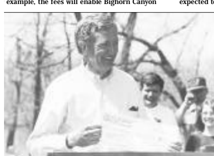
Secretary Babbitt, who has climbed, paddled, and hiked through Interior-managed lands to raise public awareness of the need for proved upkeep and maintenance, receives a $10,000 donation from the National Park Foundation for the restoration of the C& O Canal.

rance fees at the four largest parks will increase 320 per car for seven days. Fees at most other ntified sites will range from $2 per person to ut $20 per car. The fees will be used for specific jects at the sites where they are collected and be targeted for much needed repairs and nts that have been delayed because of