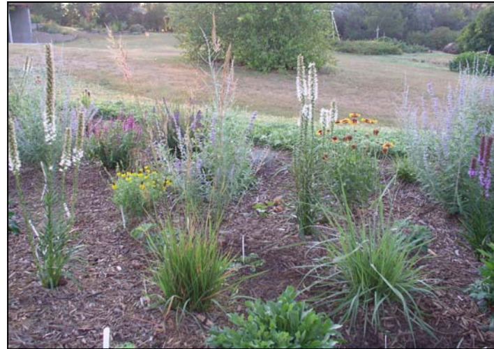
Figure 5. For much of the summer in the Great Plains, a rain garden might be the only "green" area in a non-irrigated yard.

Use potted or bare root plants rather than seeds. Plant from April to September. Place the more water tolerant species near the bottom, and drought tolerant near the edges. Plant spacing will vary depending upon species and desired appearance. Generally, 15-18 inches between plants is adequate. Consider mature size when spacing plants.