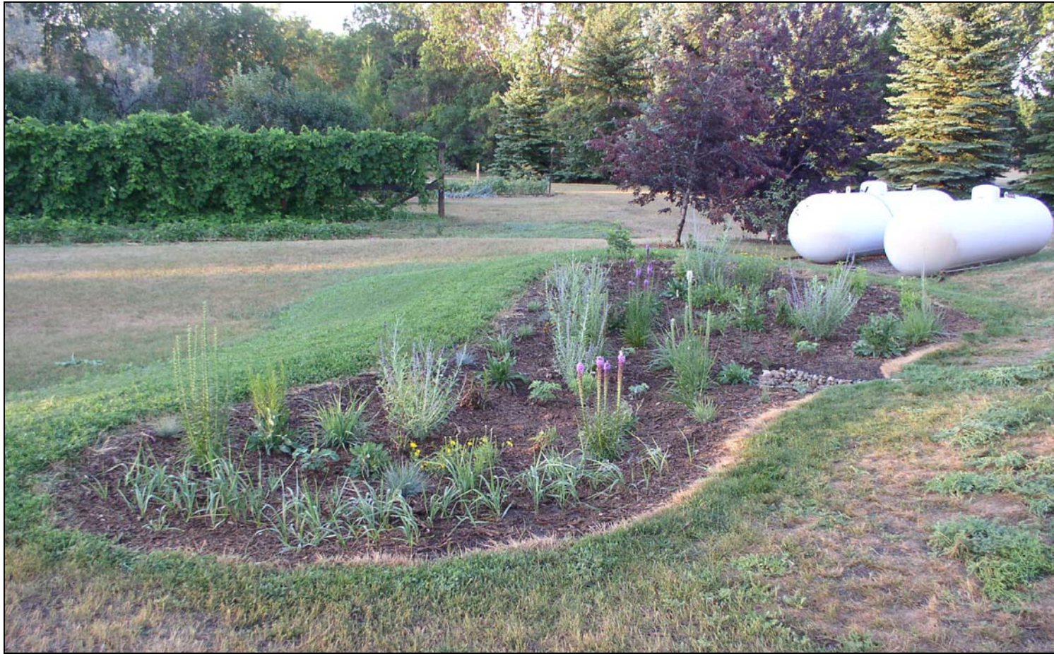
Figure 1. A 200-square foot rain garden blooms just 2 months after construction and planting.