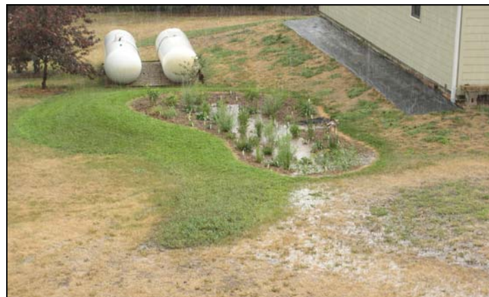
Figure 2. A new rain garden captures roof and yard runoff from a 1/2 inch, 15-minute prairie thunderstorm in July. Note the drought stressed yard outside the rain garden.

A rain garden is a colorful, perennial planting designed to capture and use rain water that may otherwise run off. (Figure 1) It is a garden in a shallow depression. It can be large or small. A rain garden is not a wetland and should not hold water for more than a few hours, or a day at most. It is not a breeding ground for mosquitoes.