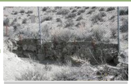
Previous erosion on the site

The Wardell Buffalo Trap. Smithsonian Site Number 48SU301, is the earliest known evidence of a communal bison kill and trap involving the use of the bow and arrow on the Northwestern Plains (Frison 1978), and was subject to excavations by the Anthropology Department of the University of Wyoming during 1971 and 1972. Research conducted at the site resulted in the discovery of post holes defining a trap perimeter, various hearth structures both within the bone bed and adjacent processing area, approximately 470 projectile points, pottery sherds, ground stone, the remains of over 230 individual bison, hundreds of tools (crafted from both stone and bone), and radiocarbon dates representing three distinct stratigraphic levels was all part of the work in the 1970's. In total, over 4 tons of archaeological material was recovered. These findings highlight the site's significance and were the basis for a National Register of Historic Places listing (NRHP registered property number 49). Additional information concerning the excavations of this NRHP eligible and listed historic property can be found in Prehistoric Hunters of the High Plains (1978 1st Ed., 2nd Ed. 1991) and The Wardell Buffalo Trap 48 SU 301: Communal Procurement in the Upper Green River Basin, Wyoming (1973) both written by Dr. George Frison.