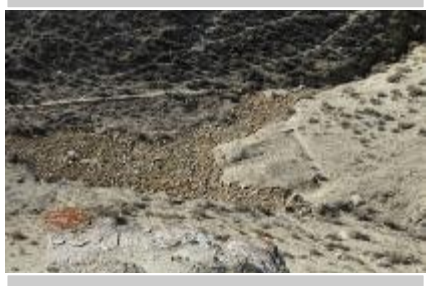
View of erosion barrier

From the naturally occurring adverse affect of torrential rains and flooding in 2004, a vast amount of knowledge can be learned concerning the effects of flash floods on culturally significant prehistoric sites. By analyzing the fluvial dispersal of bone, stone and vegetation associated with 48SU301, more can be learned about size, shape and weight sorting by fluvial transport potentially important to investigators across the country and in other disciplines. Patterned orientation of bones in association with fluvial dispersal can help determine the formation of sealed sites in other areas of the nation proving to be highly useful to scientists across many disciplinary lines.