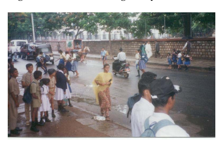
Figure 1: Children crossing a busy road in India

In many developing countries, pedestrians are a particularly vulnerable group of road users. In Asia, Africa, the Caribbean and the Middle East, more than 40 per cent of reported road accident deaths are pedestrians, compared to 'only' about 20 per cent in Europe and the United States. Furthermore, certain types of pedestrians, such as the young, have been identified as being especially at risk in these road accidents. Accidents involving children less than 16 years of age on average contribute to 20 per cent of pedestrian fatalities in developing countries making them a major safety problem and cause for concern.