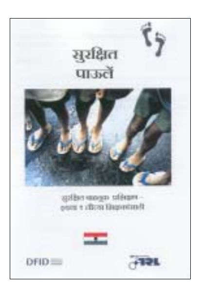
Figure 4: Cover of the 'Safe Feet' Resource (Marathi Version)

It was designed to follow the elements of the existing competency based curriculum and 'joyful learning' approach to teaching that was recommended in The National Policy on Education published in India in 1986. The resource was designed to increase the children's observational skills and their knowledge and understanding of traffic. It ensured that they could recognise the dangers of traffic, behave safely as pedestrians and know what they needed to do to keep themselves and others safe.