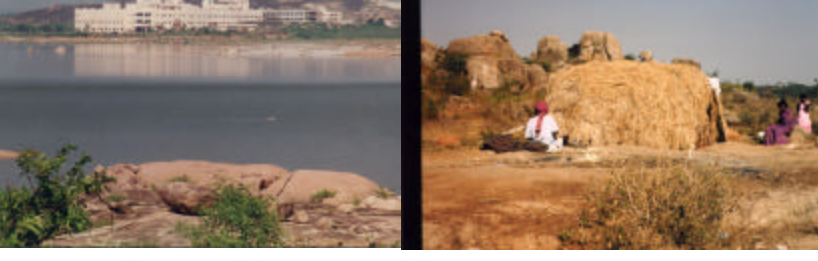
MediCiti is a project of "Science Health Allied Research Education" a not for profit institution founded by Asian Indians in the USA. S.H.A.R.E. has established a healthcare system in Andhra Pradesh (South India) consisting of hospitals, a Medical School, Nursing School, School for Respiratory Therapy, Institute for Craniofacial Surgery (funded in part by Smile Train Inc) and MediCiti Immunology & Infectious Diseases Research care