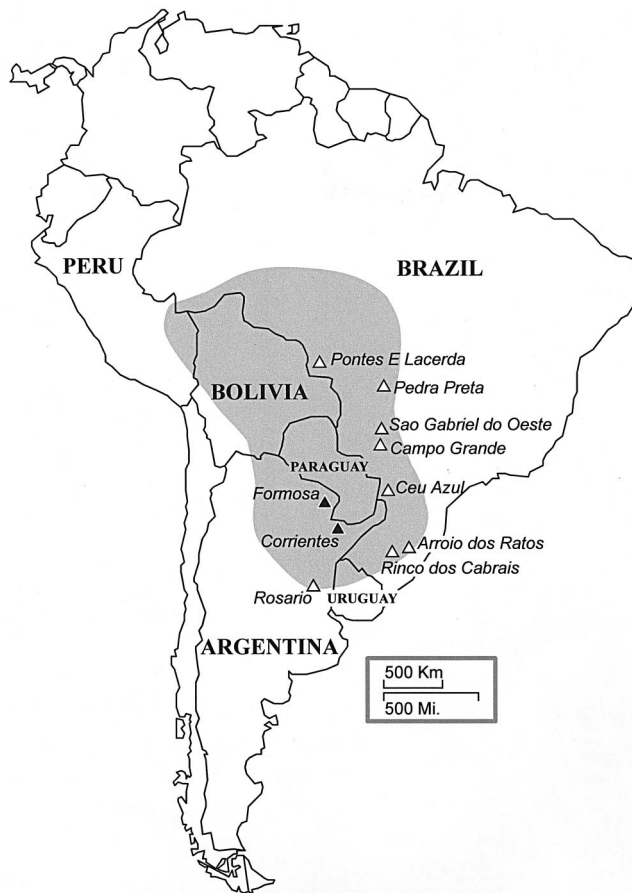
Fig. 1. Locations of populations of native S. invicta from which specimens were collected for determination of social form. White triangles indicate locations of samples for the current study; black triangles indicate locations of samples from the studies of Ross (1997) and Ross et al. (1997). Extent of the native range, indicated by shading, is based on Buren et al. (1974), Trager (1991), and Pitts (2002).

not the B allele sequence. For our study, this diagnostic PCR assay incorporated two forward primers, one fully complementary to the b allele and the other fully complementary to the b' allele, and a single reverse primer fully complementary to all three alleles (see Table 2 for primers). PCR reactions were set up in 20- \mu l reaction mixtures containing 1.6 \times PCR buffer (16 mM Tris-HCl, 2.4 mM MgCl 2 , 80 mM KCl), 1 \times Q-Solution (Qiagen), 100 \mu M dNTP, 0.167 \mu M of primer Gp9_b.for , 0.333 \mu M of primer Gp9_b_prime.for , 0.5 \mu M of primer Gp9_all.rev , 2 \mu l of hydrated template DNA, and 1.0 U of Taq DNA polymerase. PCR reactions were conducted in 0.5-ml thin-wall PCR tubes under a mineral oil barrier. The following cycling profile was employed: initial denaturation at 92°C (2 min); 35 cycles of 92°C (45 s), 57°C (45 s), and 72°C (1 min); and a final elongation step at 72°C (5 min). The predicted 219-bp PCR product in individuals bearing a b -like allele was visualized under ultraviolet light in a 2% agarose gel stained with ethidium bromide. Preliminary experiments using varying concentrations of template DNA from 14 individuals of known genotype confirmed that the assay