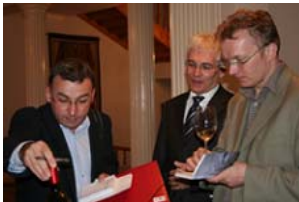
Journalists from the Czech Republic taste Moldova's wines.