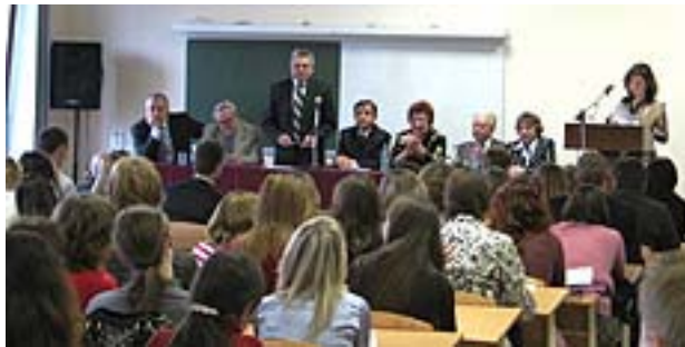
During the conference.

The New Eurasia Establishment (NEE), a local partner of the Eurasia Foundation, together with the Belarus State University Law Department organized an international conference on October 19-20 in Minsk, entitled "Tendencies in Development of Laws and Advancement of Law Practice in Current Environment". The conference was the concluding event of its program on clinical legal education.