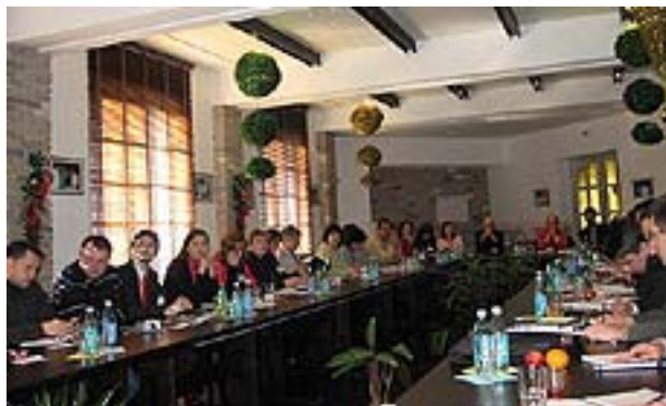
The first Community Connections Program Alumni Conference.

The first Community Connections Program Alumni Conference in Ukraine, entitled "Action Plans – the Road to Success," was held in Cherkasy, Ukraine, on November 29-December 1. The event was organized by the Social Partnership Centre, a Ukrainian NGO, in cooperation with Project Harmony, which is the project implementer. Community Connections is a U.S. government public diplomacy exchange program that encourages an exchange of information to build cultural, business and professional ties both with U.S. counterparts and with Ukrainian partners. Forty alumni representing 16 different exchange groups that traveled to the U.S. in 2006-2007 participated in the conference. These were generally professionals selected through an open competition from among the 200 alumni who had traveled to the U.S. in the last two years. They represented stakeholder groups from 17 oblasts, including businesses, local governments and NGOs. The main goals of the conference were to evaluate the implementation of action plans that participants created while in the US, to discuss obstacles participants may be facing, and to learn how to develop strategies for successful completion of projects.