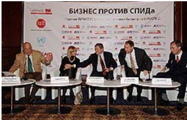
Ambassador Richard C. Holbrooke at the HIV/AIDS symposium.