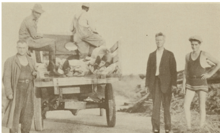
FIG. 4. Famous picture of the cemetery detail of the Okeechobee flood at Belle Glade caused by the "Okeechobee" hurricane of 1928 (from Palm Beach Hurricane—92 Views, 1928, American Autochrome Company, Chicago, IL ).

Probably the truest summation of the death toll from this storm and its uncertainties can be found in the book Killer 'Cane (Mykle 2002). Although this book appears to be partly historical fiction, the author makes a poignant observation that, "a simple summation of the reported number of people buried . . . totals more than 2400," (such a summation is included in Table 2) and he concludes "the true figure is more likely close to three thousand." He also states