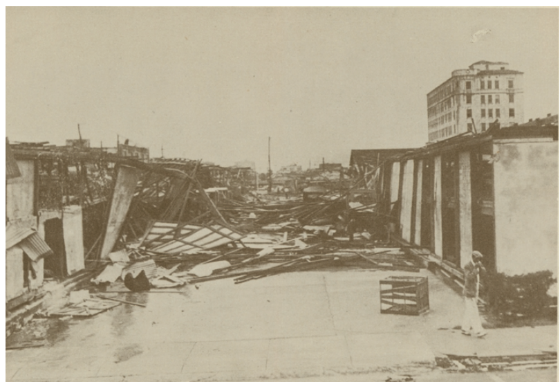
FIG. 3. Street scene in West Palm Beach after the “Okeechobee” Hurricane of 1928 (from Palm Beach Hurricane—92 Views, 1928 , American Autochrome Company, Chicago, IL).

Memorial services, one white, one nonwhite, were held at the same time but at different locations on Sunday, 30 September 1928, in West Palm Beach. The Miami Herald article ( Miami Herald , 1 October 1928) on the memorial services reported nearly 1000 victims