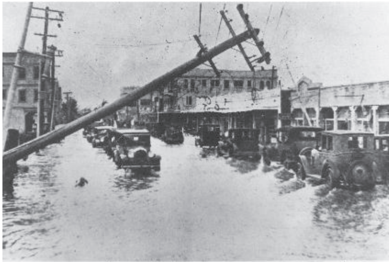
FIG. 2. Famous street scene at 12th Avenue and W. Flagler Street, Miami, after the “Miami” Hurricane of 1926.

It is not known exactly why the official NWS toll of fatalities does not reflect the various reports cited previously. It is worth noting, however, that the 1926 hurricane had a major economic impact on South Florida beyond the casualties themselves. The storm effectively ended the South Florida development boom of the 1920s. The higher the death toll, the greater the impact, no doubt. Regardless, revision of the NWS death toll for the 1926 hurricane from 243 to the Red Cross figure of 372 would result in that event becoming the eighth deadliest hurricane since 1900 to hit the mainland United States rather than the twelfth (Jarrell et al. 2001). Because of the likely inaccuracies associated with the count of nonwhite deaths in 1926, if not other sociological factors, it is possible (but not provable) that the 1926 hurricane even exceeded the death toll of 408 associated with the 1935 category-5 Florida Keys hurricane, which is now ranked as the fifth deadliest.