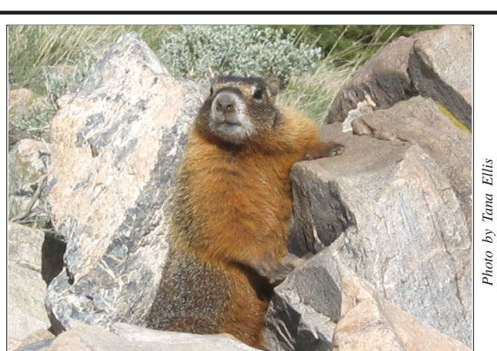
Marmot on the lookout

Our 2004 winter surveys for bighorn sheep found 12 individuals. After a long hike into Box Canyon to get a better look we were able to identify three ewes (adult females), three lambs, three young rams less than 4 years old, and three mature rams greater than three years old. One of the mature rams was our familiar green ear tagged ram. He was originally released by the Nevada Depart-