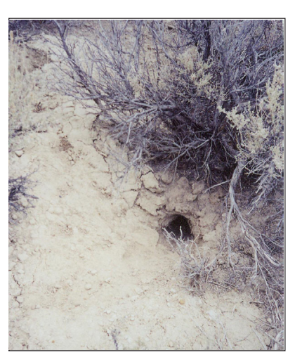
Pygmy rabbit burrow