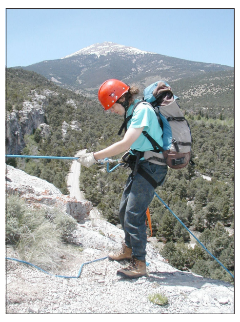
Some caves will require a rappel just to get to the entrance

The cave crew is going to be up at high elevation most of the summer. We are busy exploring and mapping the alpine caves of the park. In the park, any cave with an entrance at 9000 feet or higher is considered alpine; fifteen of the park's 43 caves fit this description, including the deepest cave in Nevada, as well as the cave with the highest elevation entrance in the state. In addition to mapping the known caves above 9000 feet, the crew will be looking for new caves in the southern part of the park. This area of the park is