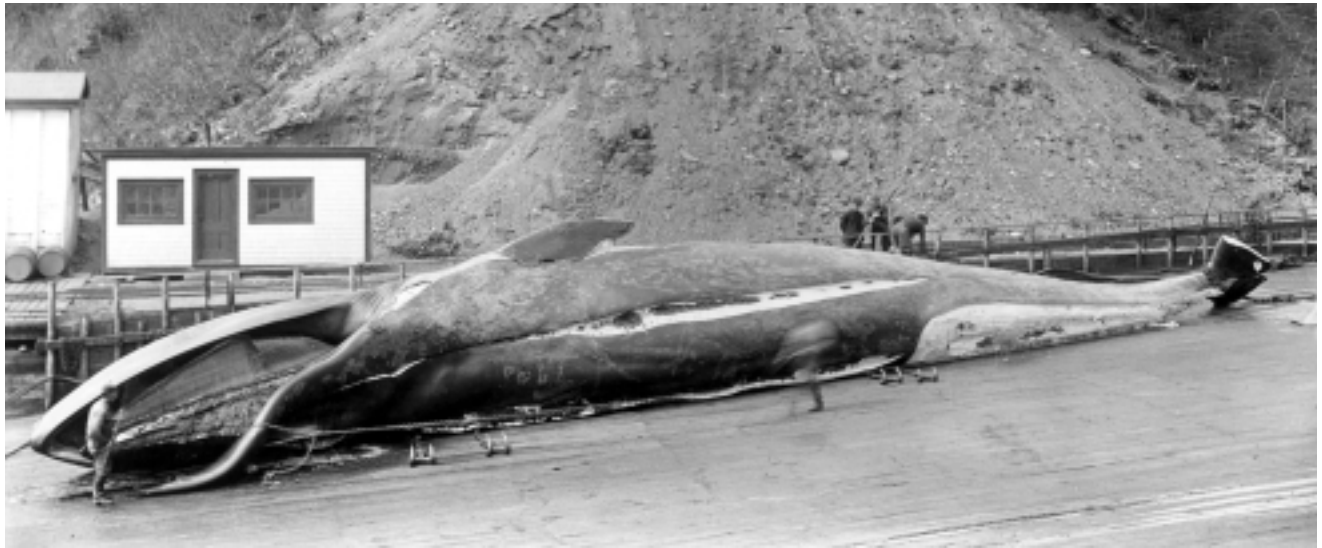
Figure 25.—Partly flensed blue whale awaiting further processing at an Alaska whaling station.

Based on whaling records, Gambell (1976) estimated that from 1,100 to 1,500 blue whales occurred in the entire North Atlantic prior to commercial exploitation (Gambell, 1976), although according to the IWC's Scientific Committee this estimate is statistically unreliable.