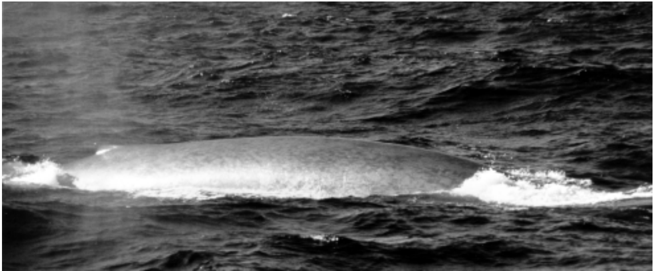
Figure 23.—A blue whale surfacing. Note the mottled coloration and very small dorsal fin. J. M. Waite, NMML Collection.