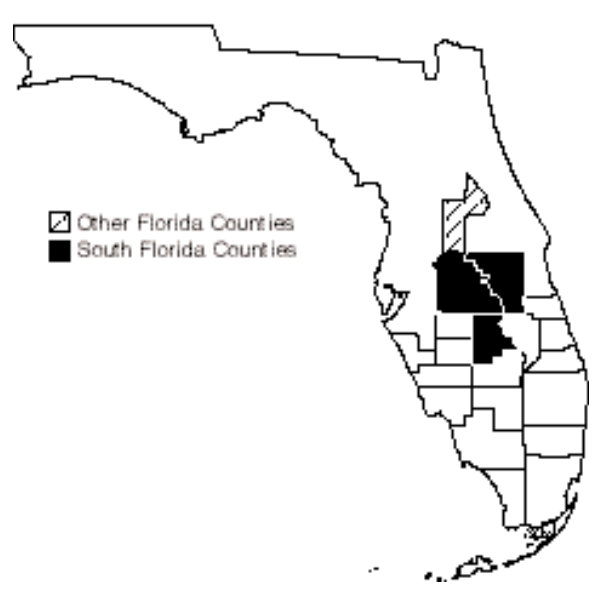
Figure 1. County distribution of the pygmy fringe-tree.

Chionanthus pygmaeus is a large shrub that occurs primarily in scrub as well as high pineland, dry hammocks, and transitional habitats in central Florida. Much of this species' habitat has been lost because of land clearing for citrus production and residential development. As a result, it was listed as an endangered species on January 21, 1987. Habitat acquisition and development of suitable land management actions are helping to conserve this species.