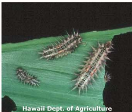
Hawaii Dept. of Agriculture Nettle caterpillar eating a Ti tree ( Cordyline fruticosa ) leaf

The nettle caterpillar is not currently known to be in Maui County. This caterpillar is a larval form of an Asian moth. This caterpillar is a larval form of an Asian moth. This caterpillar grows up to 25 mm (1 in) and is covered in rows of poisonous spines. The coloration is variable, ranging from white to light grey, with a dark stripe running down the length it back. The nettle caterpillar has been found on many plants, including palms, coconuts, ti, dracaena, starfruit, coffee, and honohono grass.