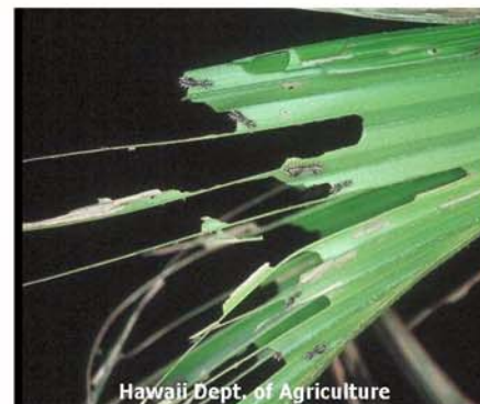
Hawaii Dept. of Agriculture Damage done while feeding on coconut ( Cocos nucifera ) fronds