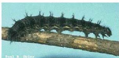
Painted Lady ( Vanessa cardui )