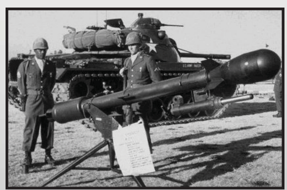
The Davy Crockett weapons system is mounted on a vehicle and prepared for launch.

The desert temperature hovered at 90 degrees Fahrenheit the morning of July 17, 1962 at the Nevada Test Site (NTS). Eventually the beating sun would increase the heat to over 105 degrees later that day, but at 10:00 a.m., a crowd of 396 spectators braved the scorching temperature and relentless sun to witness the last atmospheric test ever conducted by the United States. The crowd gathered in Area 18 of the NTS, approximately two miles from ground zero, where a Davy Crockett weapon system would soon launch the Little Feller I shot.