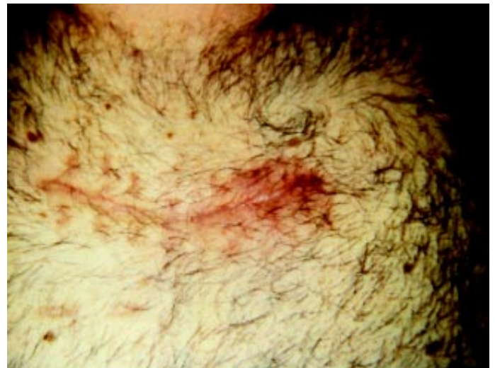
Figure 1. Surgical site infection following minimally invasive valve surgery.

Surgical site infections after minimally invasive cardiac surgery pose a challenge to the clinician. Physical findings of sternal instability and sternal click of the median sternotomy cannot be applied to many incisions used in minimally invasive cardiac surgery (Figure 1). The initial experience of