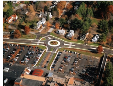
Top: Grand Loop Road, Yellowstone National Park. Bottom: MassHighway's new Project Development and Design Guide features Nationwide best practices.