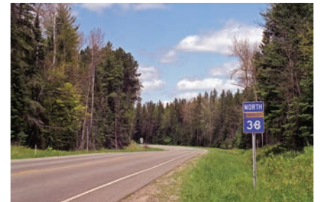
Minnesota Trunk Highway 38.