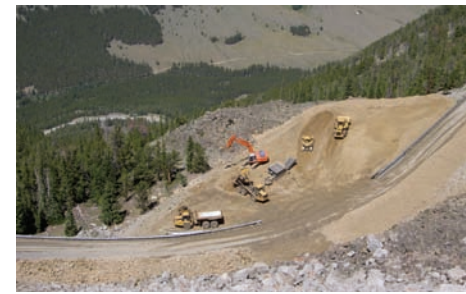
Beartooth Highway, MT.

The Beartooth Highway begins at the northeast entrance to Yellowstone National Park and links the communities of Cooke City and Red Lodge,