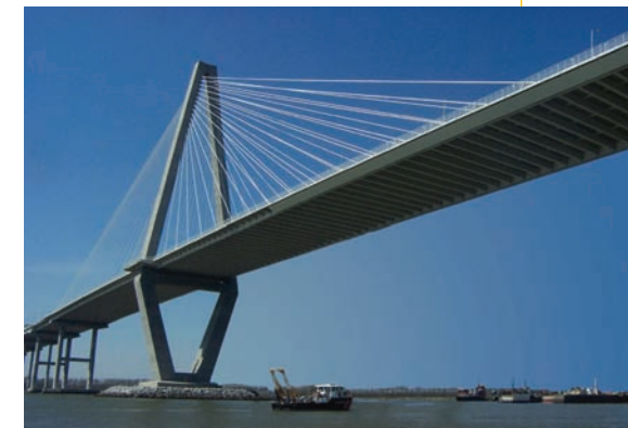
Top: Cooper River Bridge, Charleston, SC. Bottom: North Torrey Pines Road Bridge, San Diego, CA.