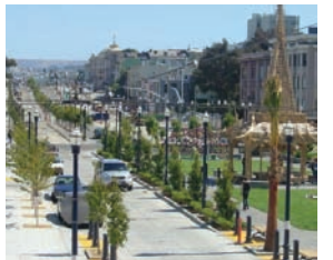
Octavia Boulevard, San Francisco, CA.