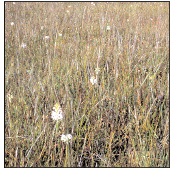
Cutthroat grass community.

utthroat grass ( Panicum abscissum ) is a central peninsular Florida endemic species, found in scattered locations from Orange County south to Palm Beach County. However, it seems to dominate natural communities almost exclusively within Polk and Highlands counties, in association with the sideslopes of the central Florida Ridges. Cutthroat grass communities are mostly associated with areas of slight to strong groundwater seepage; however, not all cutthroat grass communities are well-developed seepage slopes.