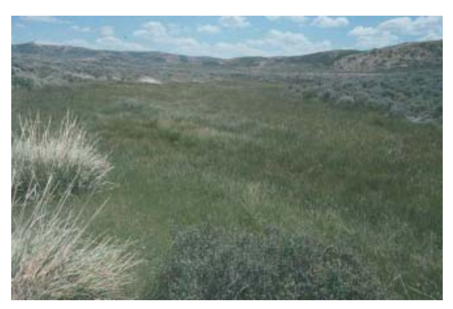
Page 34-1 Riparian grassland, Wild Cow