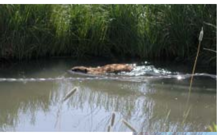
Page 38-5 Beaver