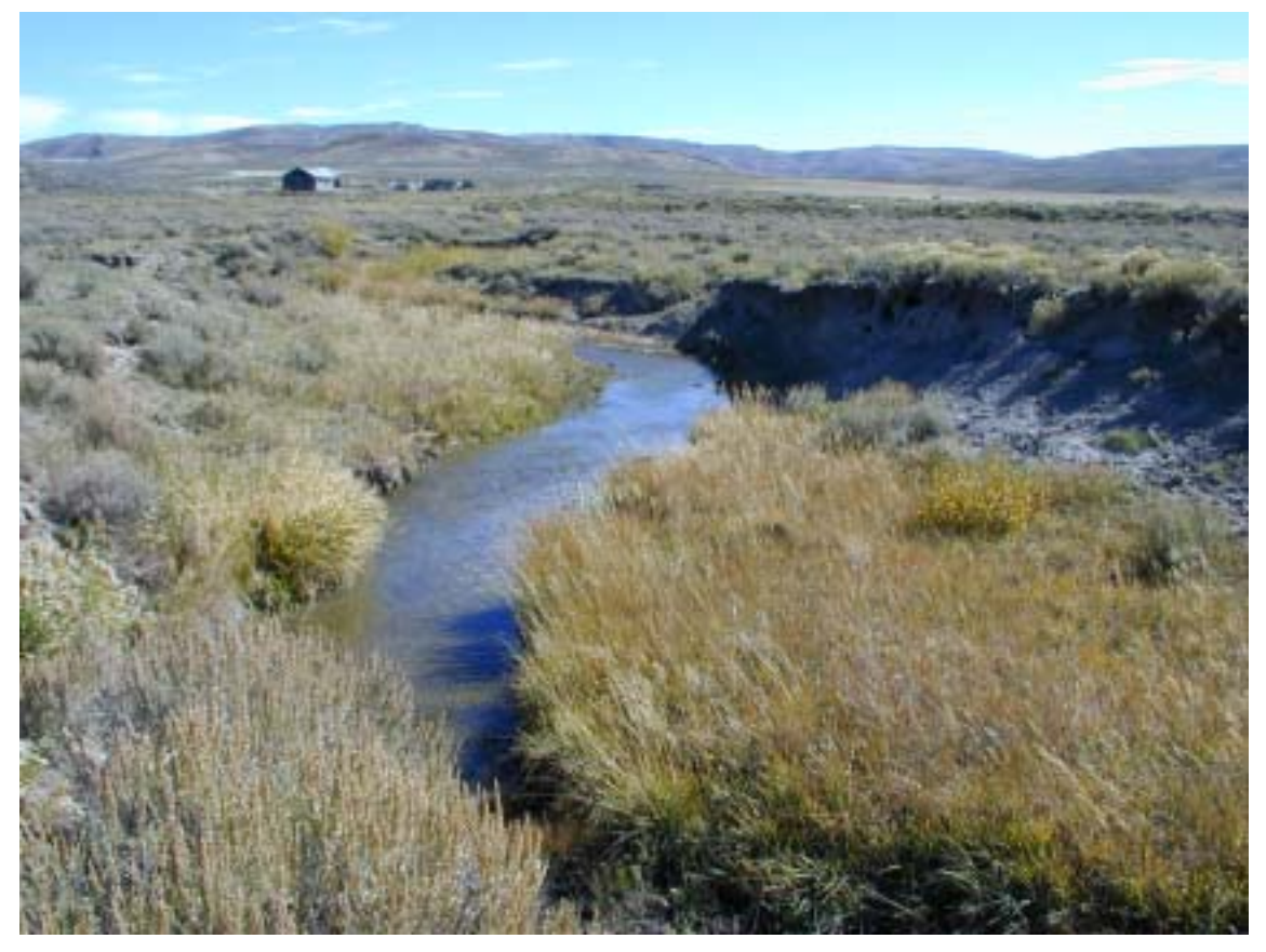
Page 39-4 Muddy Creek in the Sulphur Springs allotment, 2002