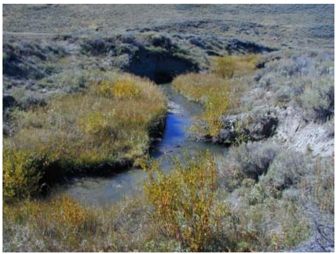
Page 36-2 Muddy Creek in Sulphur Springs allotment, 2002