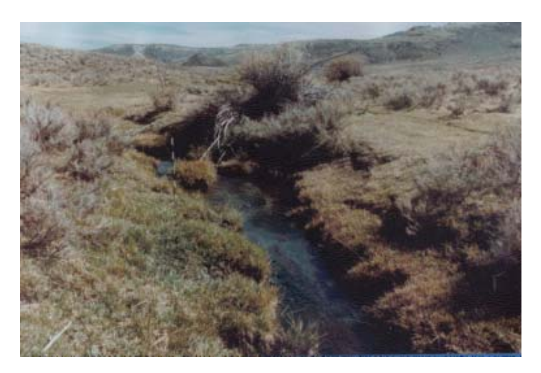
Page 38-1 Muddy Creek in the Grizzly allotment, 1987