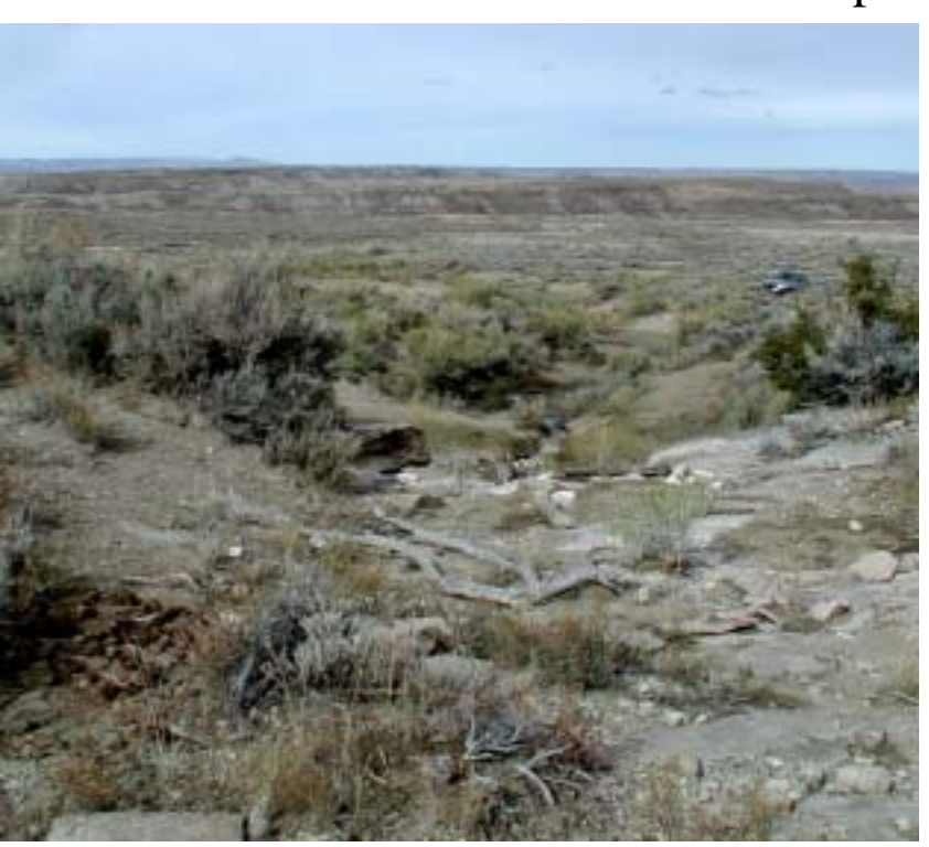
Page 41-1 Moonshine Springs in the Adobetown allotment