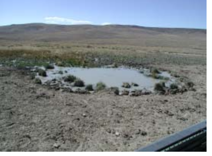
Page 35-8 Seep in Cherokee allotment, livestock use