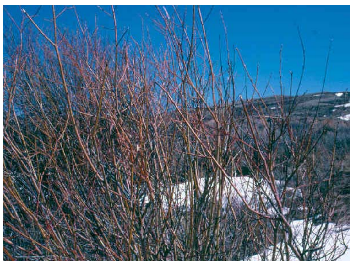
Page 38-3 Spring elk use of willow over four feet above the ground, Grizzly allotment