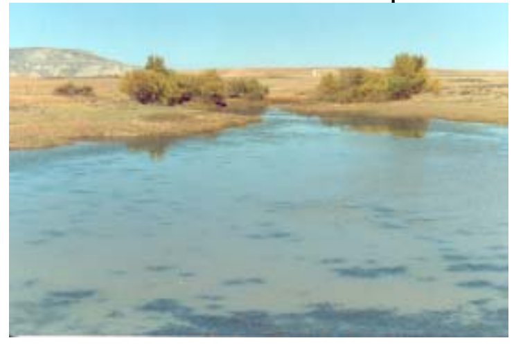
Page 35-5 Little Robber Reservoir