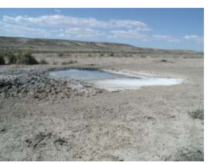
Page 35-6 Hartt Cabin Draw, Sand Creek allotment Wild horse and livestock use