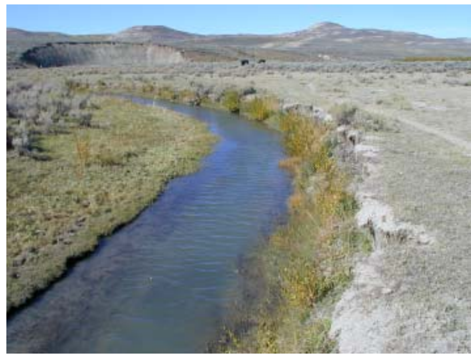
Page 42-2 Booth willow stem plantings along Muddy Creek, after 3 years