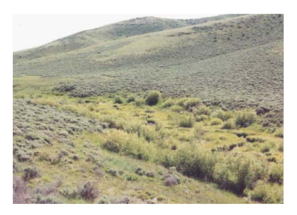
Page 34-2 Riparian shrubland, McCarty Creek