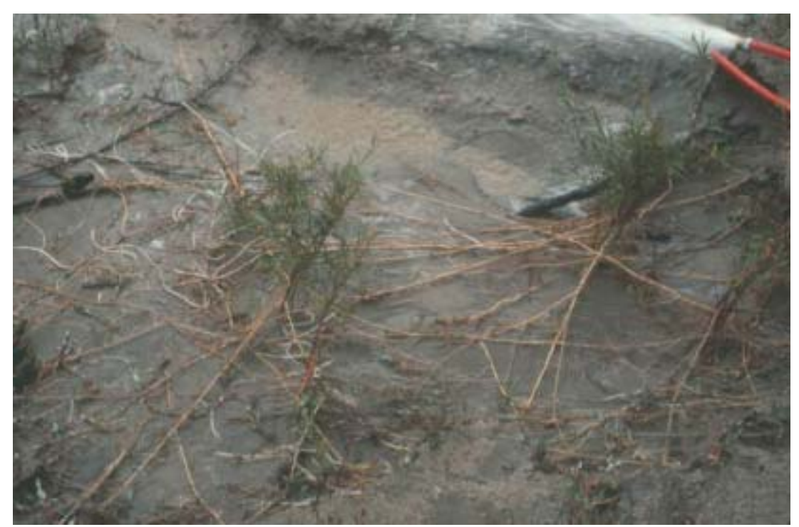
Page 42-1 University of Wyoming study of willow plantings and root growth