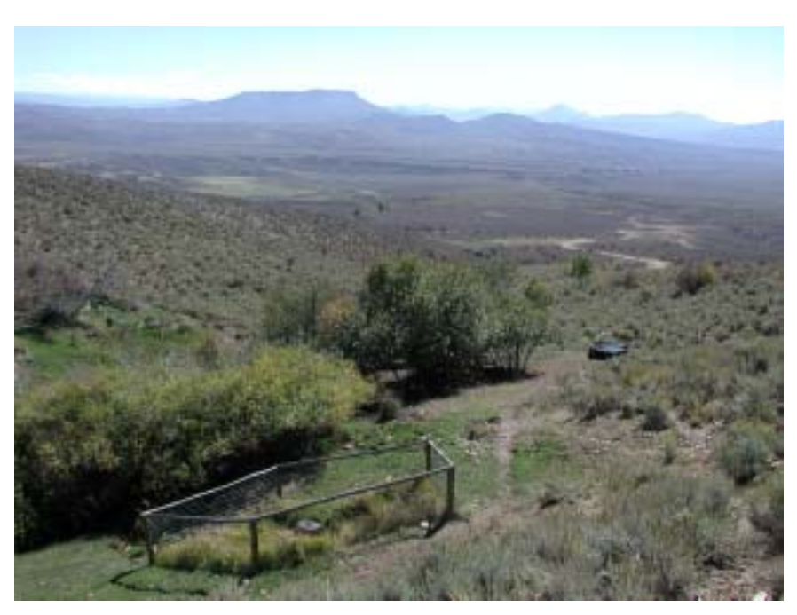
Page 38-4 Spring development at Cherry Grove, Morgan-Boyer allotment