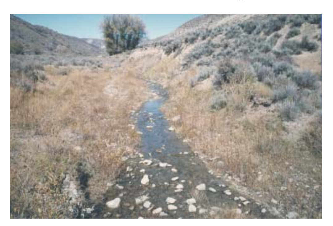
Page 43-3 Loco Creek in the Morgan-Boyer allotment, 1992