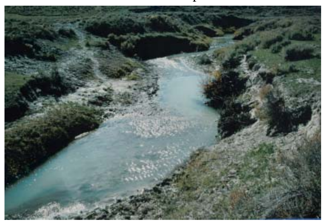
Page 36-1 Muddy Creek in Sulphur Springs allotment, 1989