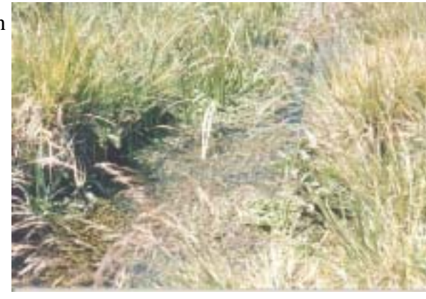
Page 34-4 Aquatic vegetation