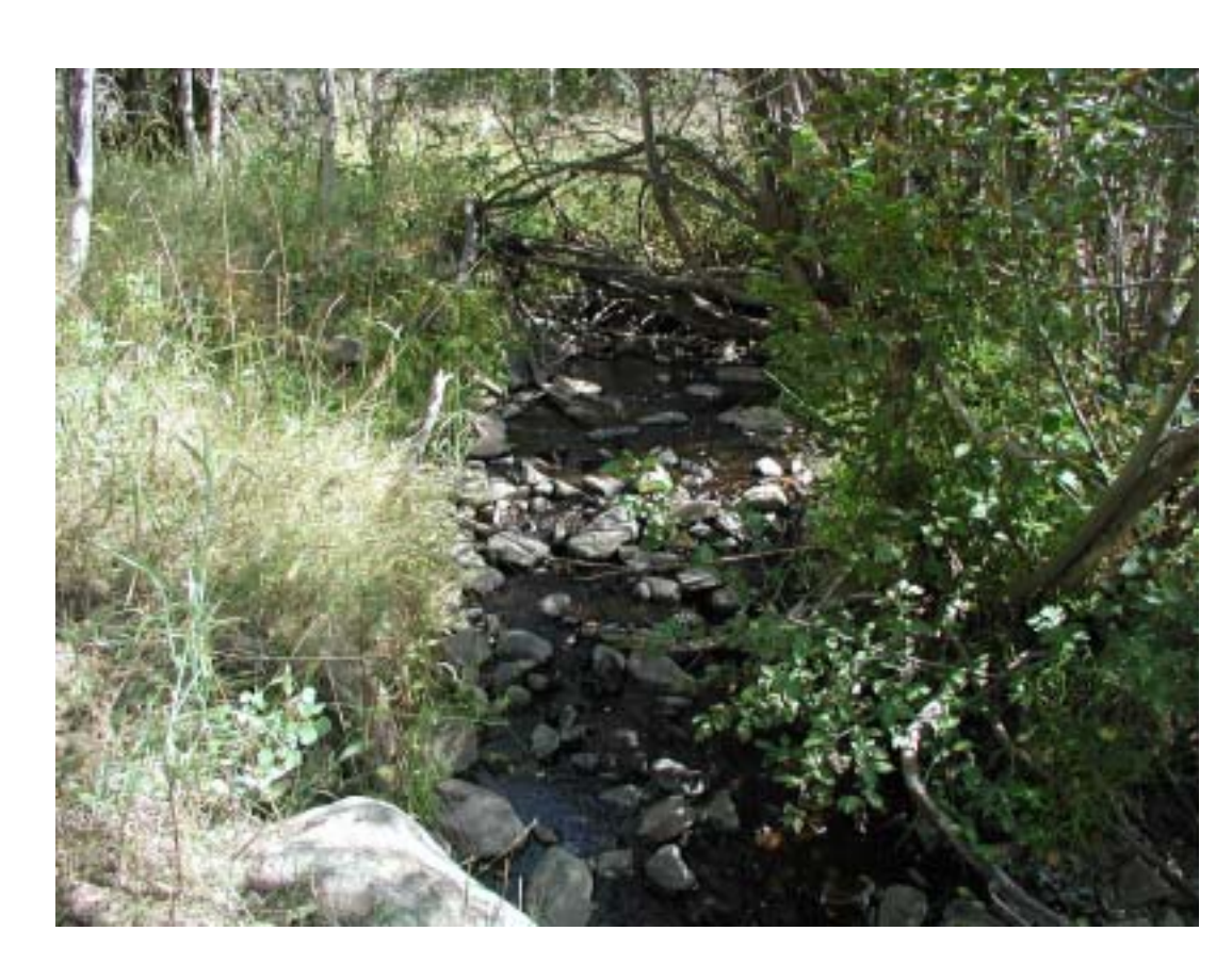
Page 37-2 Hell's Canyon Creek in Hell's Canyon allotment