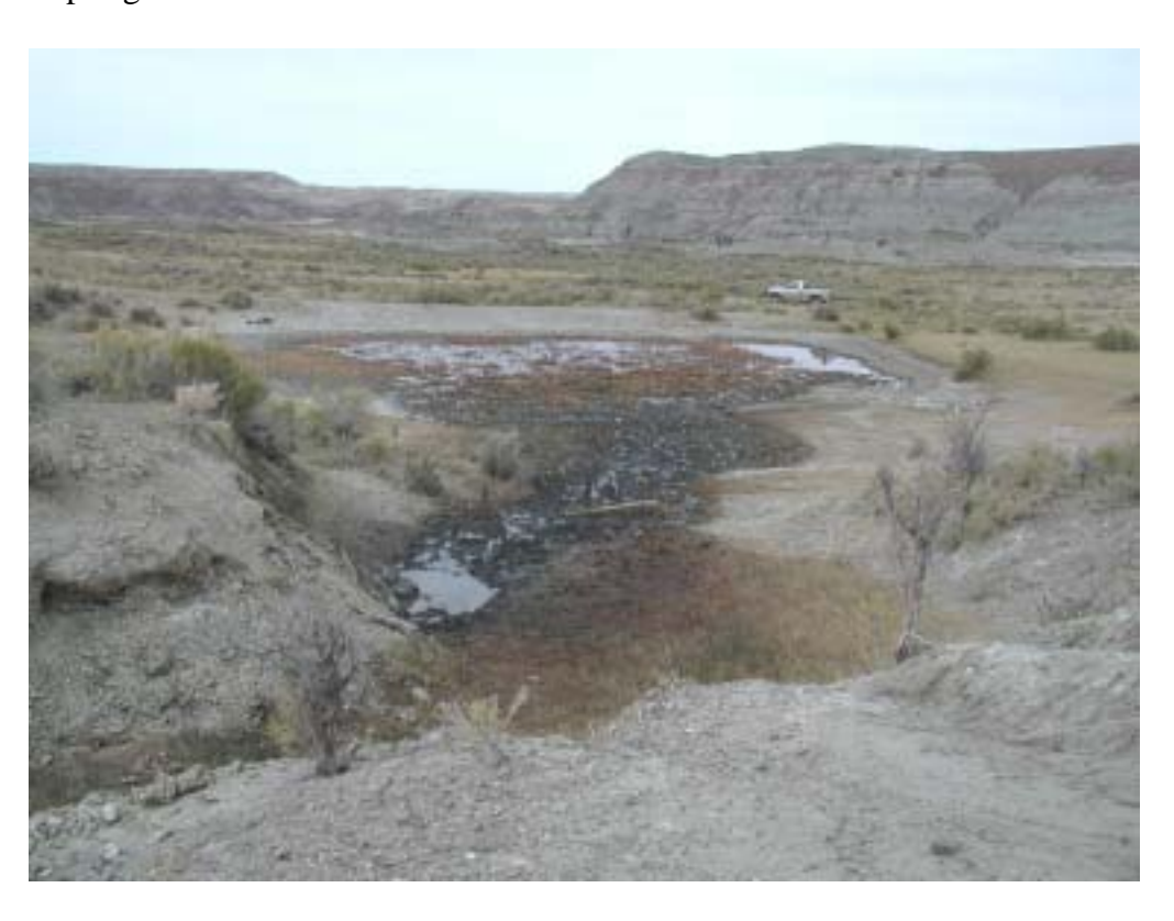
Page 41-2 Grindstone Spring in the Grindstone Spring allotment