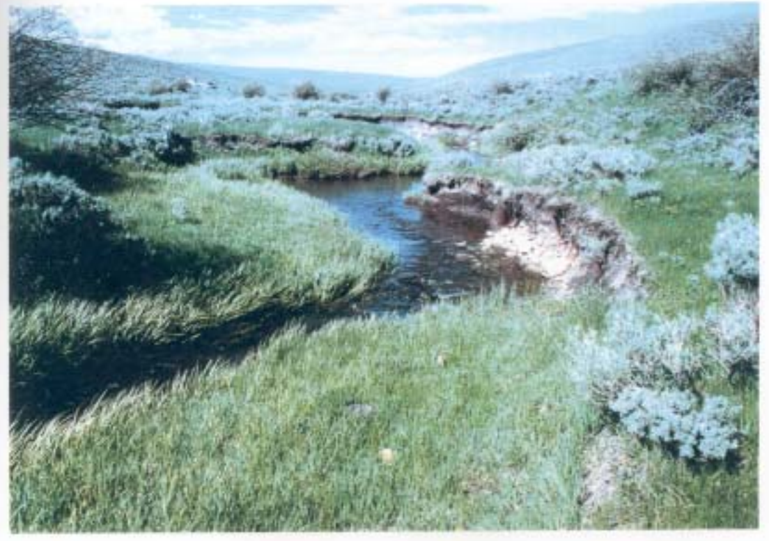
Page 43-2 Little Muddy Creek in the Grizzly allotment, 1994