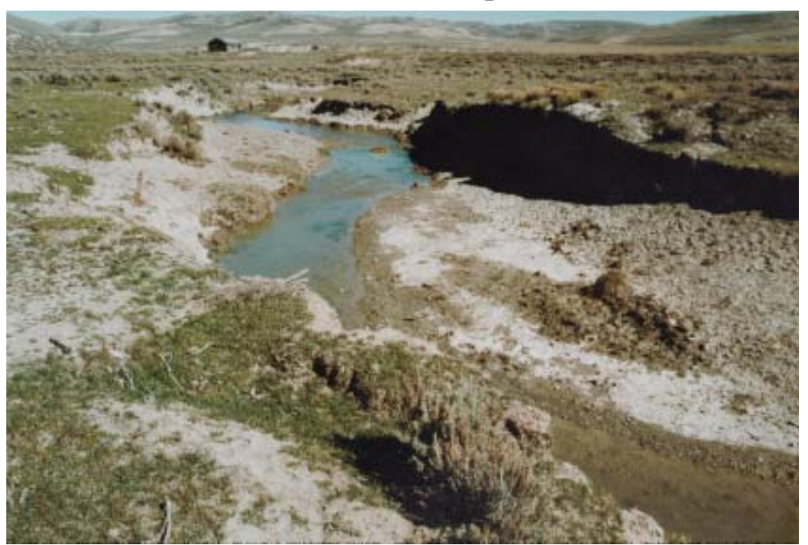
Page 39-3 Muddy Creek in the Sulphur Springs allotment, 1989