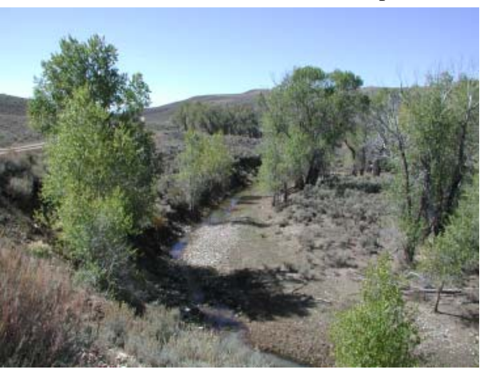
Page 34-3 Cottonwood riparian woodland, north of Dixon