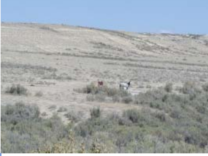
Page 35-7 Wild horses at Hartt Cabin Draw