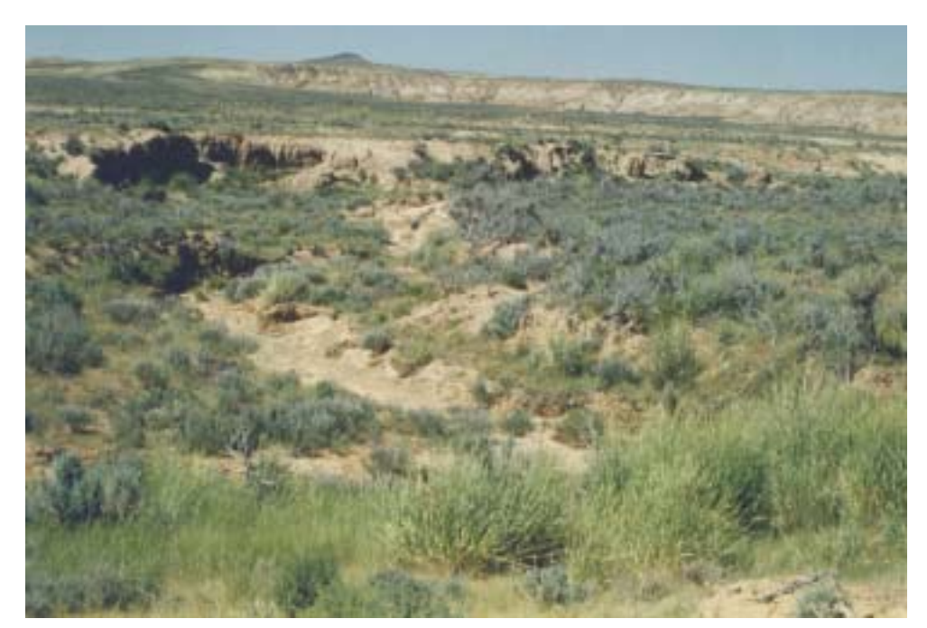
Page 39-1 Ephemeral drainage, Barrel Springs