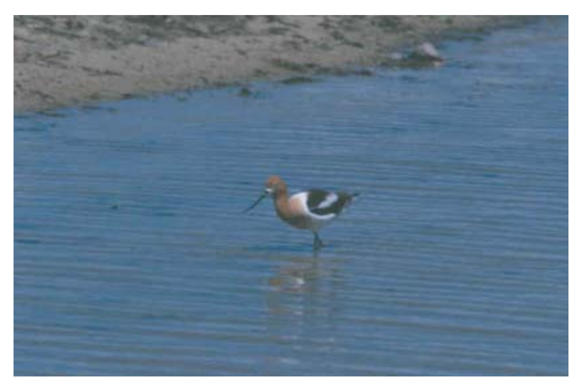
Page 39-2 Playas provide avocet habitat on a seasonal basis