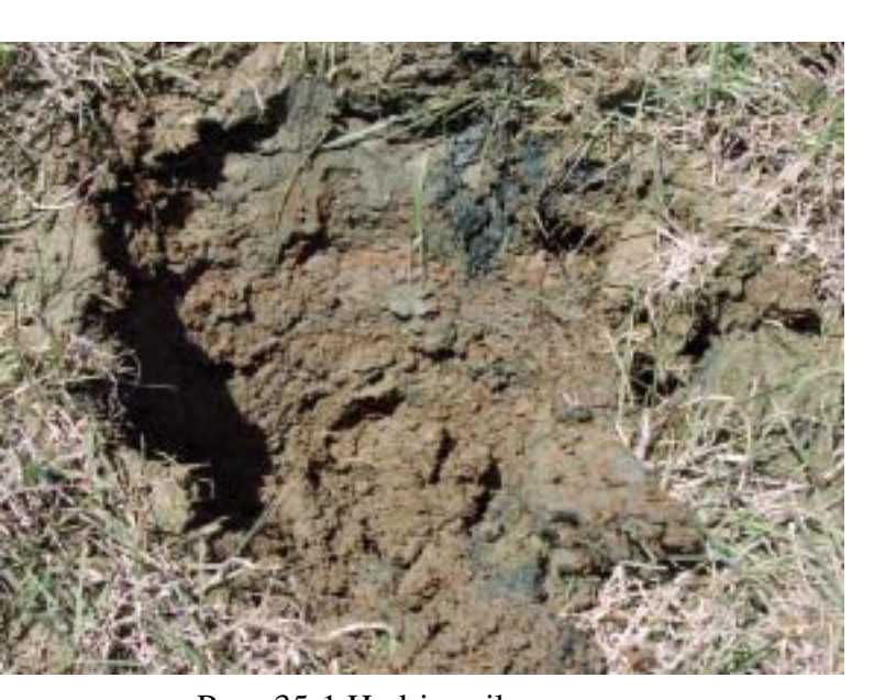
Page 35-1 Hydric soil