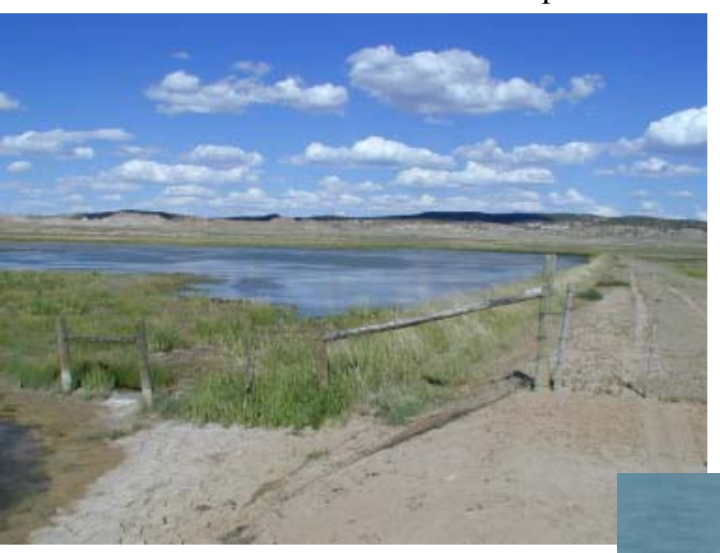
Page 35-2 George Dew Wetlands