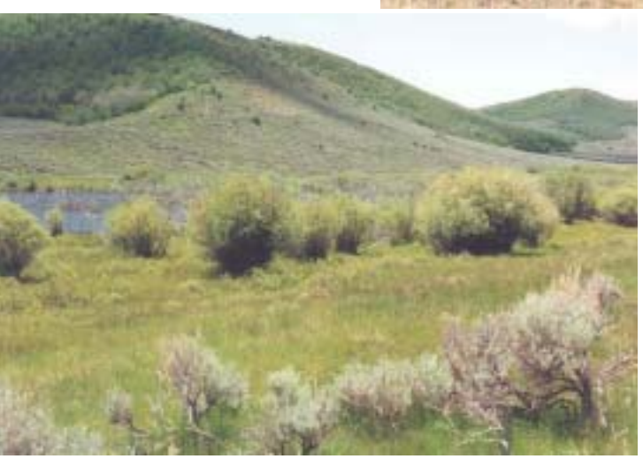
Page 38-7 Large beaver dam, Little Savery Creek