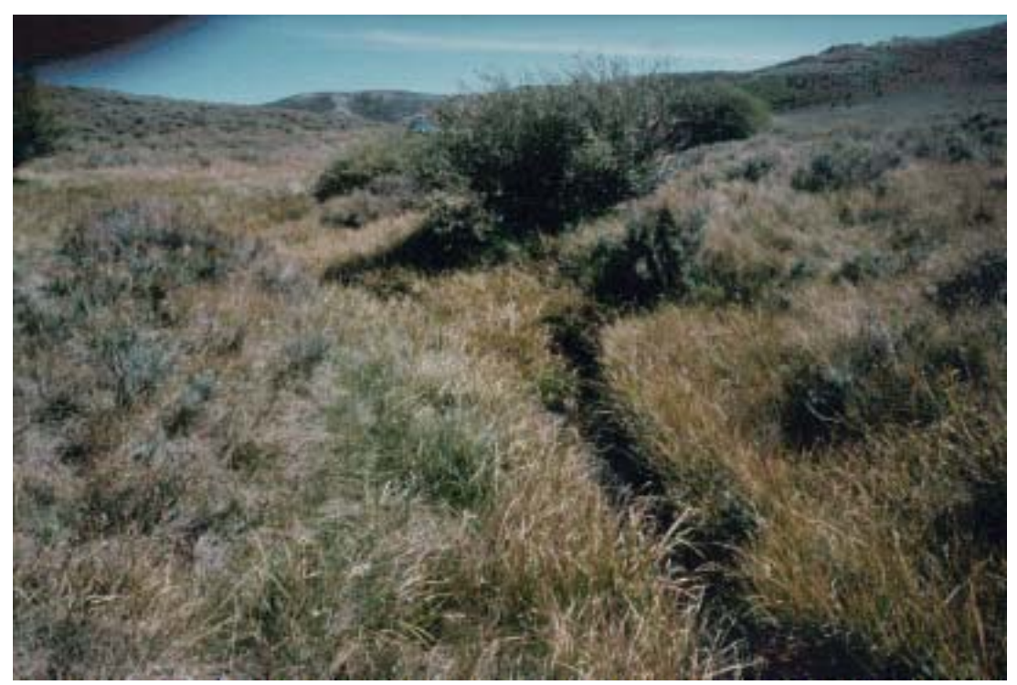
Page 38-2 Muddy Creek in the Grizzly allotment, 2000