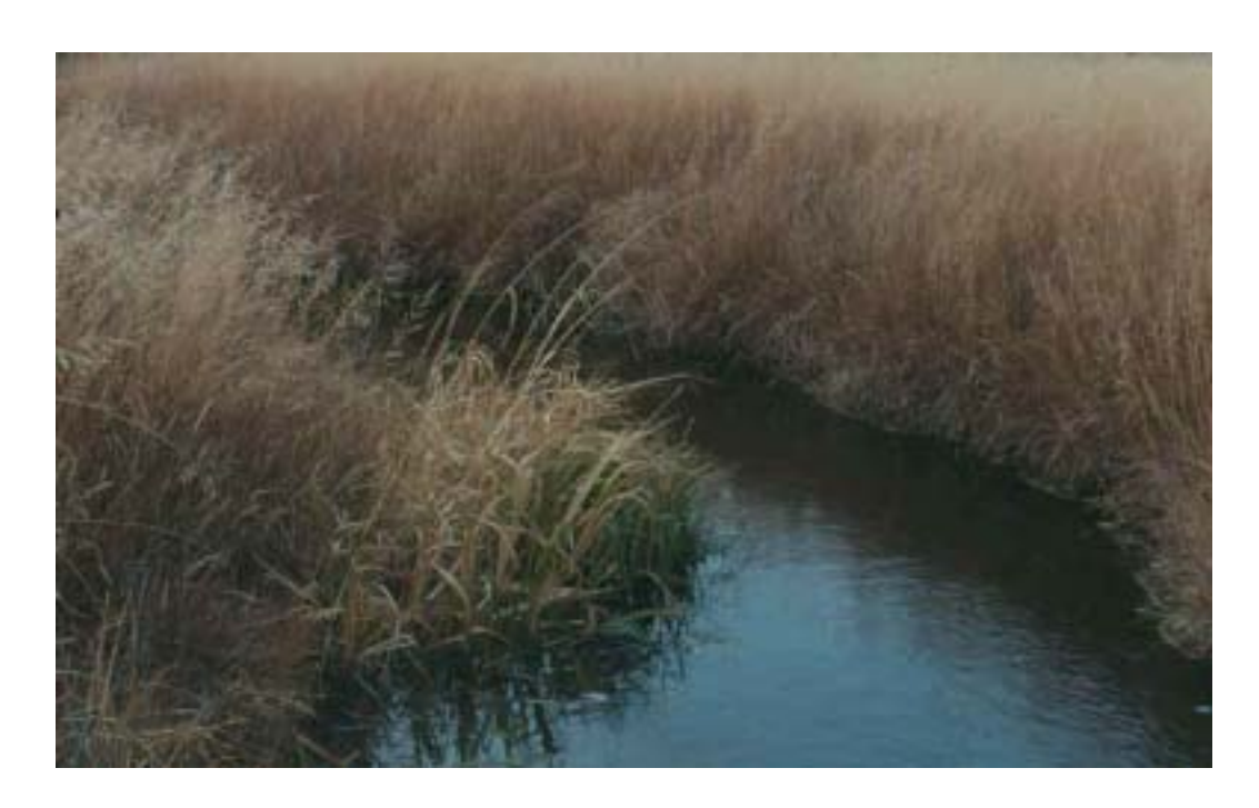
Page 44-1 American mannagrass