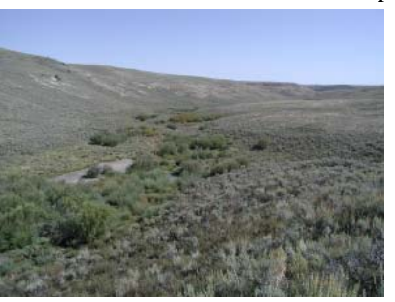
Page 37-1 Upper Bird Gulch, Rasmussen allotment