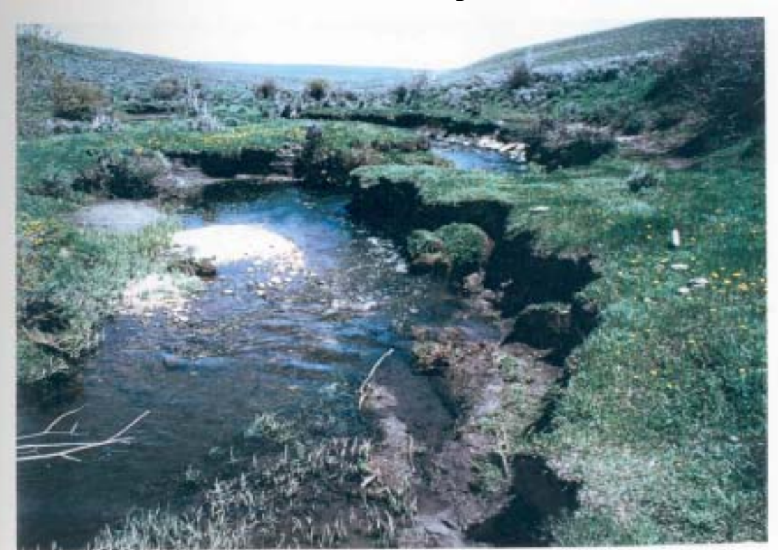
Page 43-1 Little Muddy Creek in the Grizzly allotment, 1983