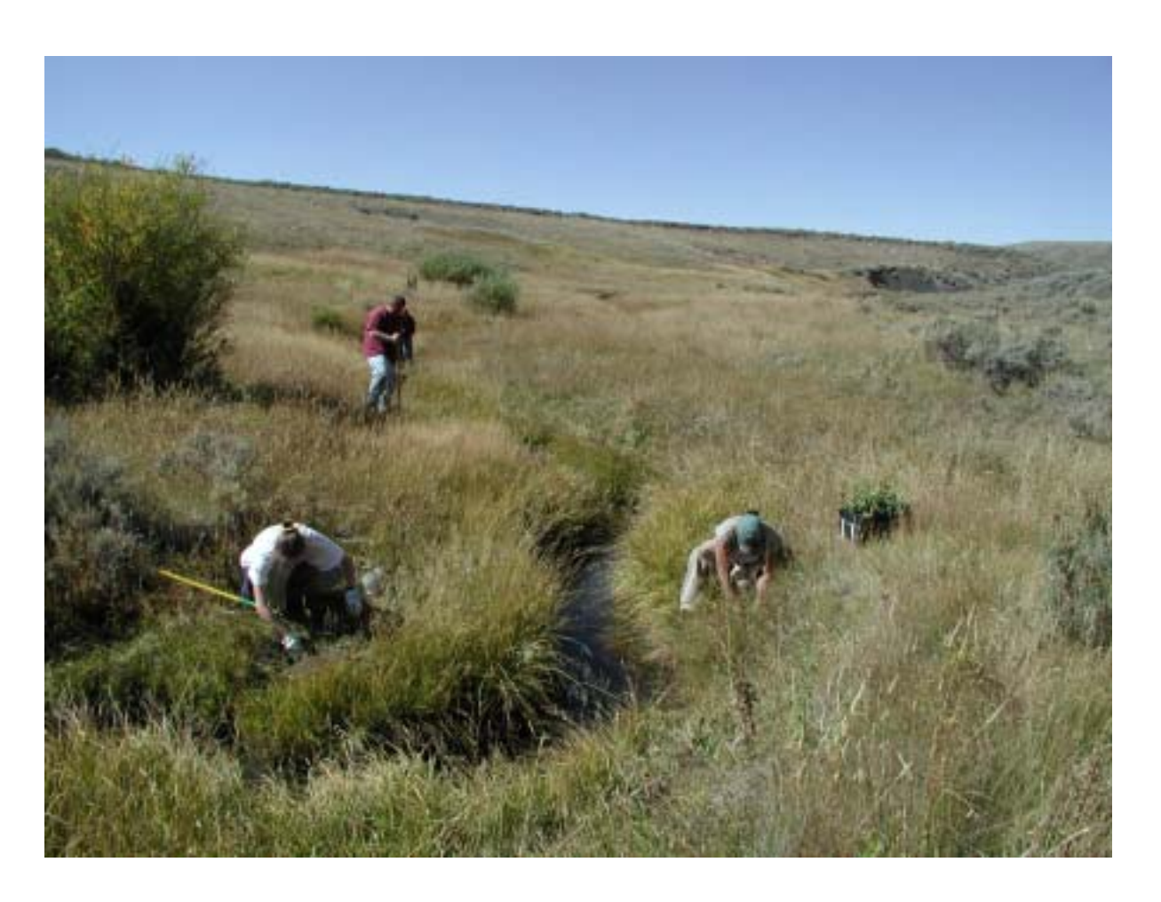
Page 45-1 Planting along Littlefield Creek, 2000