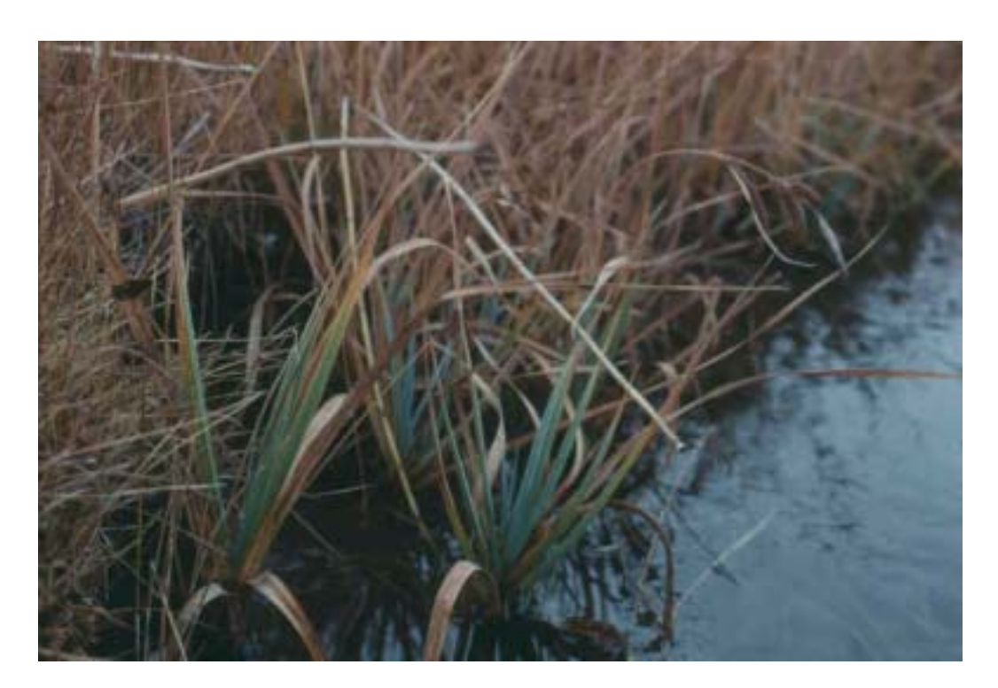
Page 43-5 Nebraska sedge